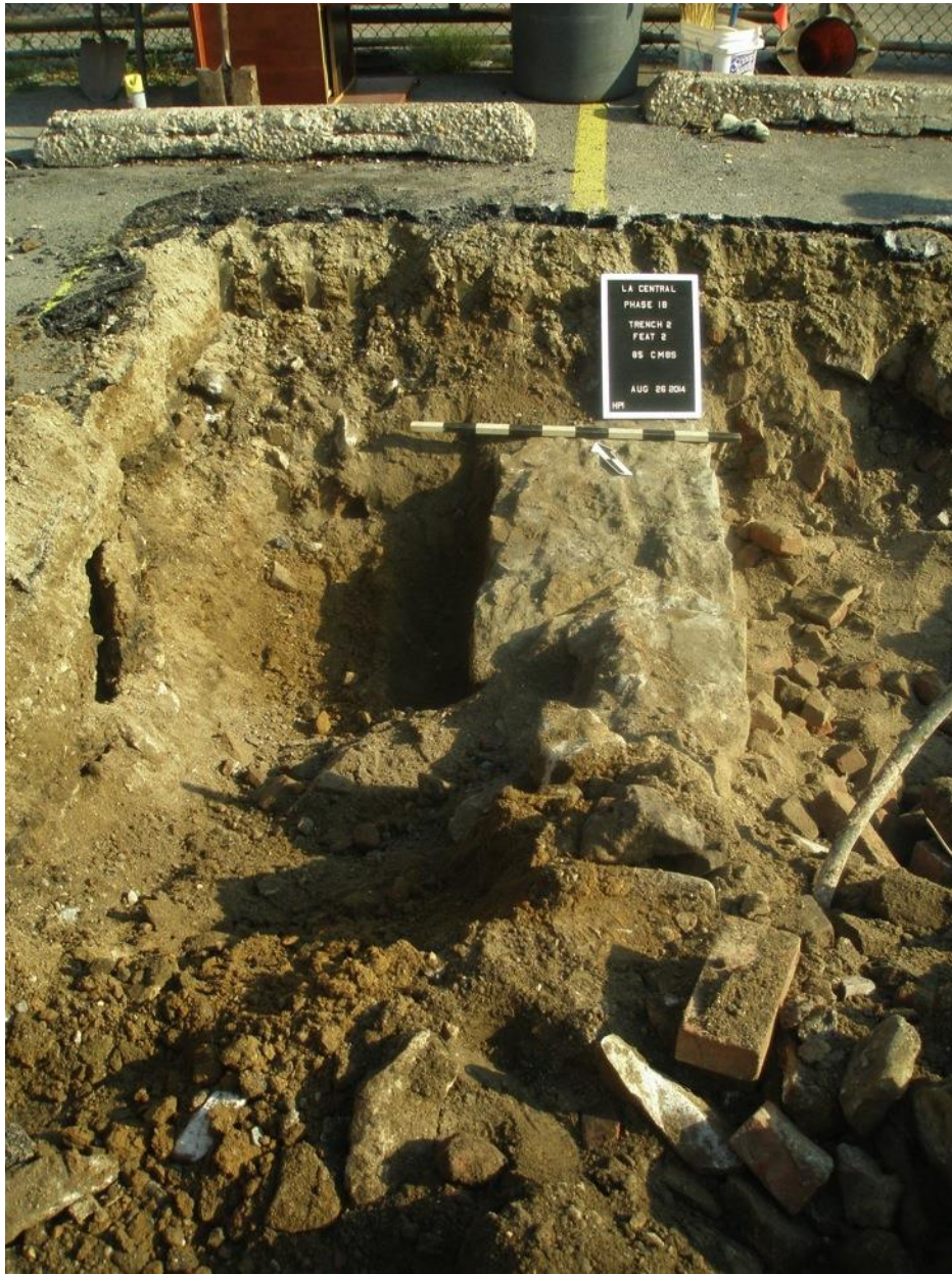
Photograph 8. Trench 2, Feature 2, Foundation Wall.