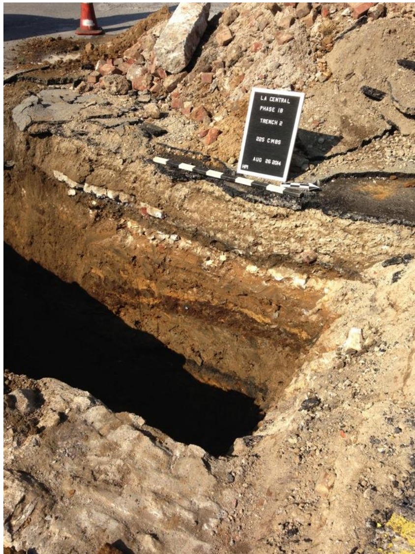
Photograph 7. Fill Strata and Redeposited Subsoil in Trench 2.