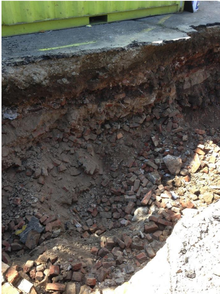
Photograph 3. Trench 1, Fill Strata.