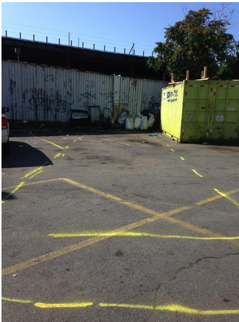
Photograph 1. Location of Trench 1 Prior to the Field Excavation.