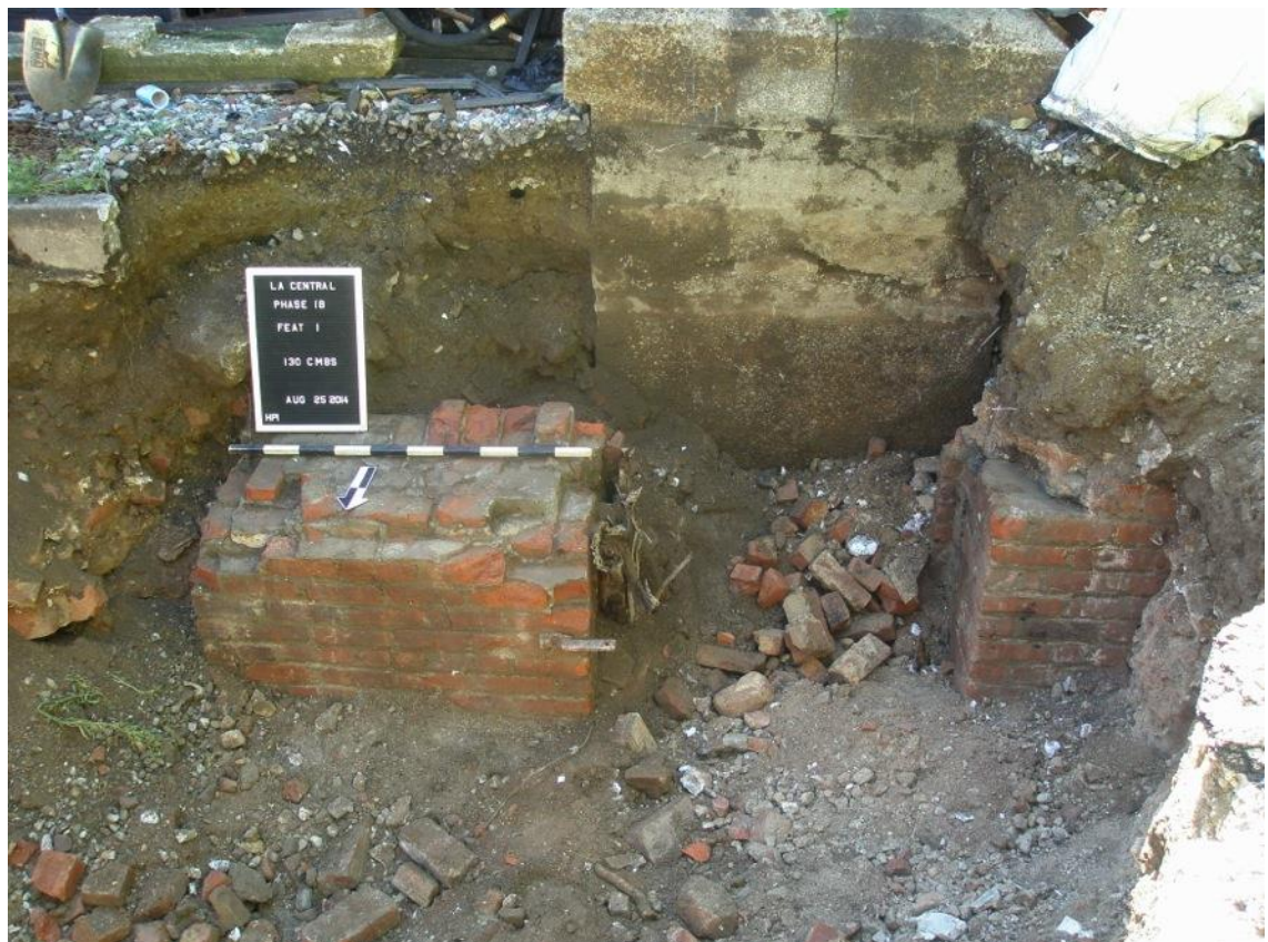
Photograph 5. Trench 1, Exposed Piers, Feature 1.