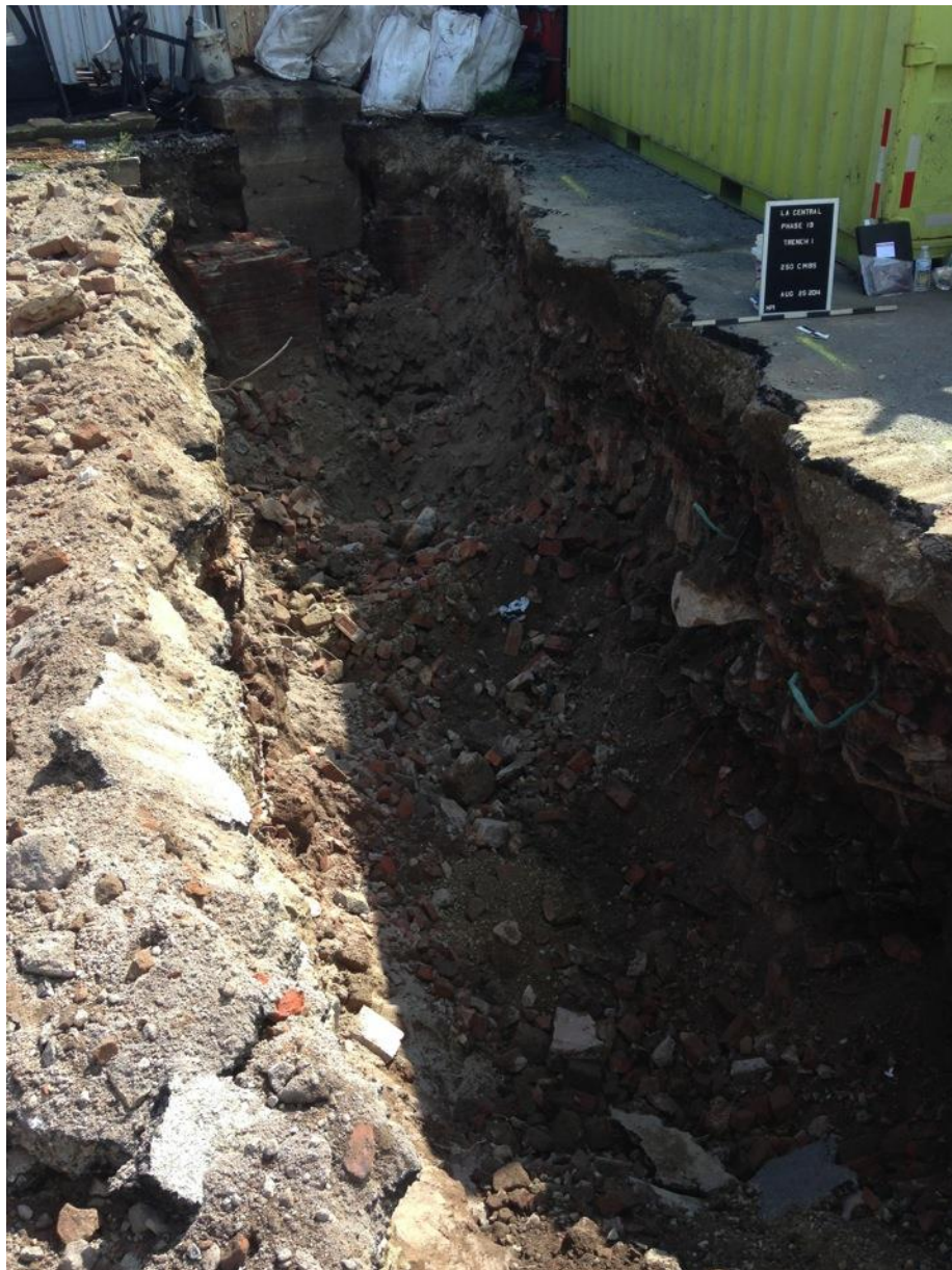
Photograph 6. Overview of Trench 1.