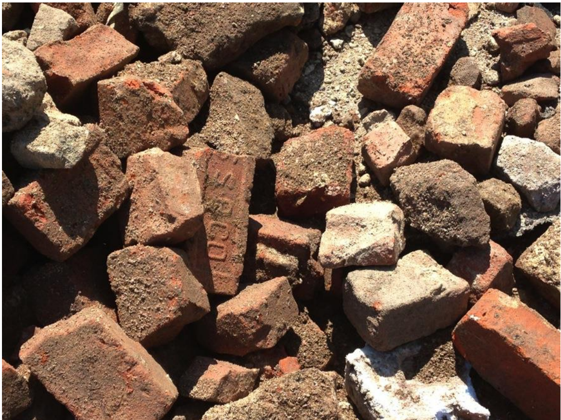
Photograph 4. Trench 1, Brick Rubble from Fill.