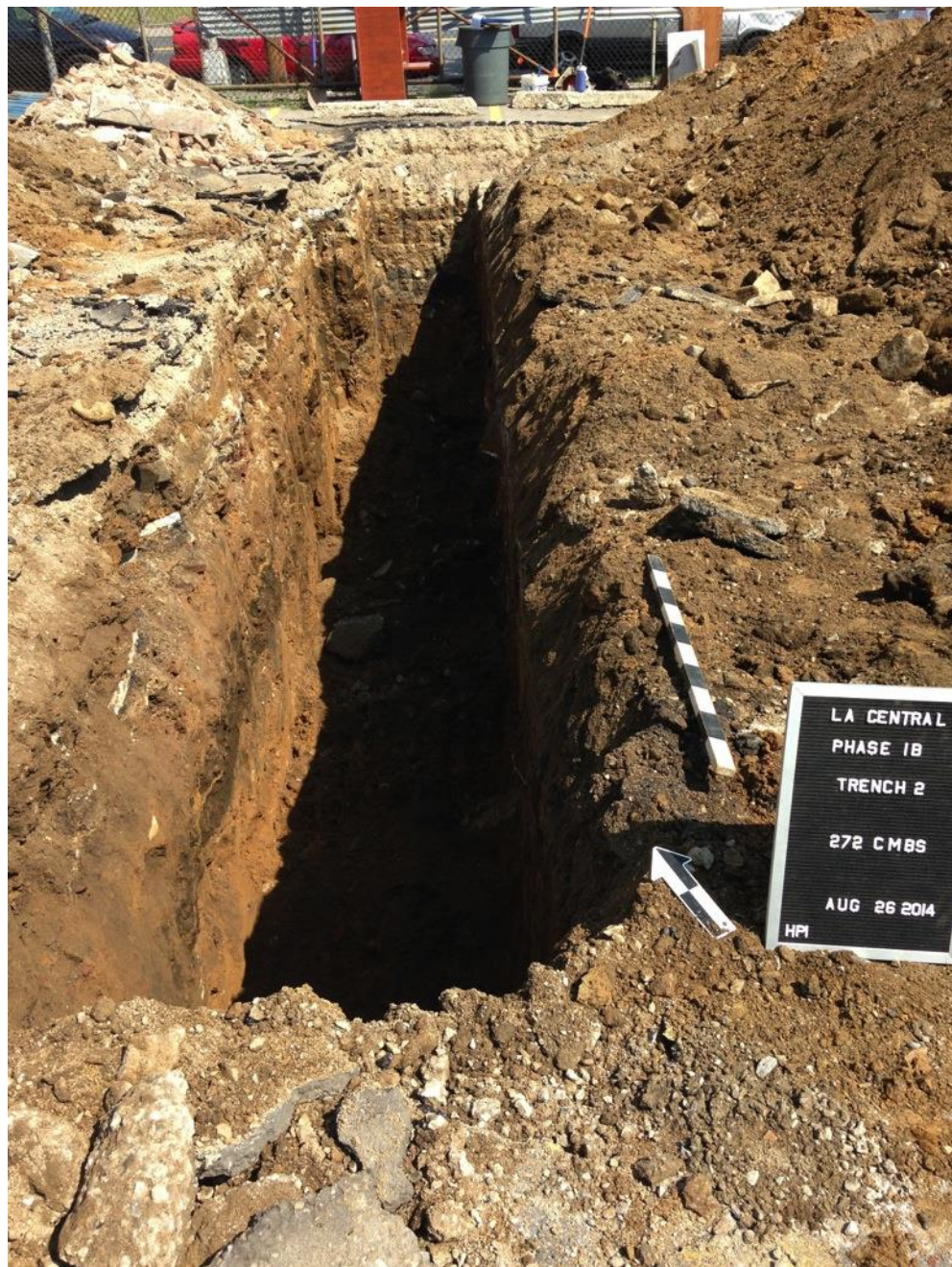
Photograph 9. Overview of Trench 2.