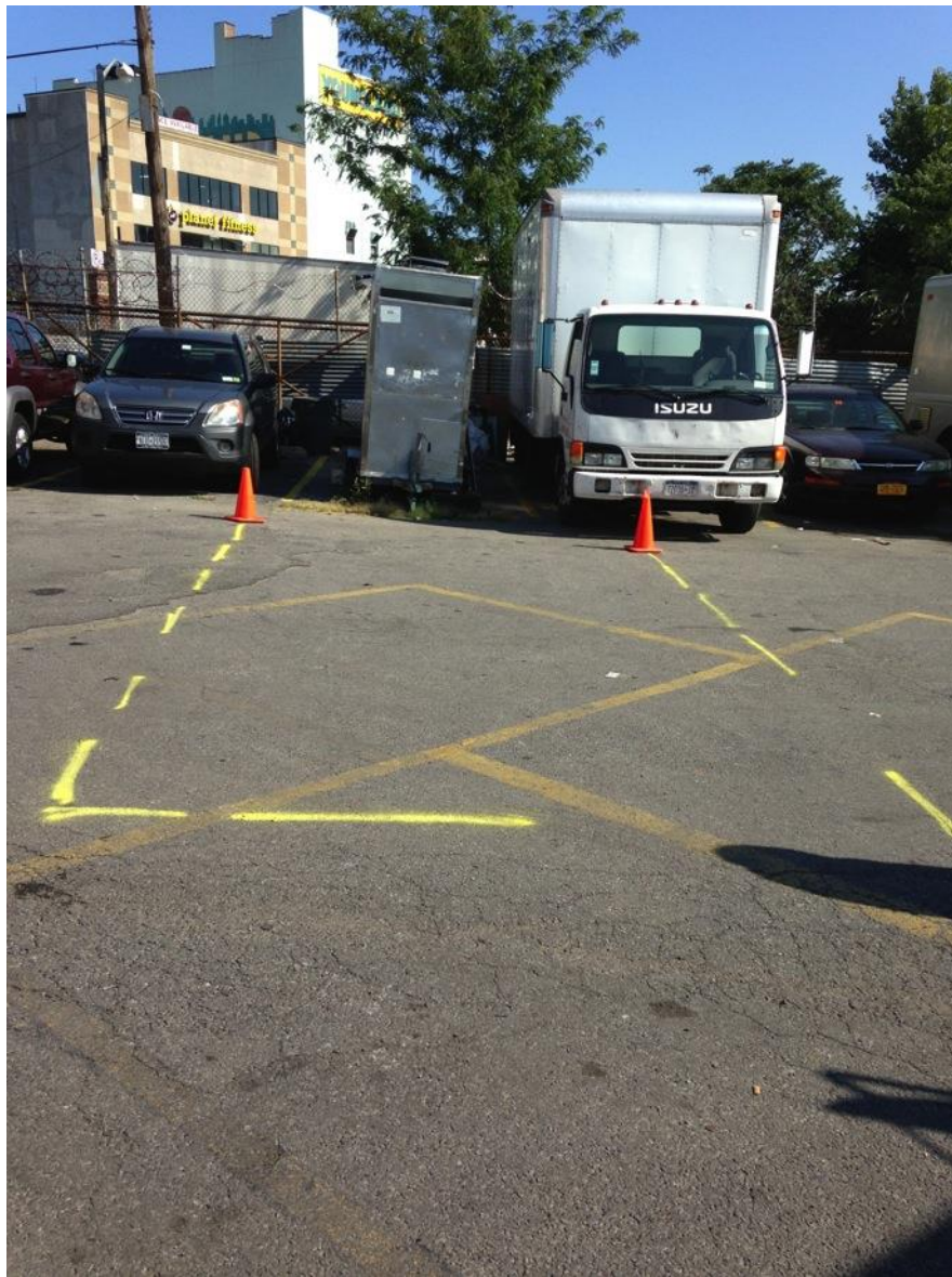
Photograph 2. Location of Trench 2 Prior to the Field Excavation.