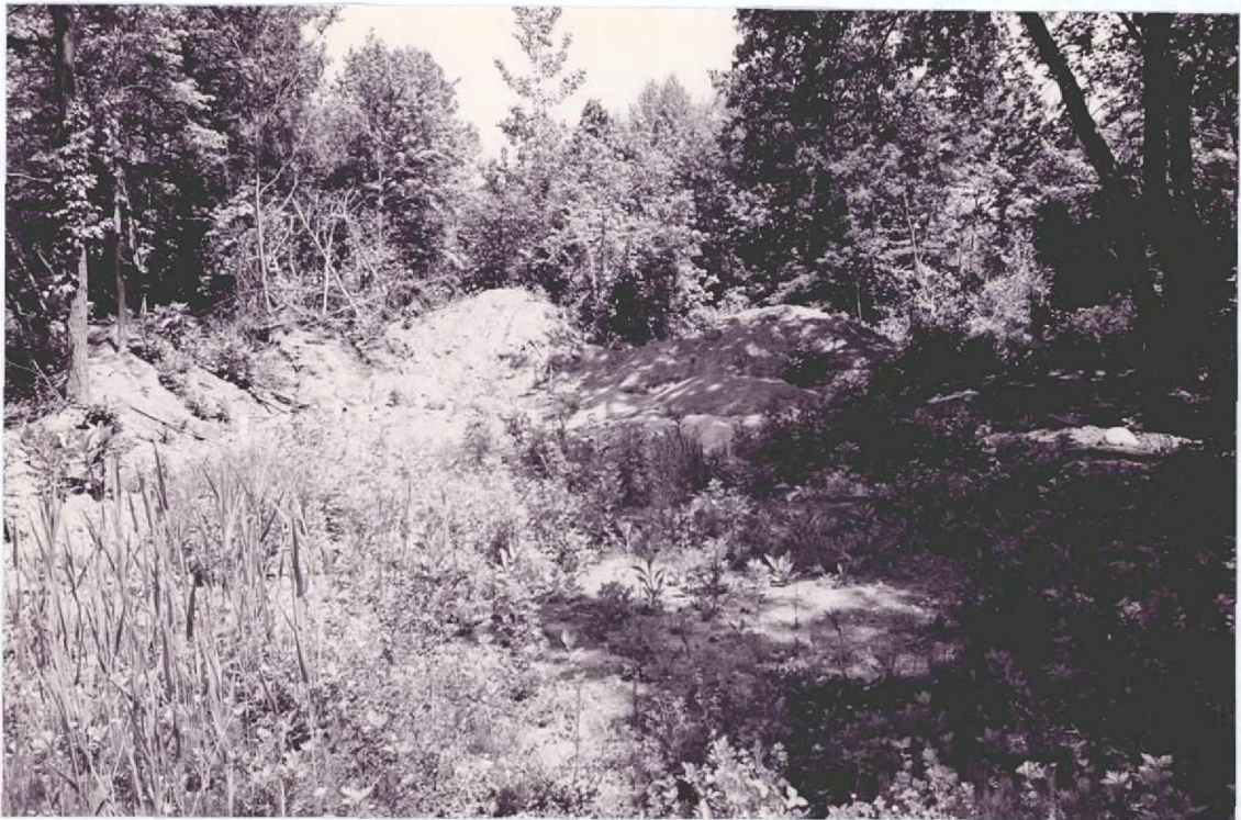
Plate 2 View of piles of fill and evidence of earth moving east of Shovel Test 11 looking east.