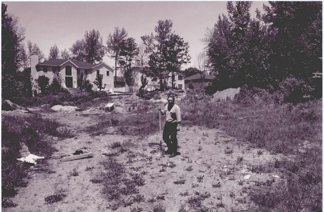
Plate 3 View of the central portion of the project area including Shovel Test 10 looking north towards Uncas Avenue. Note brick foundation to left of screen.