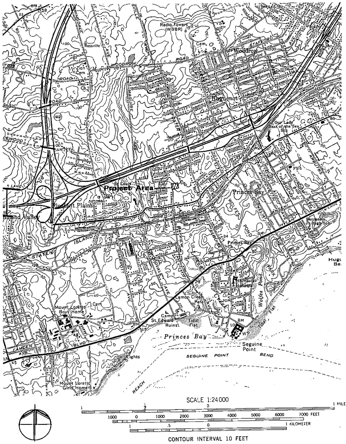
Figure 1 Project area location shown on portion of U.S.G.S. 7.5 minute series Arthur Kill N.Y.-N.J. Quadrangle, 1966, photorevised 1981.