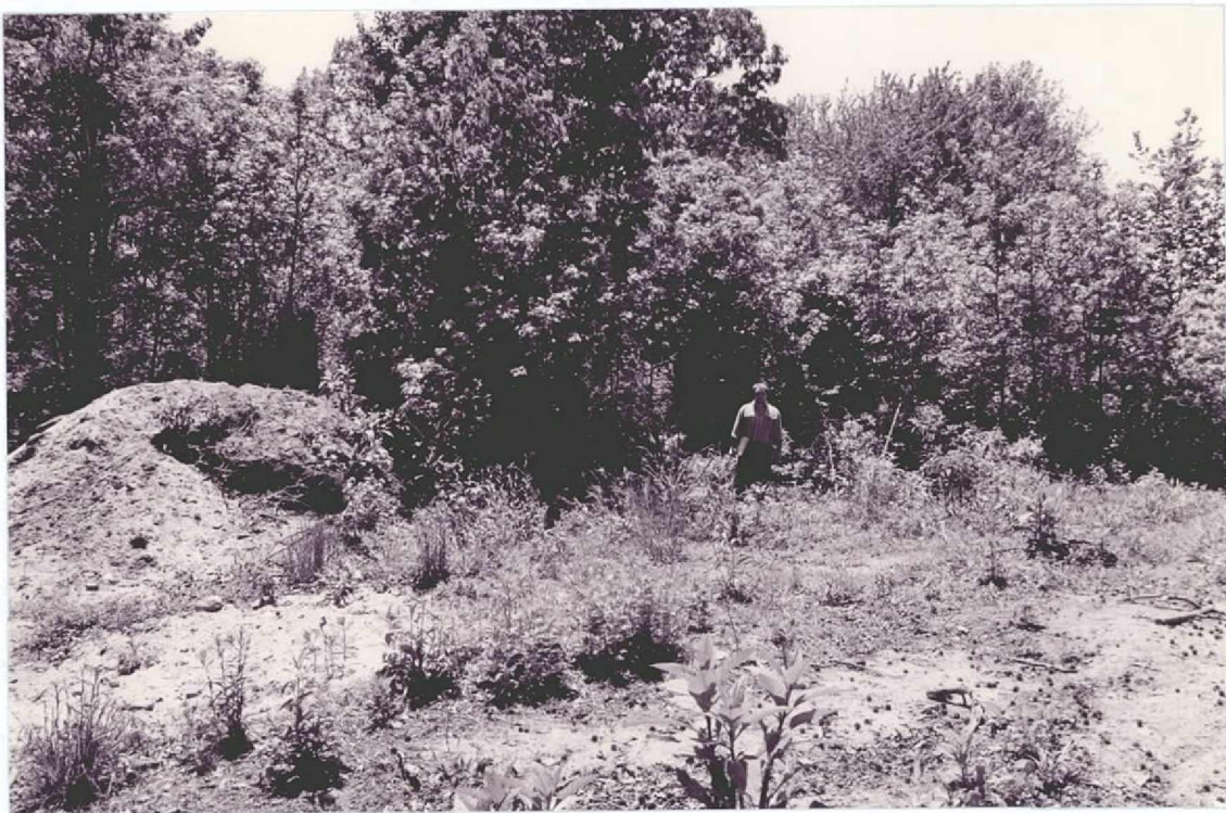
Plate 6 View of piles of fill looking southwest towards Shovel Test 9.