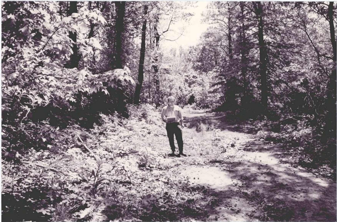
Plate 5 View of eastern portion of the project area looking south, showing road just east of Shovel Test 6.