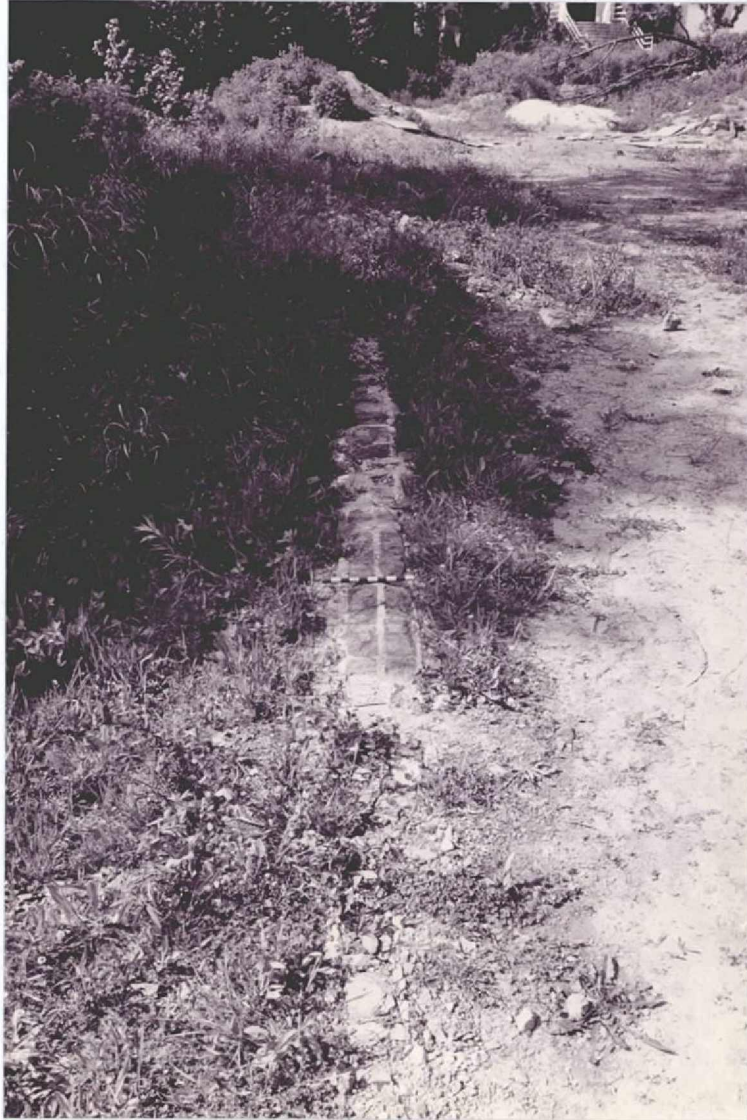
Plate 4 Detail of brick foundation looking north. Scale in tenths of feet.