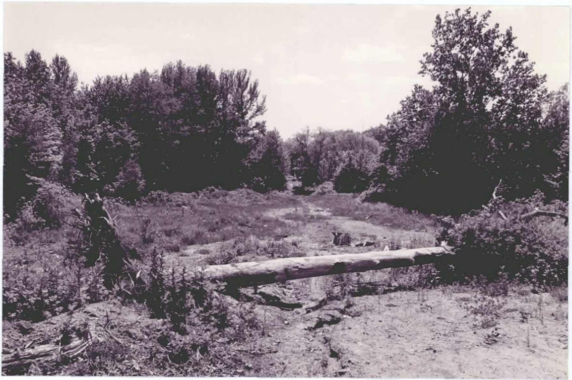
Plate 1 General view of the central portion of the project area looking south from Uncas Avenue.