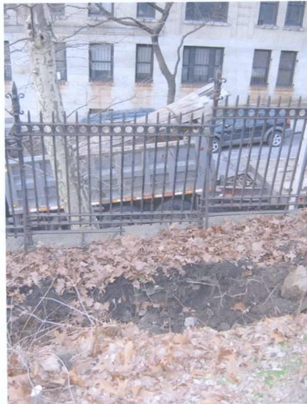
Figure 15: Excavation for new drain line