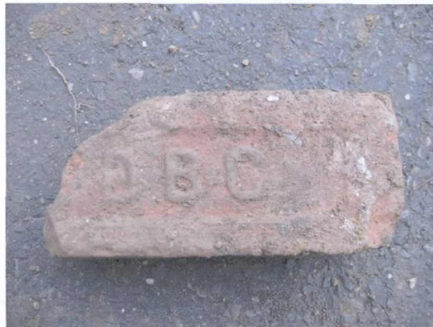
Figure 10: Brick embossed with DBC - from repair to existing retaining wall

Along the entire length of the drain line, no cultural resources were uncovered. The excavation revealed the same top and sub soils layers, followed by mica schist rocks, uncovered earlier.