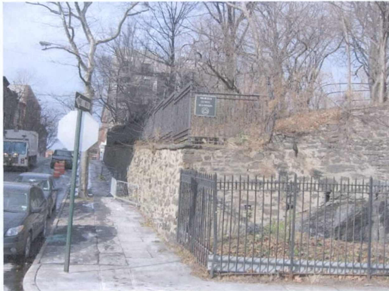
Figure 05: Southern wall prior to excavation work

The proposed plan called for the excavation of approximately ten (10) feet behind the retaining wall to allow for the installation of metal sheet piling that would then allow the mortared fieldstone wall to be carefully removed prior to reconstruction (Figure 05)