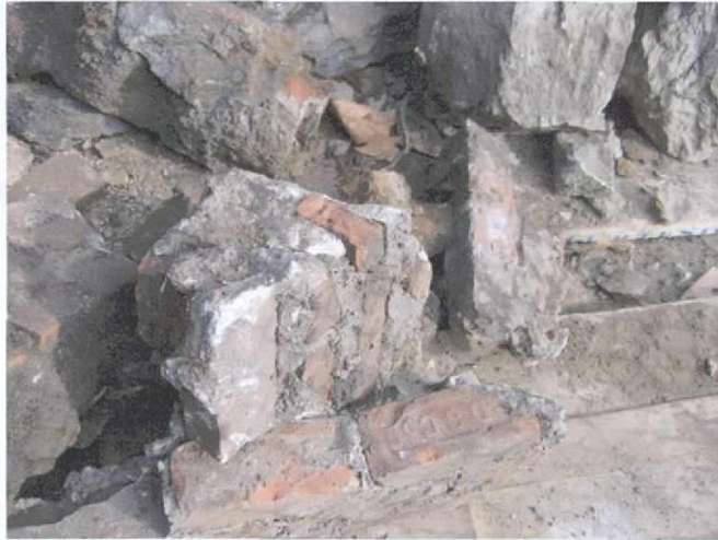
Figure 09: Brick used to repair the preexisting retaining wall (shown after collapse)

Only two artifacts were uncovered during this portion of the excavation. The first was an early twentieth century bottle that led to the assumption that the wall may have been disturbed and fixed some time after the turn of the twentieth century. The second were red bricks that may have been associated with a later repair to the wall, perhaps during the WPA period (Figures 09 and 10). The artifacts were noted, but not saved. No other cultural resource material or feature remains were uncovered during the excavation work.