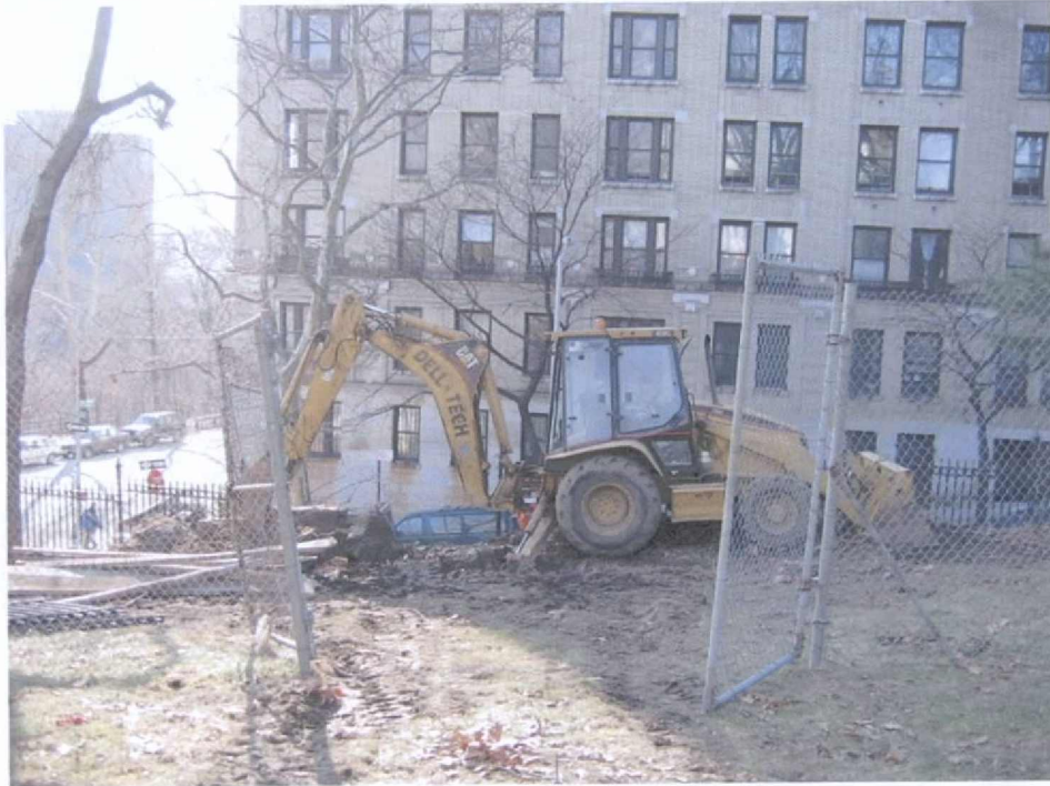
Figure 14: Excavation for drain line