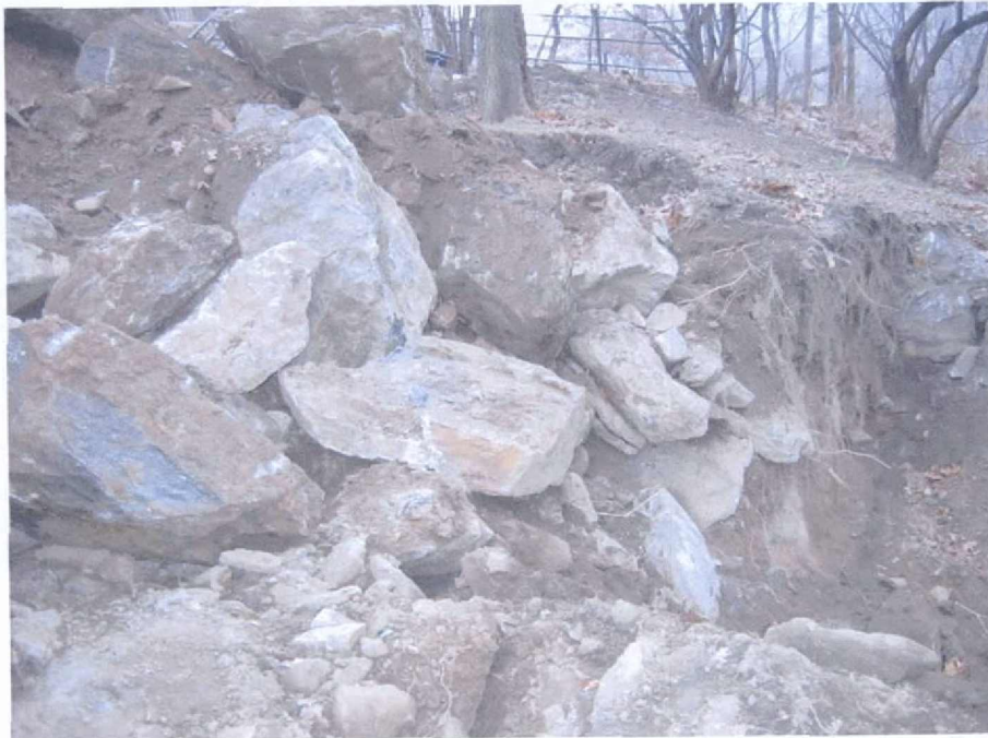
Figure 13: Rocky subsurface make-up of project area