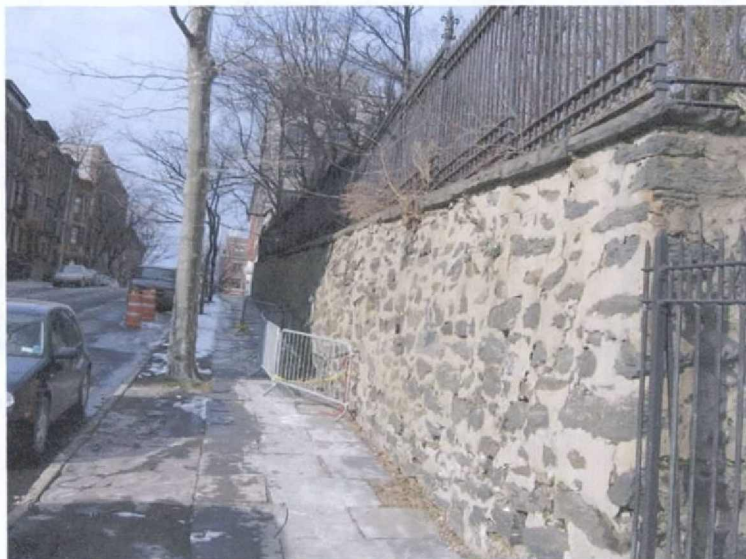
Figure 02: Southern retaining wall prior to collapse

Although the house remains on its original orientation, its originally expansive lands had been sold off by the twentieth century. The house and landscape have repeatedly been modified to reflect the status of the family residing there. During the twentieth century the grounds underwent maintenance and its role today is to serve as a public park and a museum (Moss 2005).