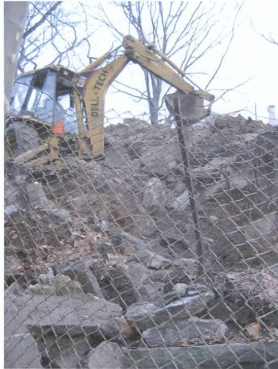
Figure 07: Southern wall after the collapse

Soon after excavations were underway, the fieldstone wall collapsed (Figure 07).