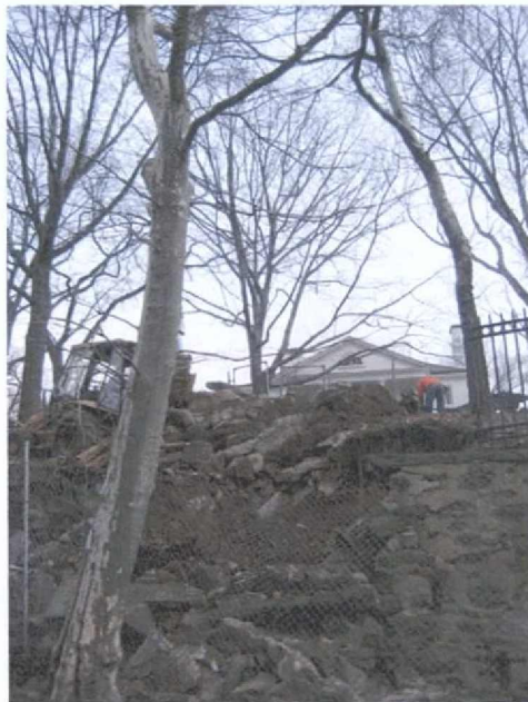
Figure 04: Southern sloping wall - after collapse

As part of the emergency repair contract, two tasks were required: the repair of the buckled wall, which compromised the integrity of the entire wall and the installation of new drainage lines along the interior perimeter of the southern fence line (Figure 03). Due to the extreme slope of the property it was not possible for the contractors to disassemble the wall without first excavation behind the wall. Due to the slope and rocky nature of the grounds a backhoe was used to facilitate the excavation (Figure 04). The area of the collapse was approximately ten (10) feet in length of the wall.