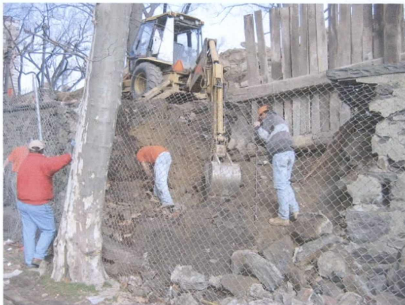
Figure 08: Loose soil and rock

Along the entire length of the excavation the same soil and rock matrix was uncovered beneath the top soil layer (Figure 08). The soil was consistently brownish in color mixed with large mica-schist rocks.