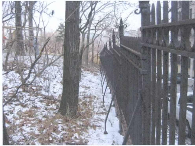
Figure 03: Interior of southern fence line prior to excavation

As part of the emergency repair contract, two tasks were required: the repair of the buckled wall, which compromised the integrity of the entire wall and the installation of new drainage lines along the interior perimeter of the southern fence line (Figure 03). Due to the extreme slope of the property it was not possible for the contractors to disassemble the wall without first excavation behind the wall. Due to the slope and rocky nature of the grounds a backhoe was used to facilitate the excavation (Figure 04). The area of the collapse was approximately ten (10) feet in length of the wall.