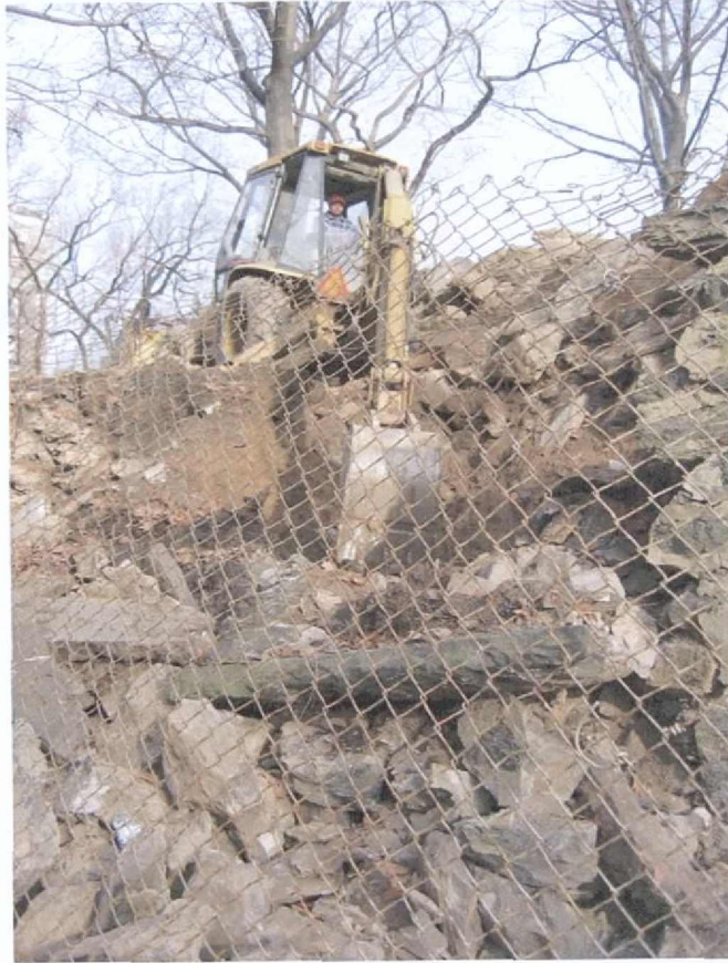
Figure 12: Excavation of wall area