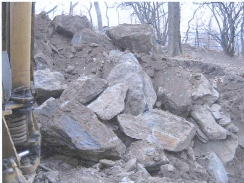
Figure 06: Manhattan mica-schist fieldstone comprised the below ground make-up

Excavations revealed that the area adjacent to the retaining wall was comprised mostly of large fieldstone Manhattan mica-schist rocks. They were unmortared, but held in place, in part, by loose soil (Figure 06). The first one (1) to two (2) feet of soil excavated consisted of an organic top soil that revealed no cultural remains. Beneath that layer was a medium brown sub soil that was found throughout the rocky matrix.