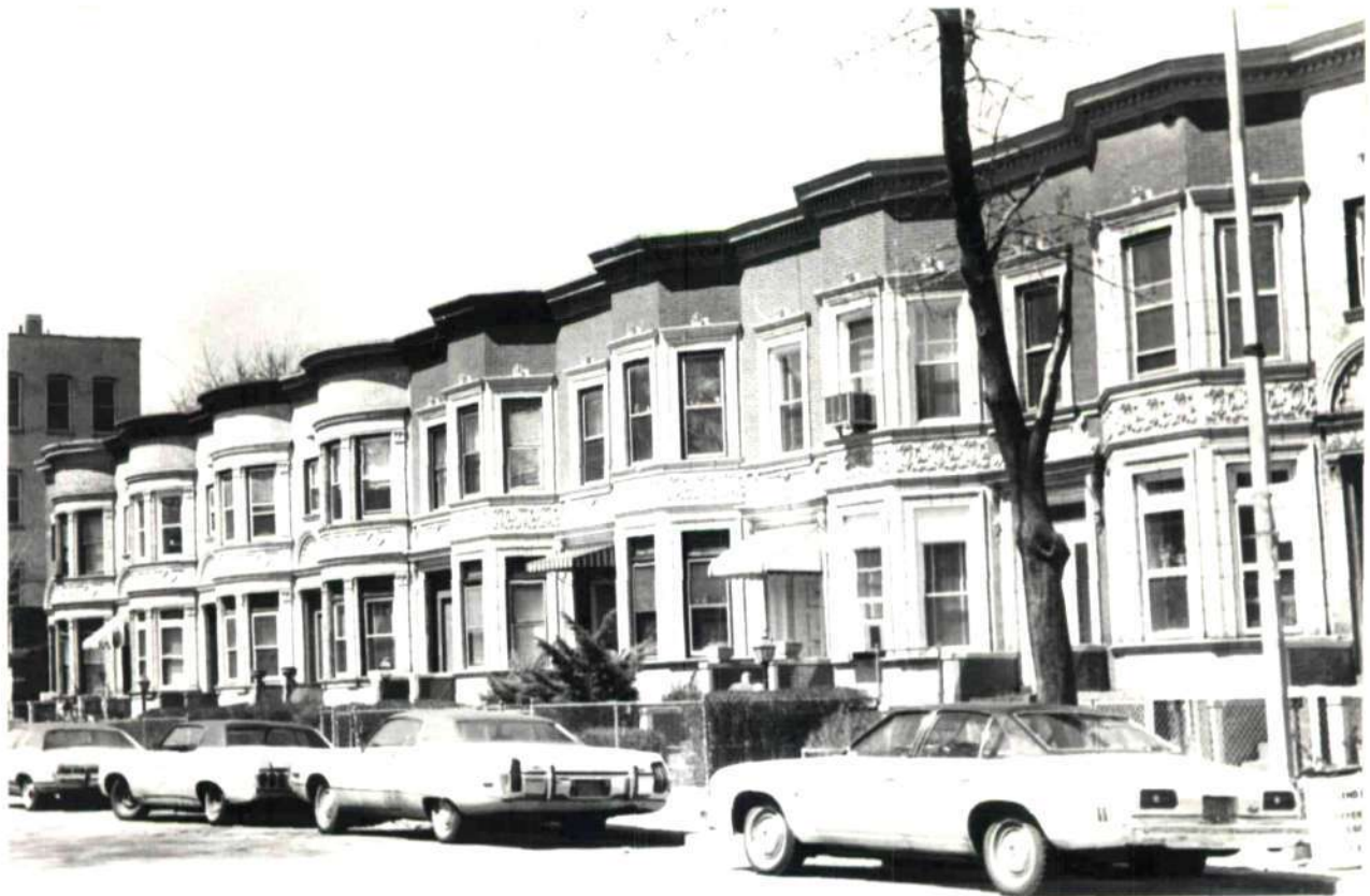
Lefferts Avenue, north side between Rogers and Nostrand Avenues.