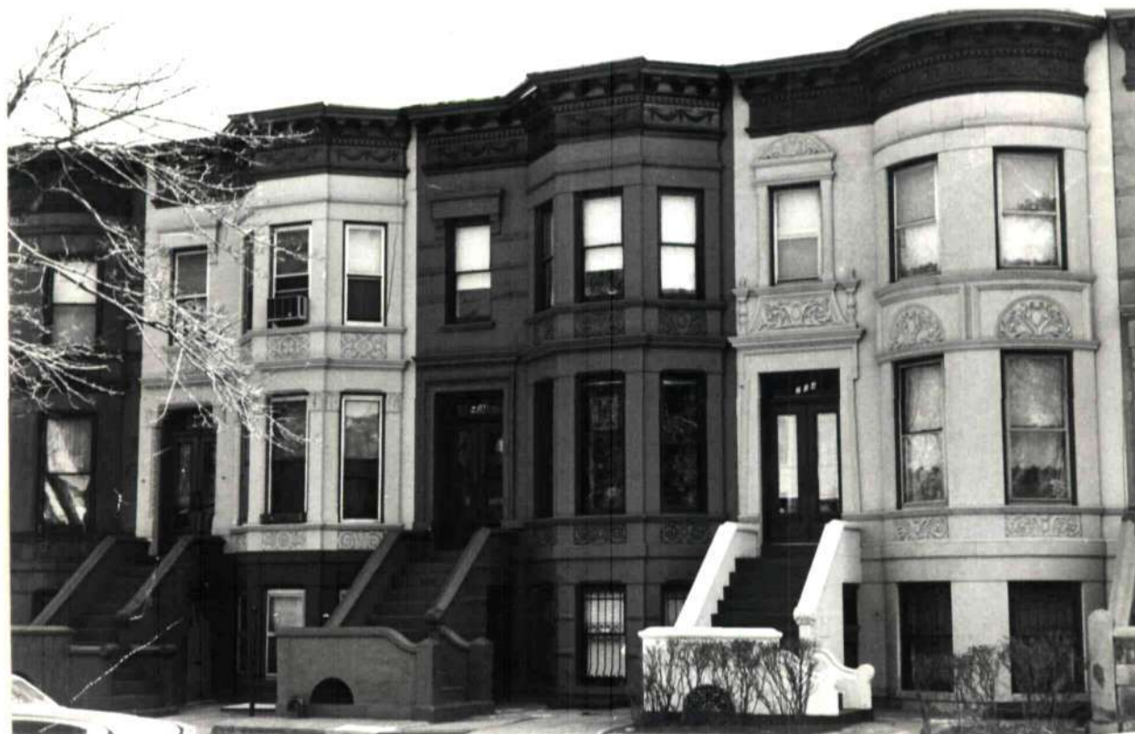
204-208 Lincoln Road. Axel Hedman, 1907.