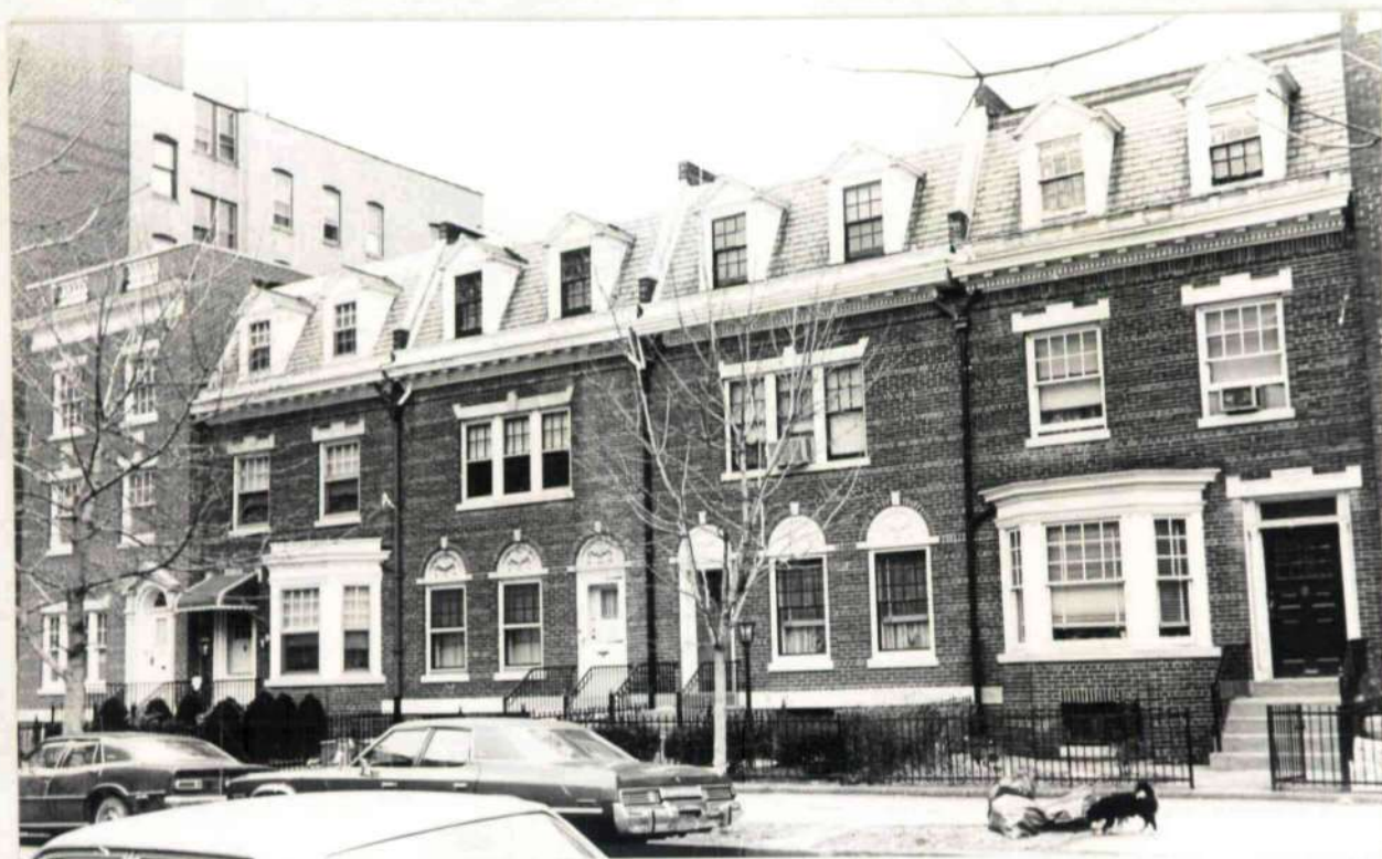
17-31 Midwood Street, Slee & Bryson, 1915.