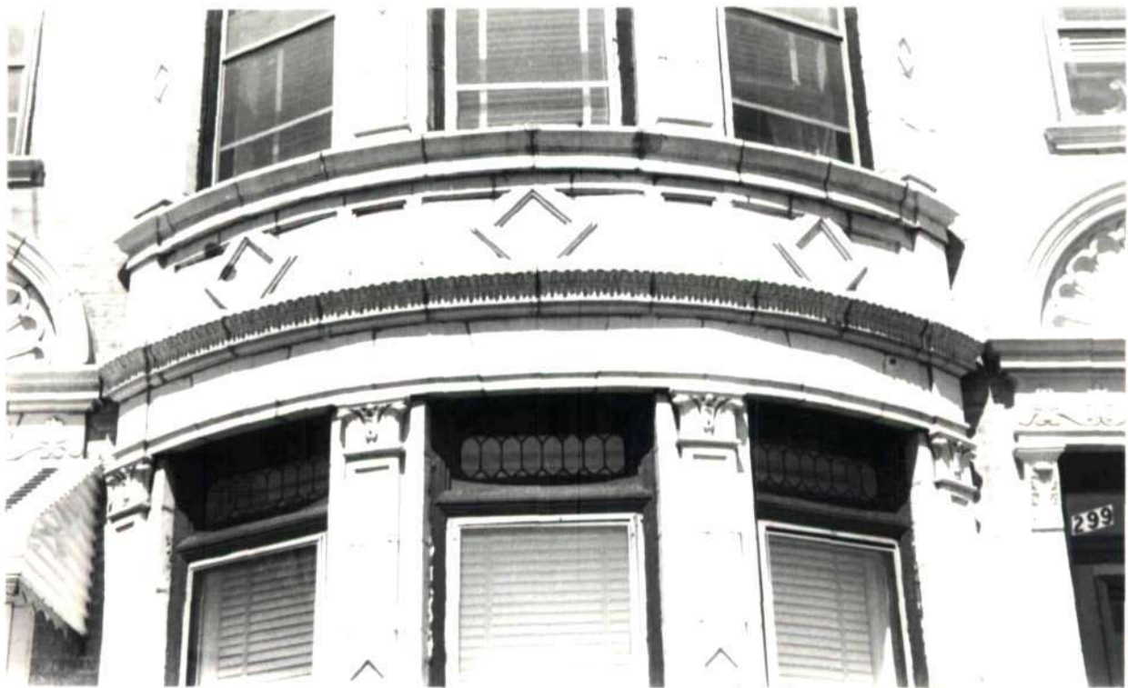
Lefferts Avenue, detail.