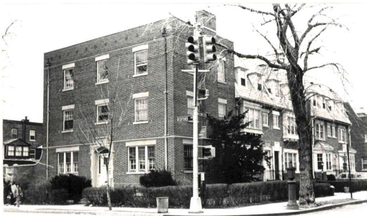
1874 Bedford Avenue. Slee & Bryson, 1913.