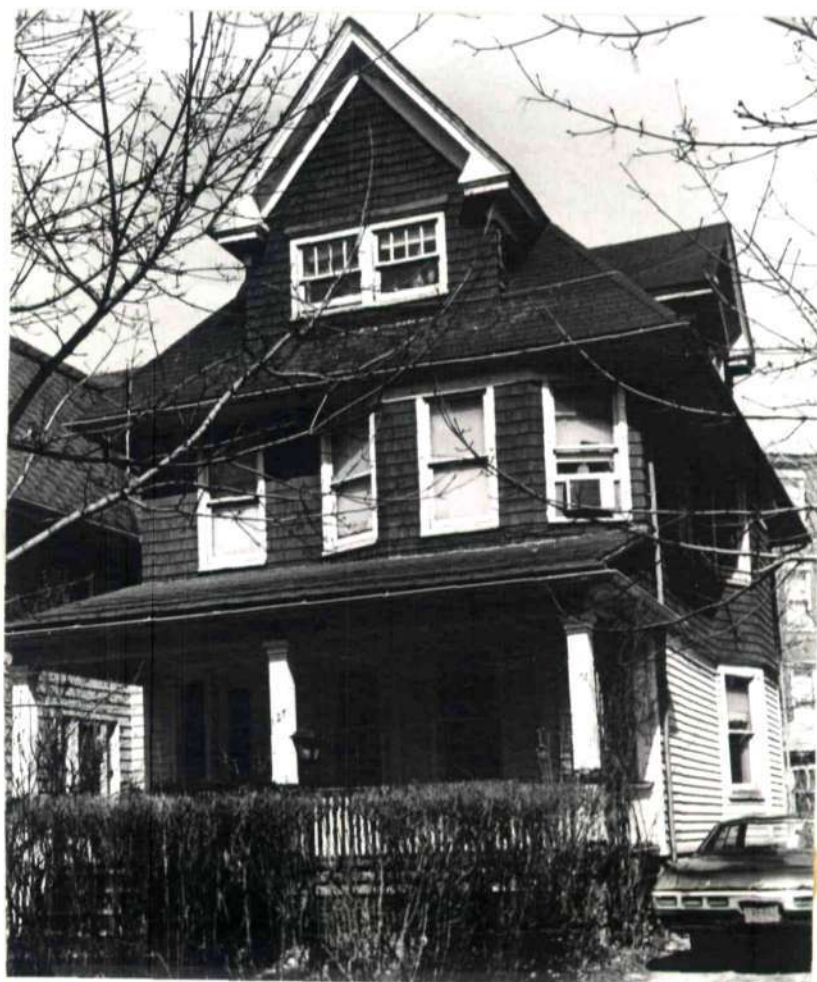
127 Fenimore Street. Benjamin Driesler, 1905.