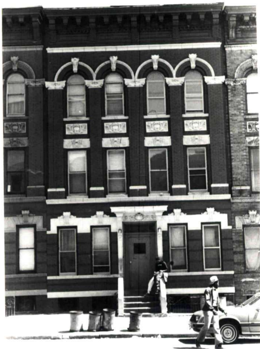
411 Rogers Avenue. Louis Berger & Company, 1907.