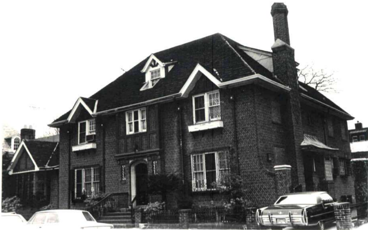
36-40 Maple Street. Adolph Goldberg, 1927.