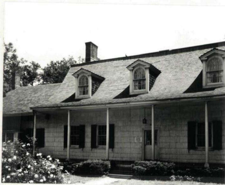
Lefferts Homestead