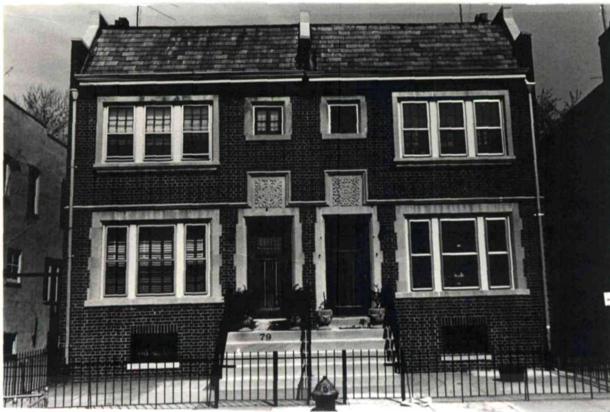
79-81 Fenimore Street. Slee & Bryson, c.1920.