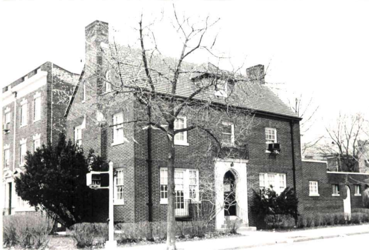
1860 Bedford Avenue. Slee & Bryson, 1923.