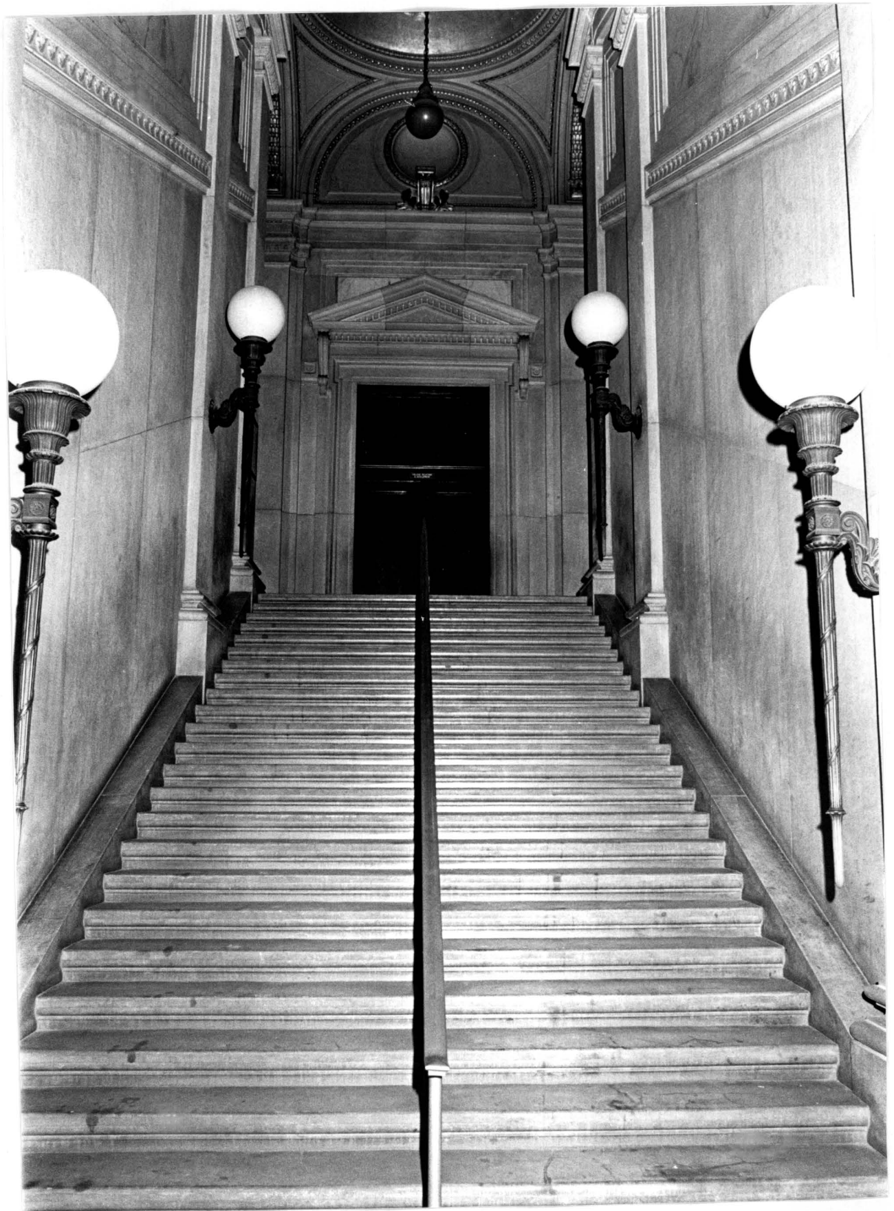
GOULD MEMORIAL LIBRARY MAIN STAIRCASE Former New York University Campus, University Heights, The Bronx