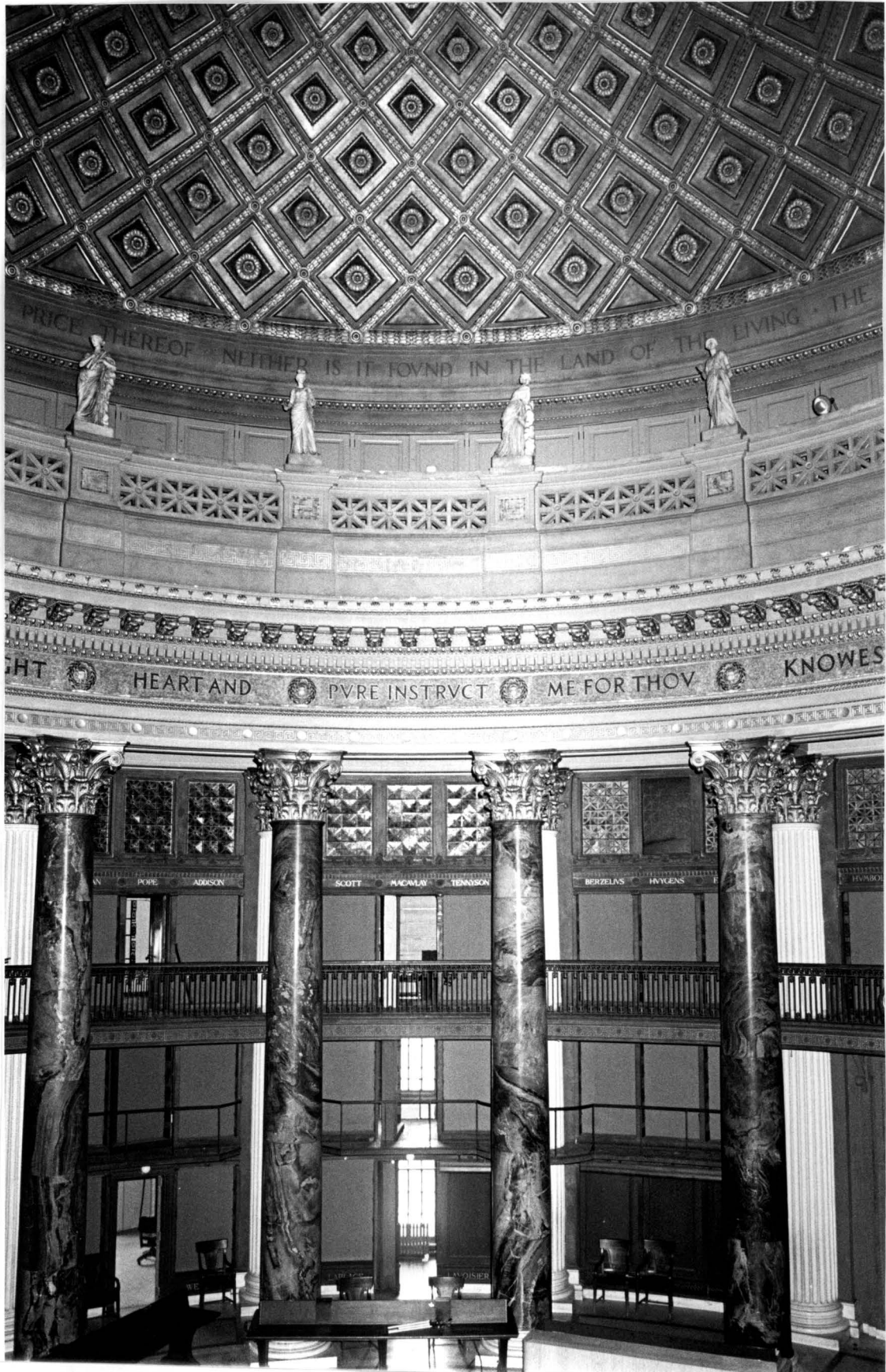
GOULD MEMORIAL LIBRARY ROTUNDA Former New York University Campus, University Heights, The Bronx