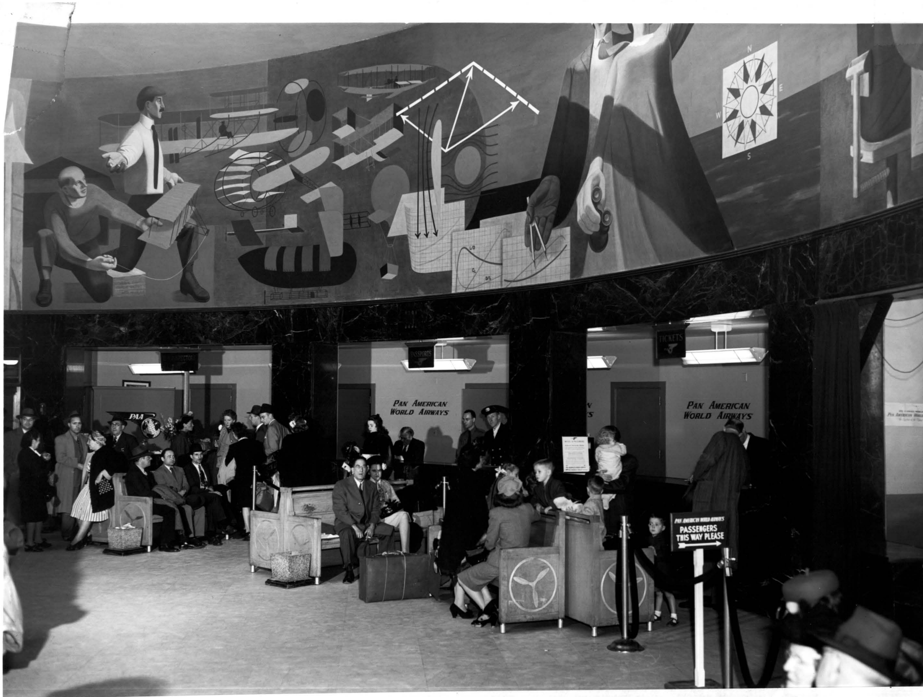
Marine Air Terminal Interior La Guardia Airport Built 1939-1940