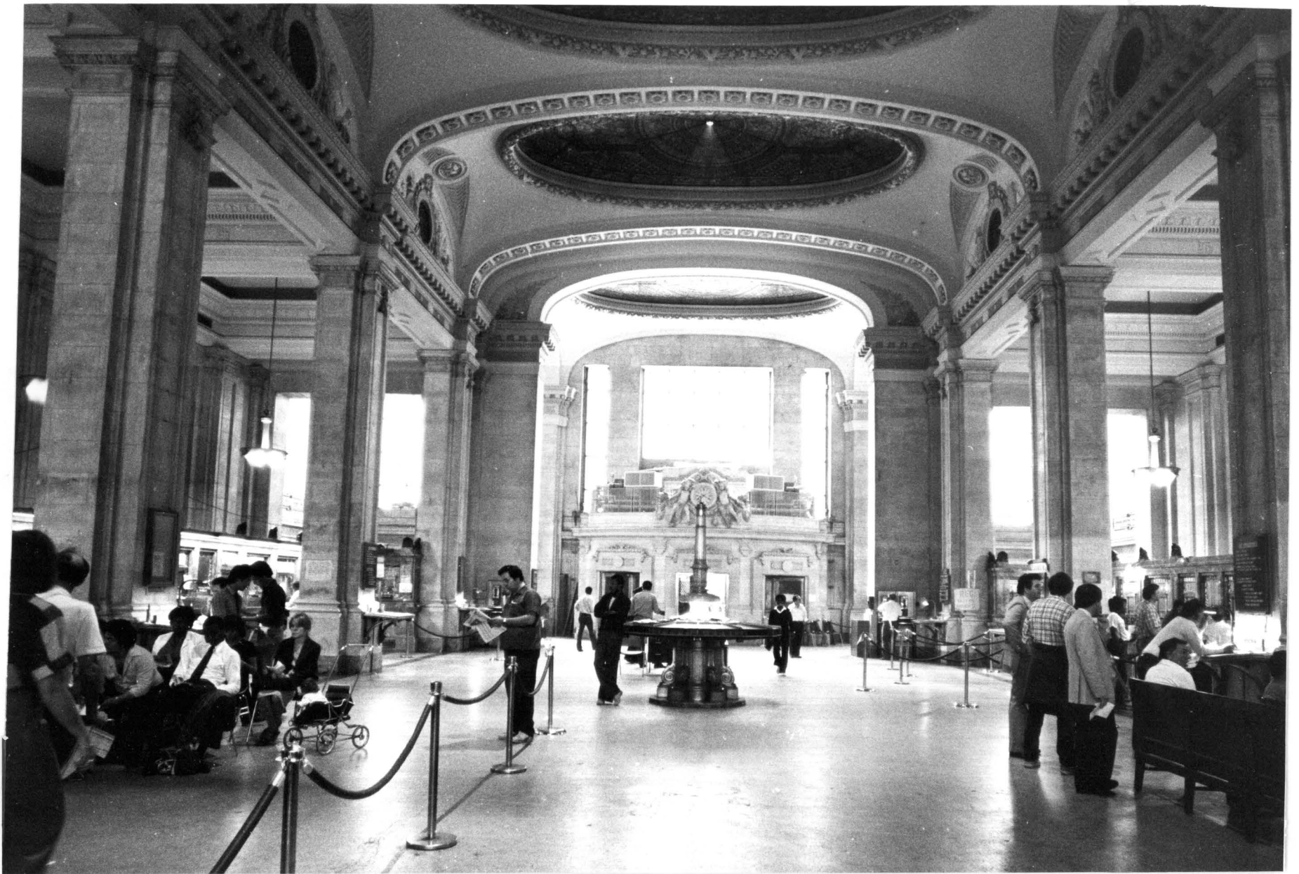
Former Emigrant Industrial Savings Bank Building Interior 51 Chambers Street, Manhattan

Built: 1909-1912 Architect: Raymond Almirall