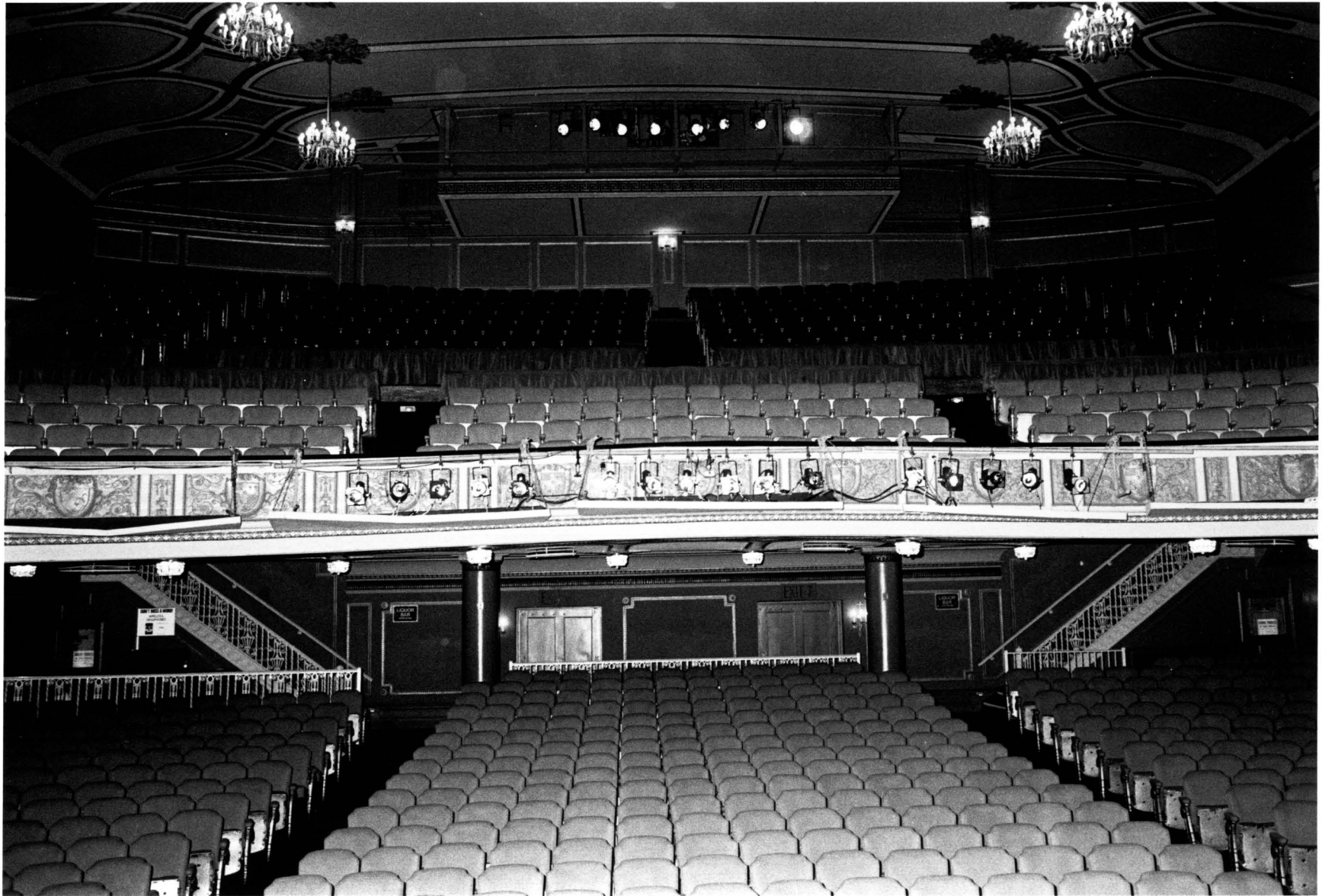
Brooks Atkinson Theater Interior