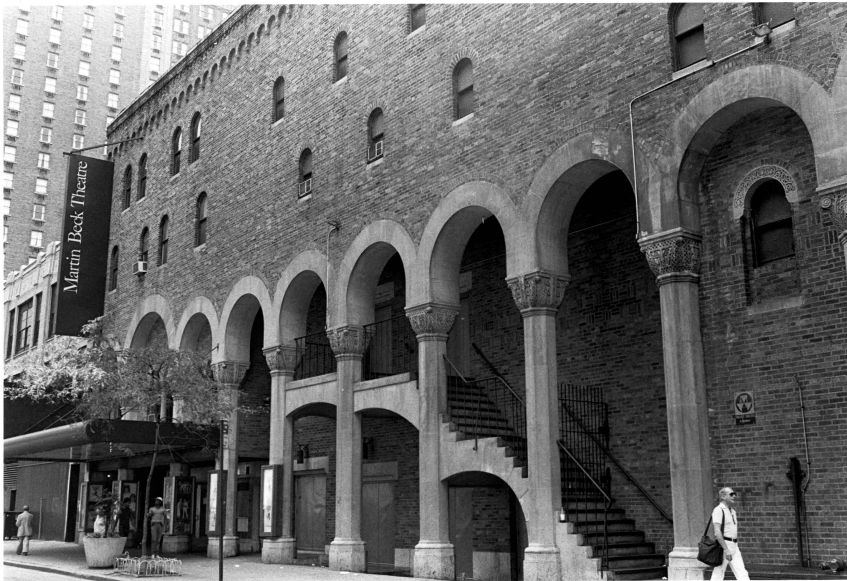
Martin Beck Theater