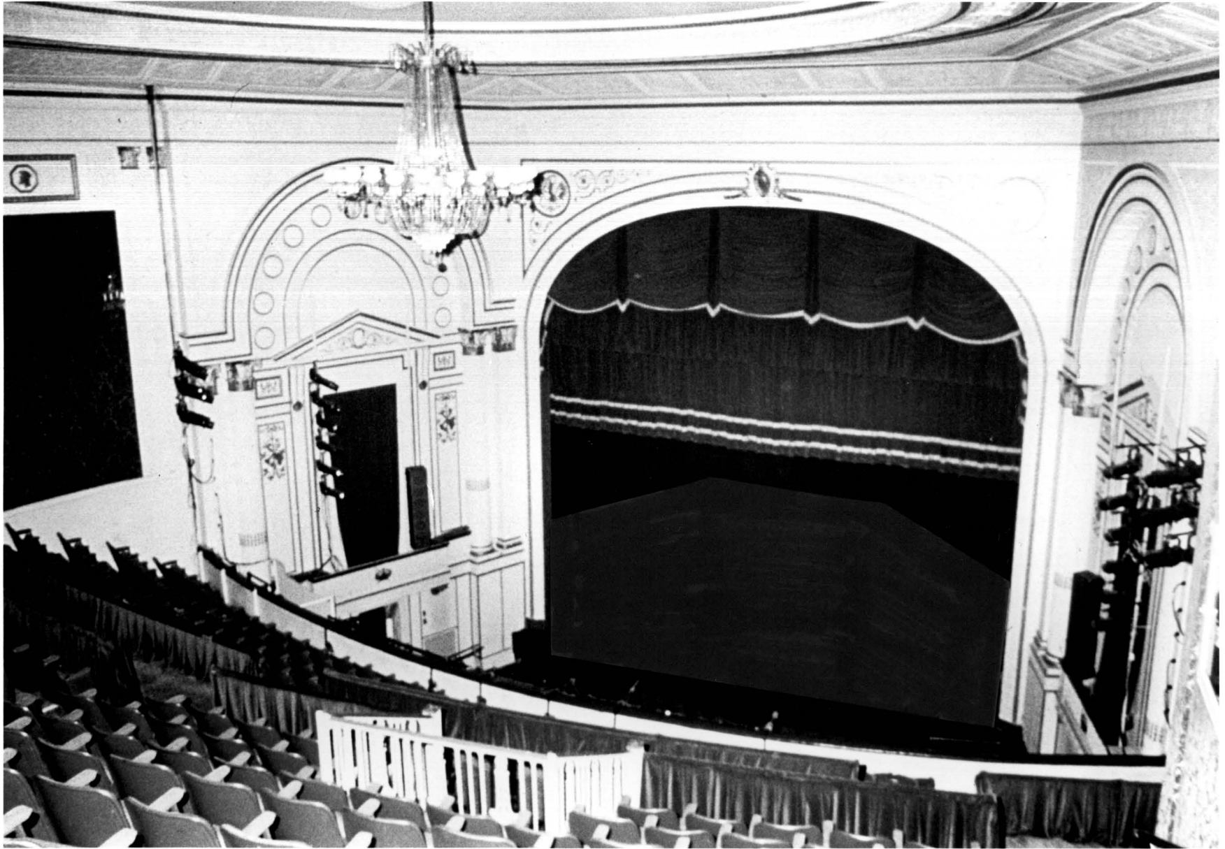
Biltmore Theater Interior 261-265 West 47th Street Manhattan