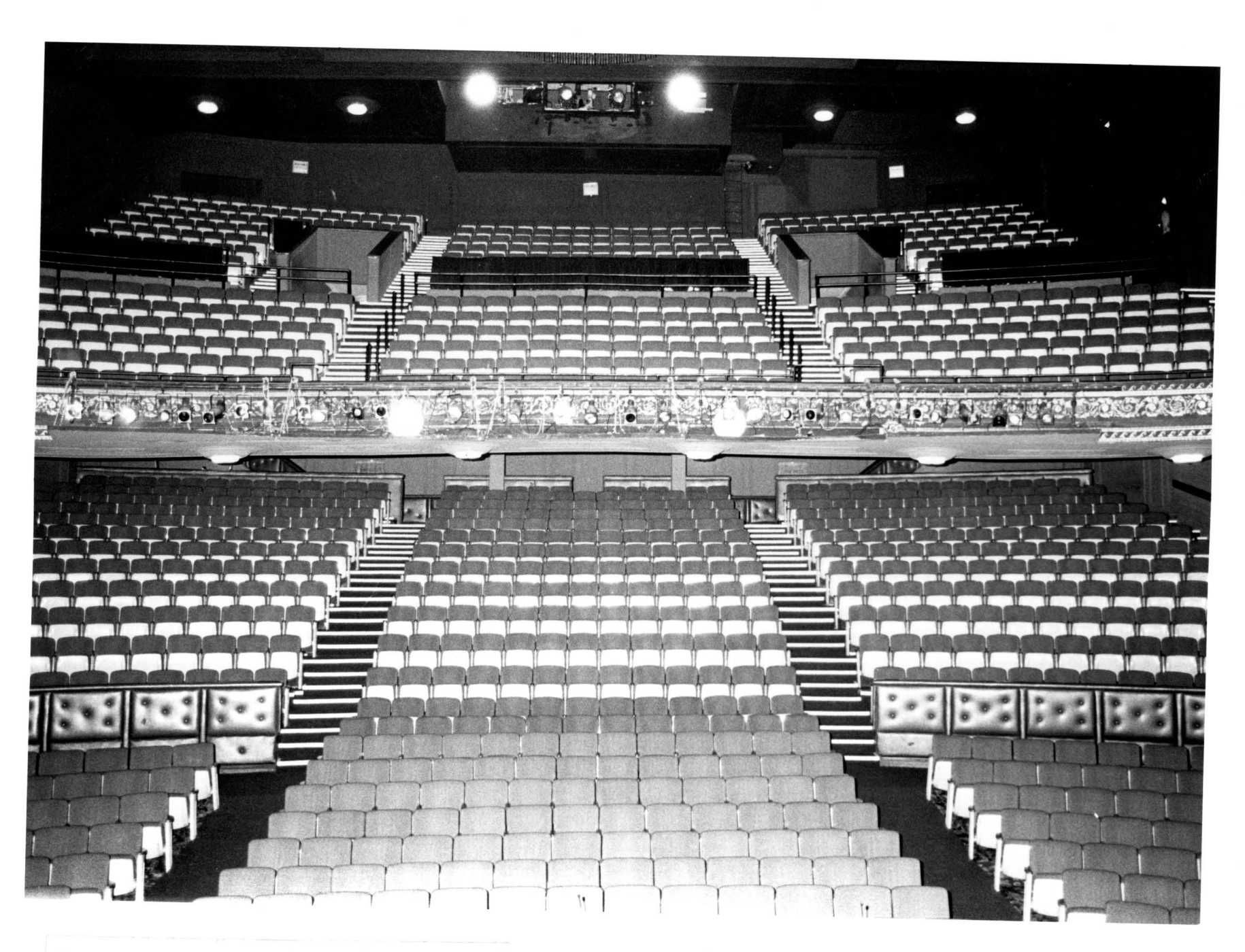
Forty-sixth Street Theater Interior