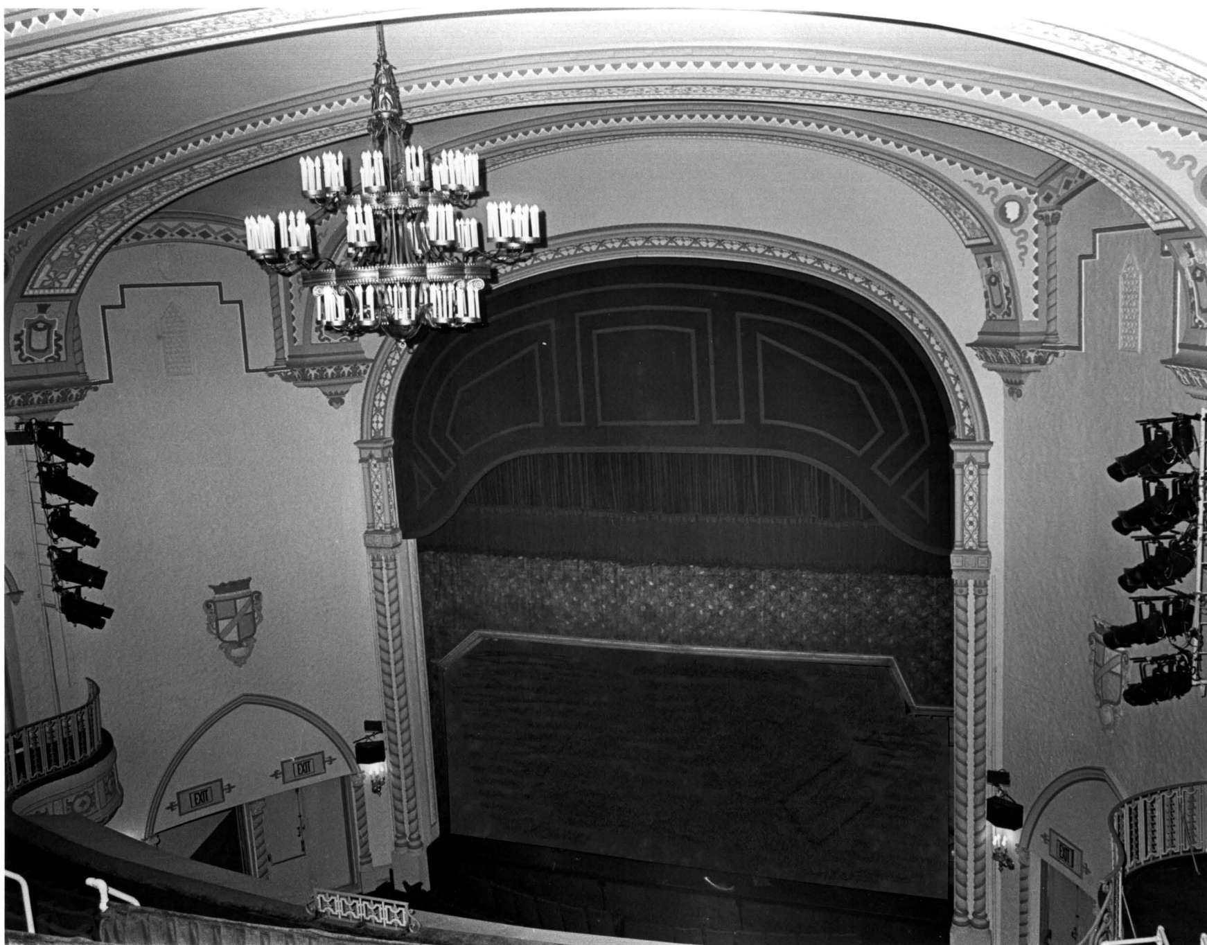
Golden Theater Interior 252-256 West 45th Street Manhattan

Built: 1926-27 Architect: Herbert J. Krapp