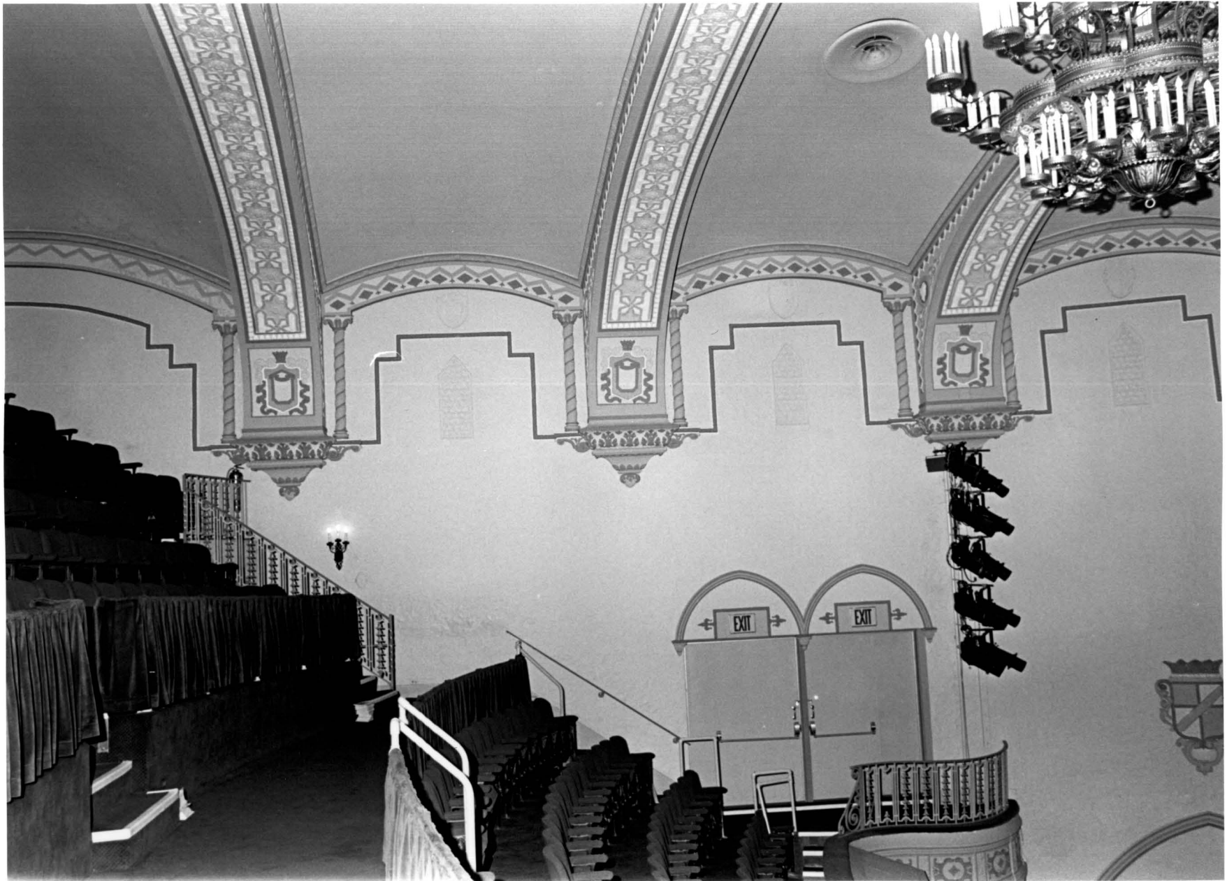
Golden Theater Interior