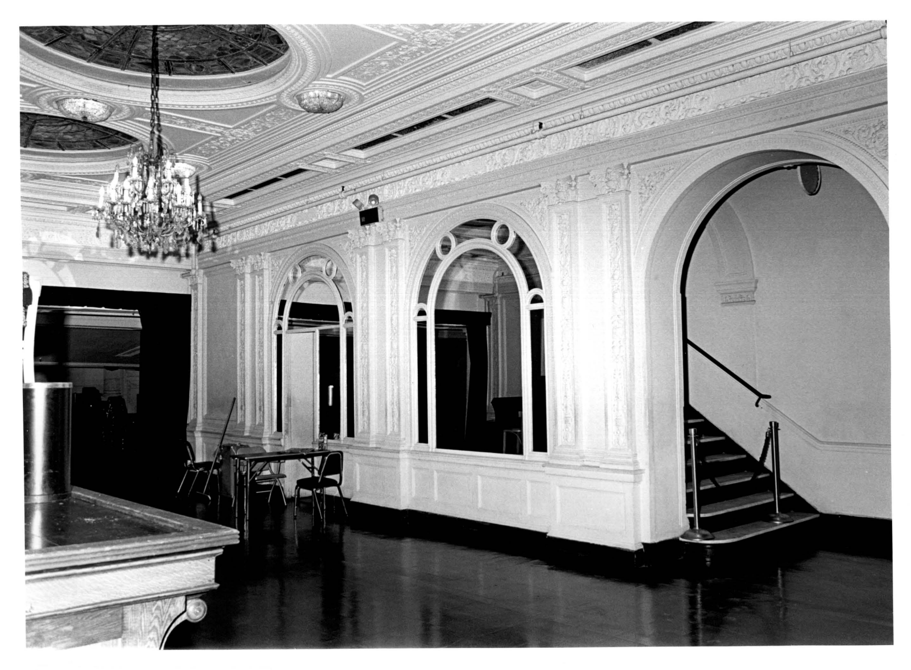
Hudson Theater Interior Inner Lobby