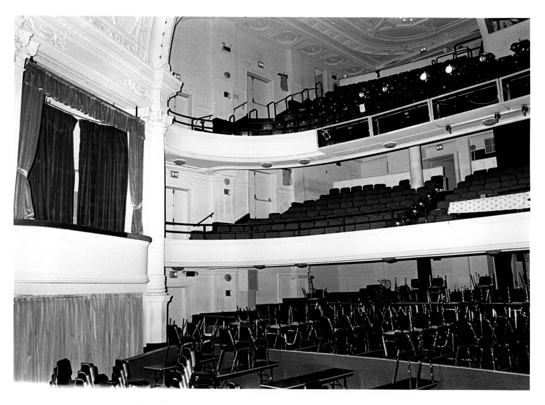
Hudson Theater Interior