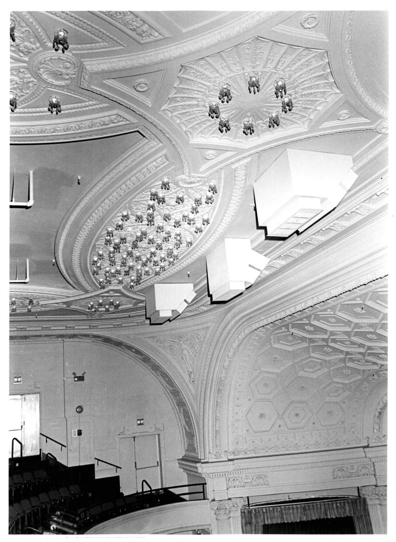
Hudson Theater Interior