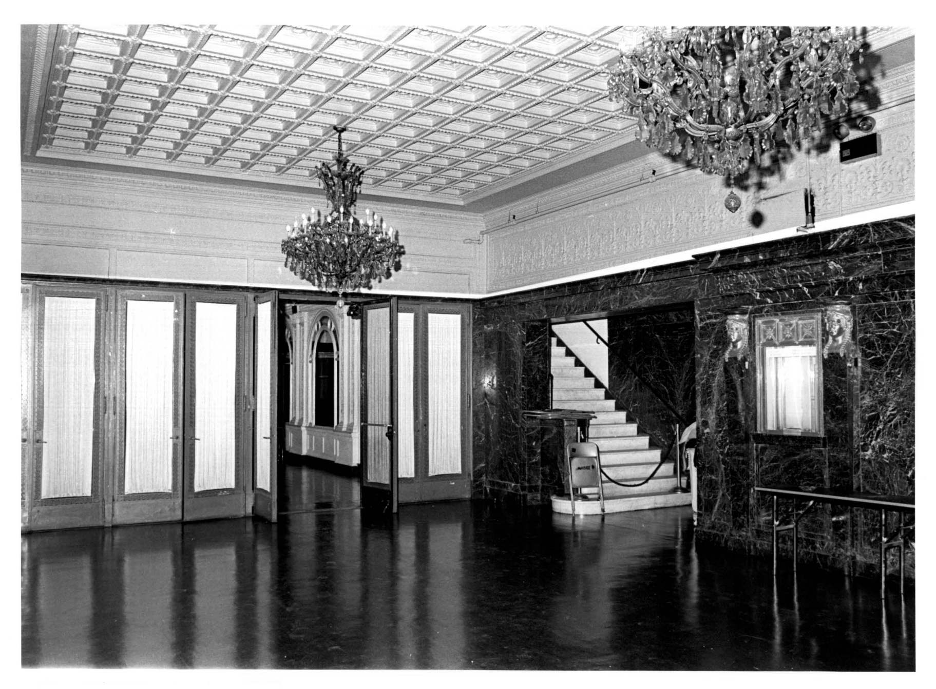
Hudson Theater Interior Ticket Lobby