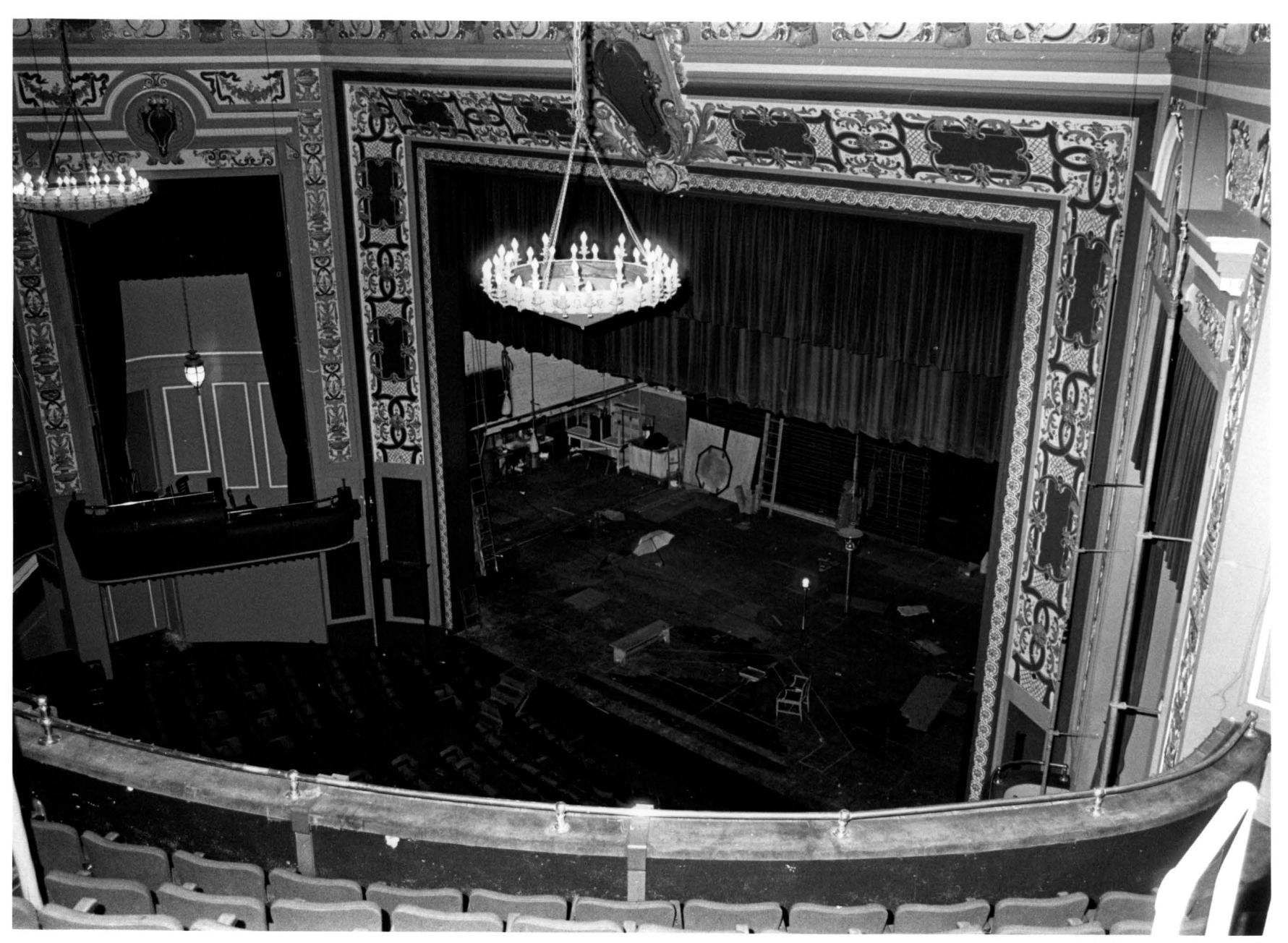
Longacre Theater Interior 220-228 West 48th Street Manhattan