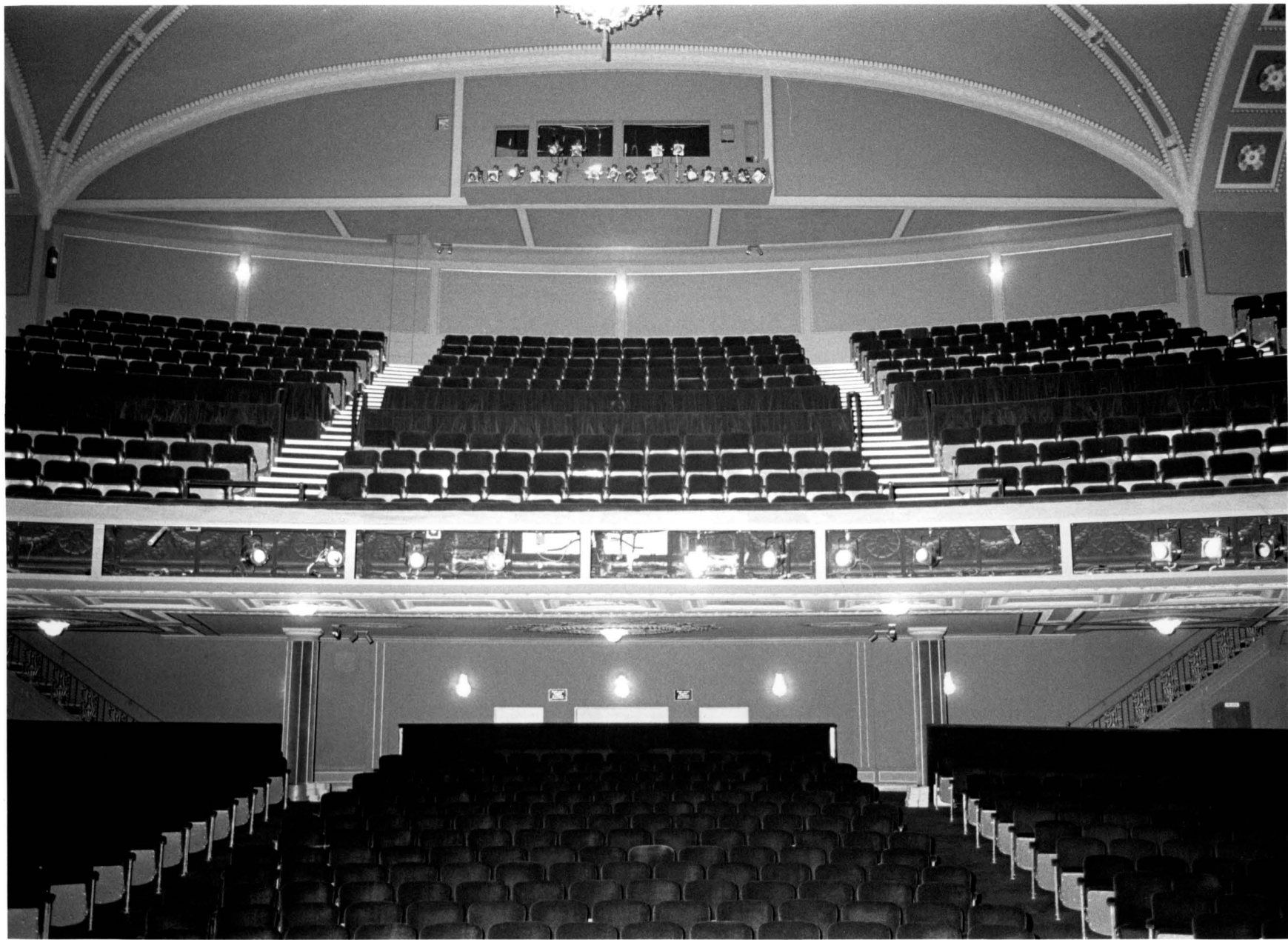
Royale Theater Interior