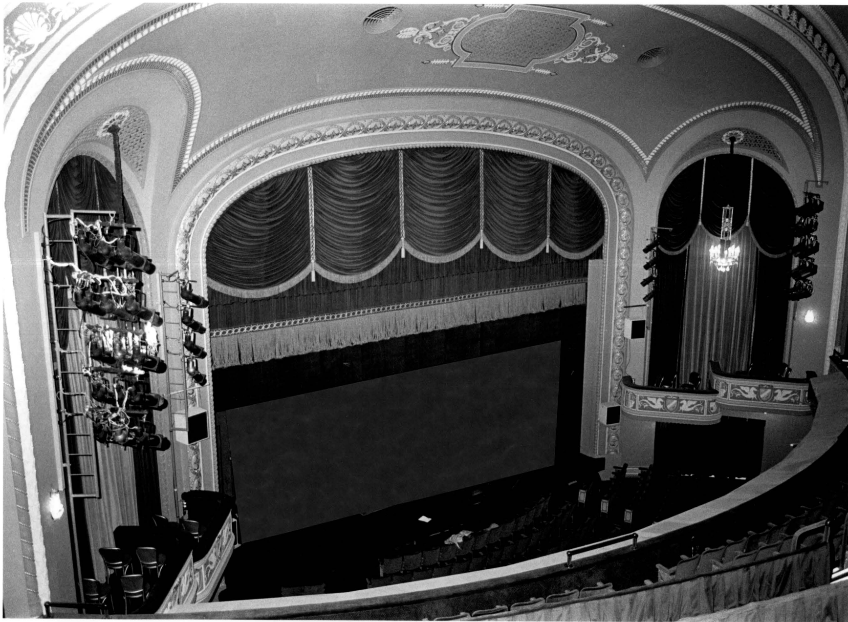
Royale Theater Interior 242-250 West 45th Street Manhattan