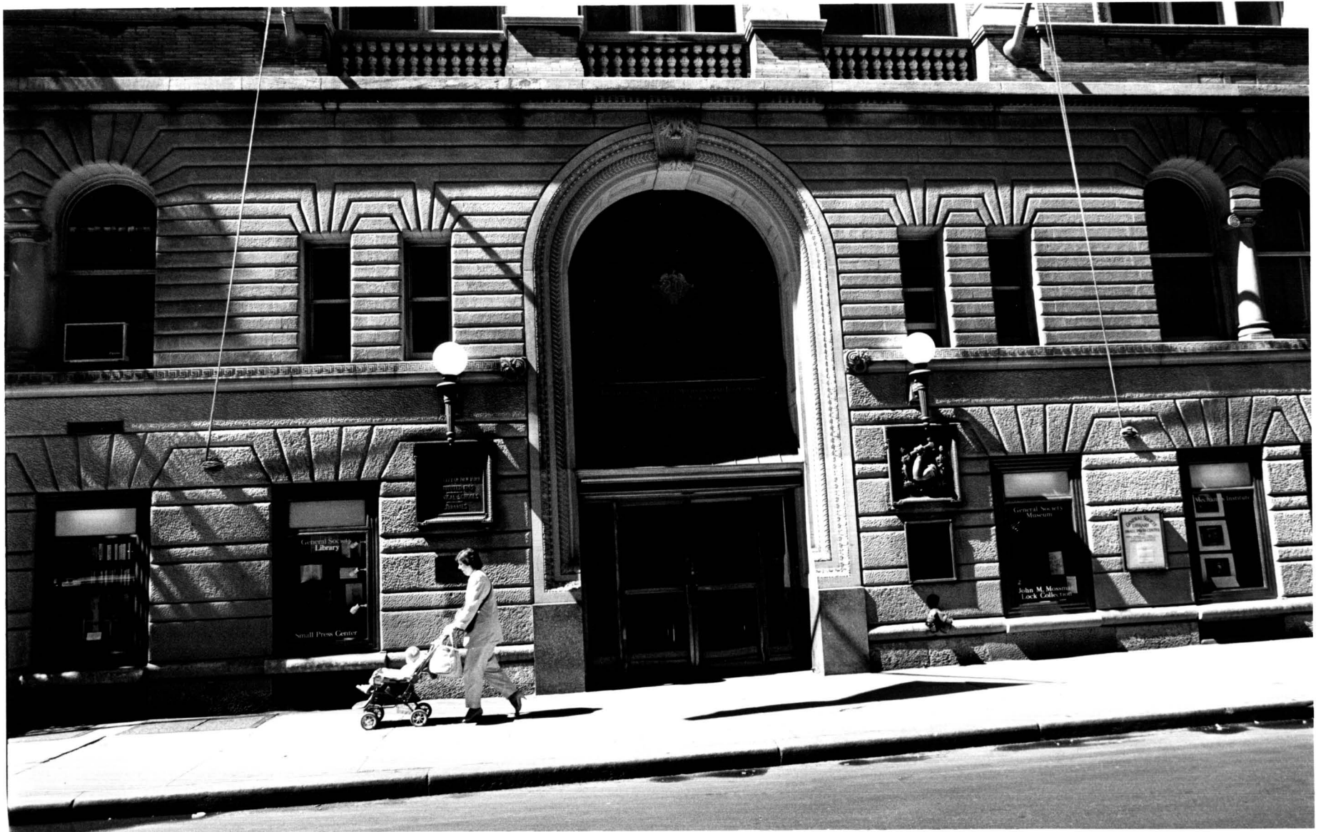
Mechanics' and Tradesmen's Institute Facade, first and second stories