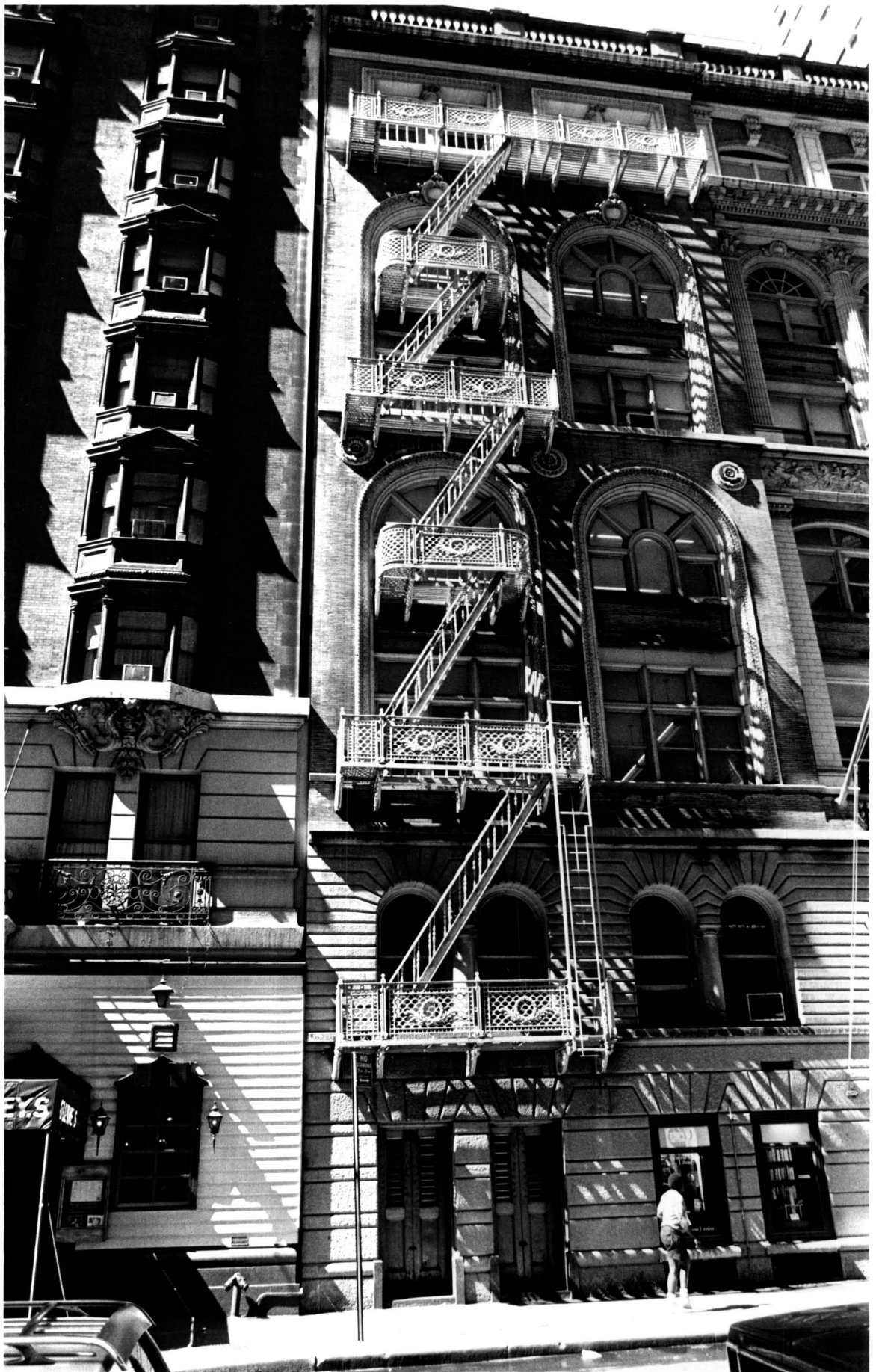
Mechanics' and Tradesmen's Institute Facade, eastern bay fire escape