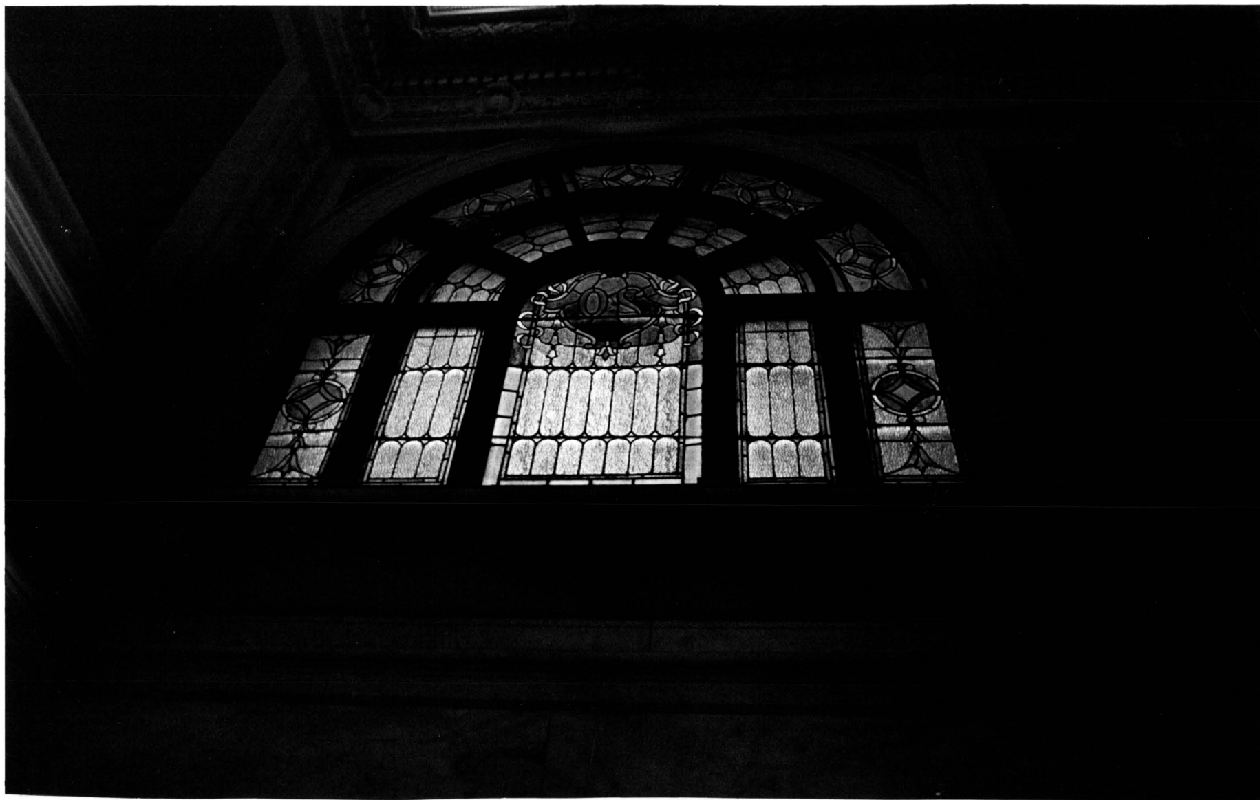
Mechanics' and Tradesmen's Institute Facade, stained glass transom over entrance