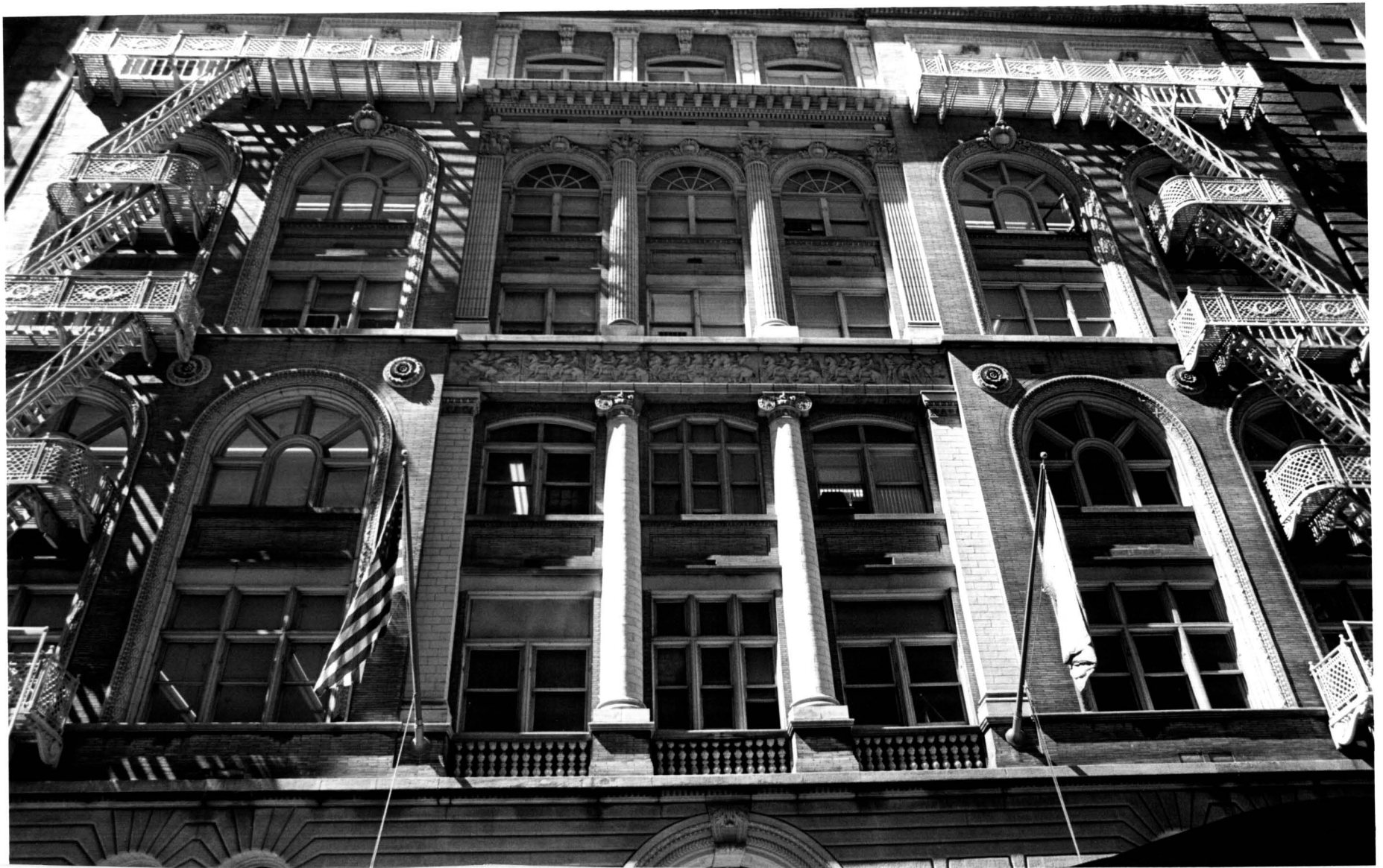
Mechanics' and Tradesmen's Institute Facade, third, fourth, fifth, sixth and seventh stories