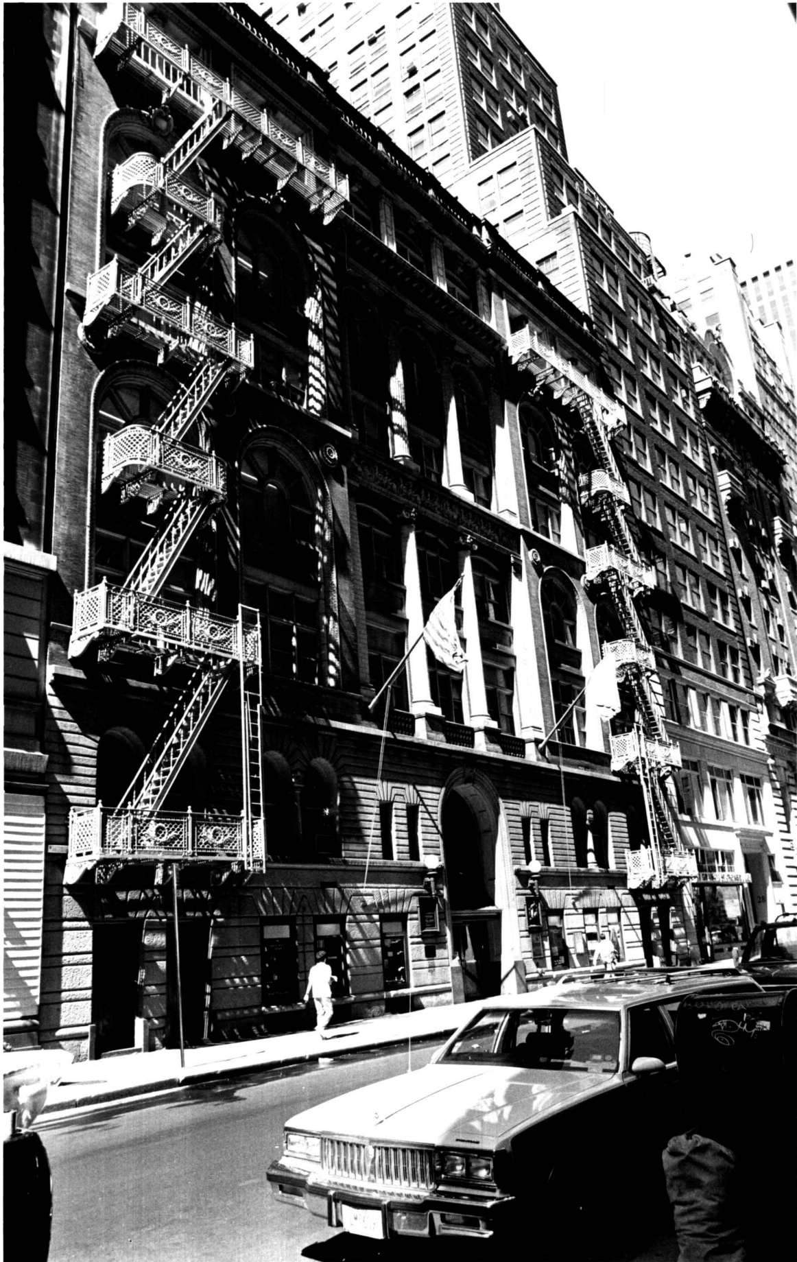
Mechanics' and Tradesmen's Institute 20 West 44th Street