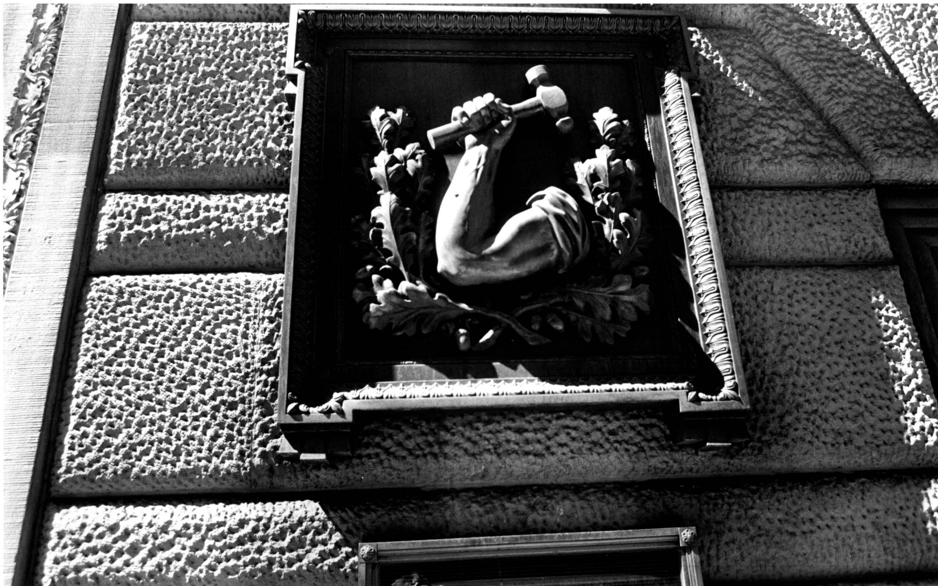
Mechanics' and Tradesmen's Institute Facade, coat of arms