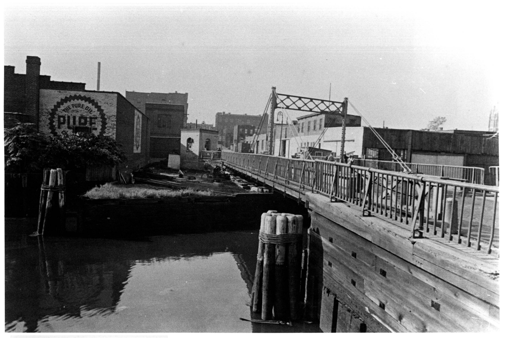
CARROLL STREET BRIDGE, over the Gowanus Canal, Brooklyn Built: 1888-89