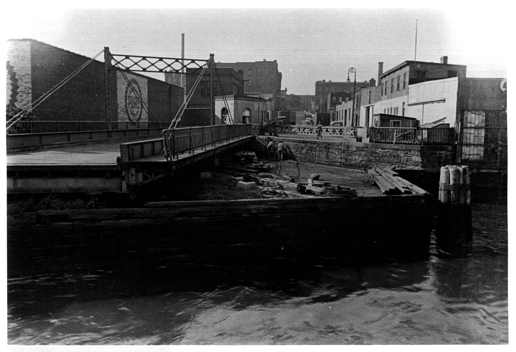
CARROLL STREET BRIDGE, over the Gowanus Canal, Brooklyn Built: 1888-89