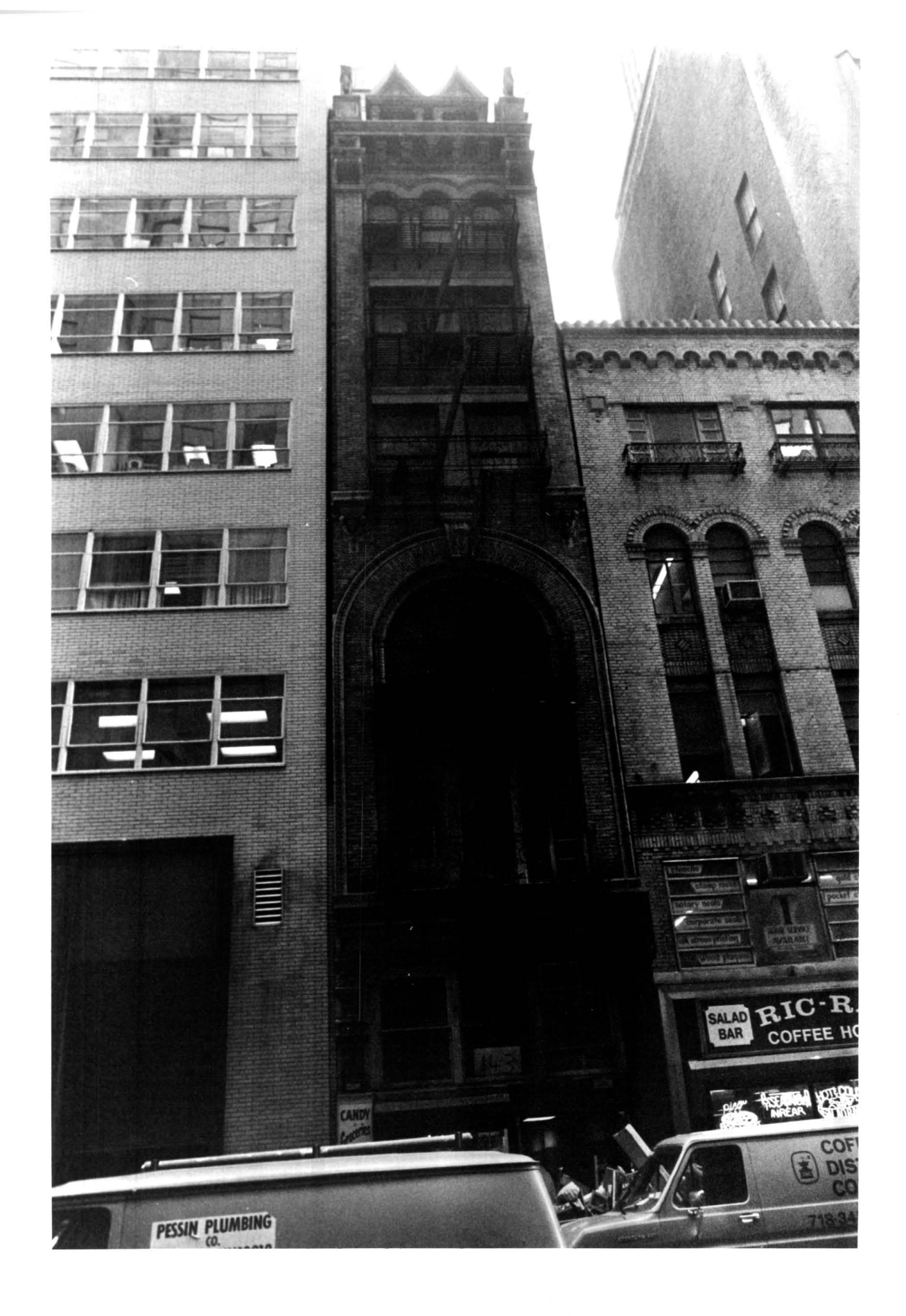
Annex, Knickerbocker Hotel 143 West 41st Street