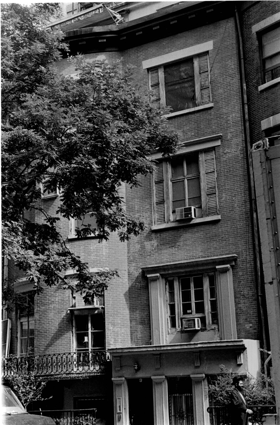
9 West 16th Street Building, 9 West 16th Street (c. 1846)