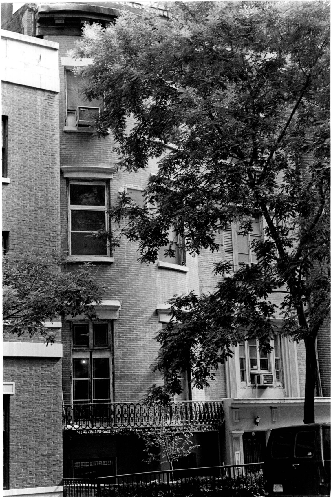
9 West 16th Street Building