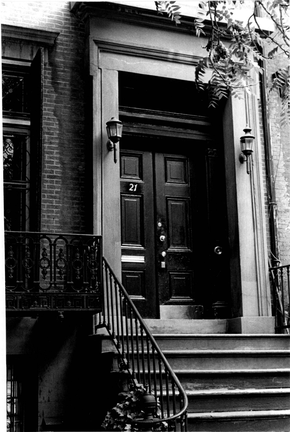
21 West 16th Street Building (entrance detail)