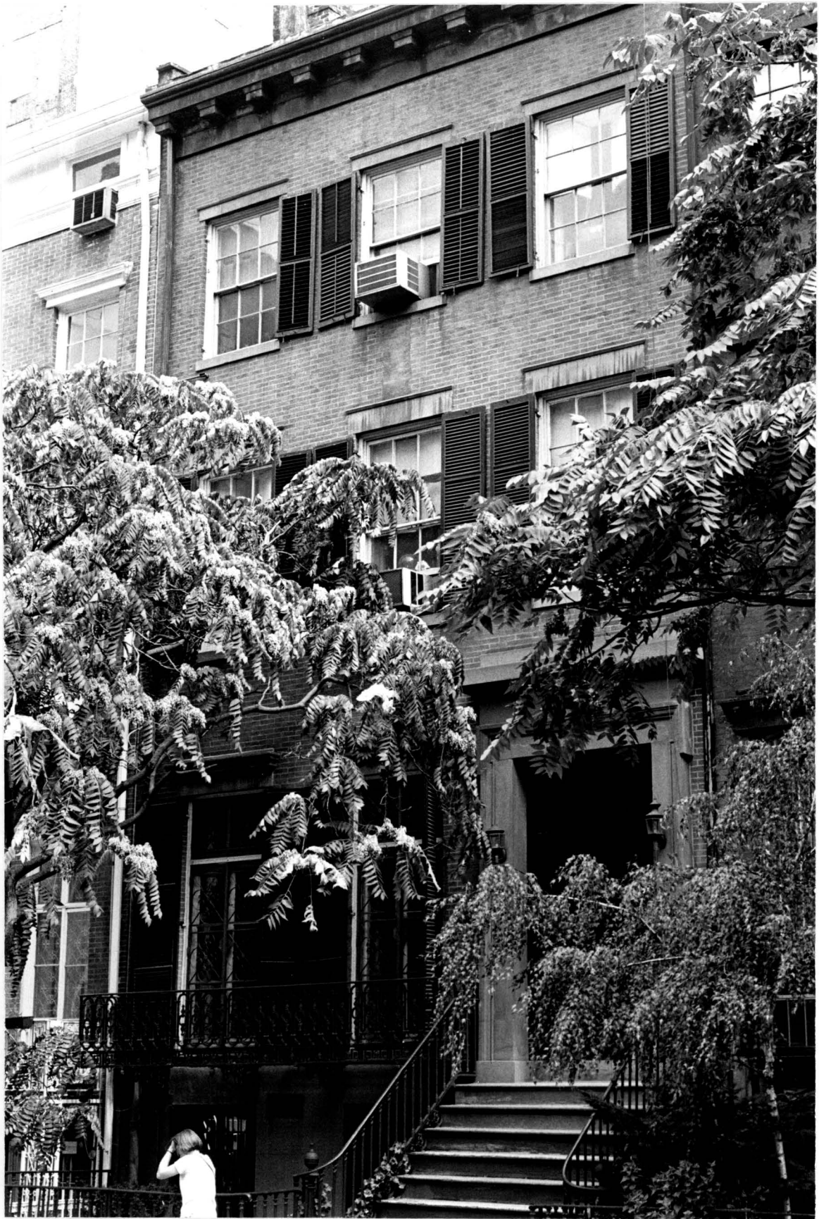
21 West 16th Street Building, 21 West 16th Street (c. 1846)