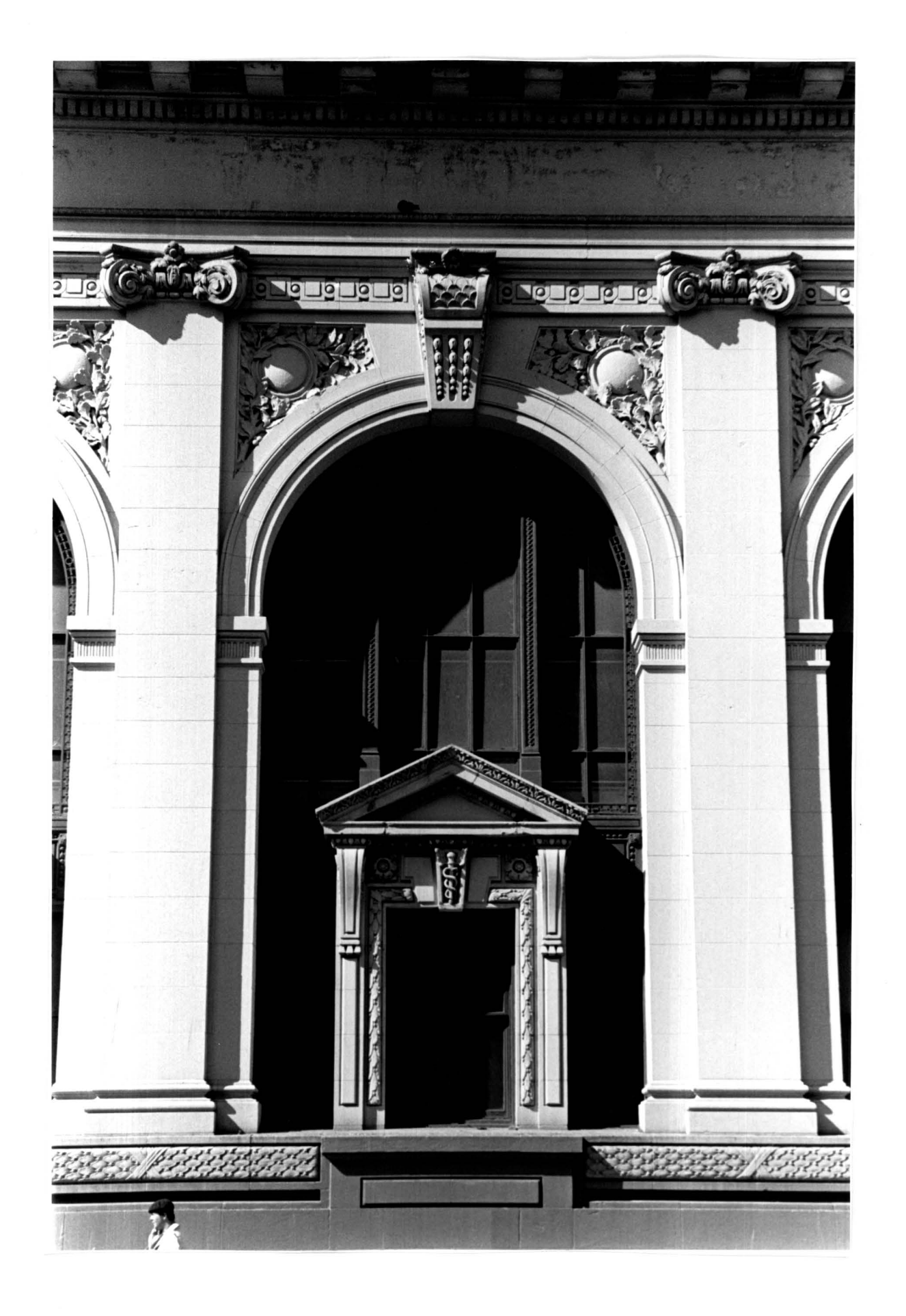
Manufacturers Hanover Bank Detail, 14th Street elevation, window bay