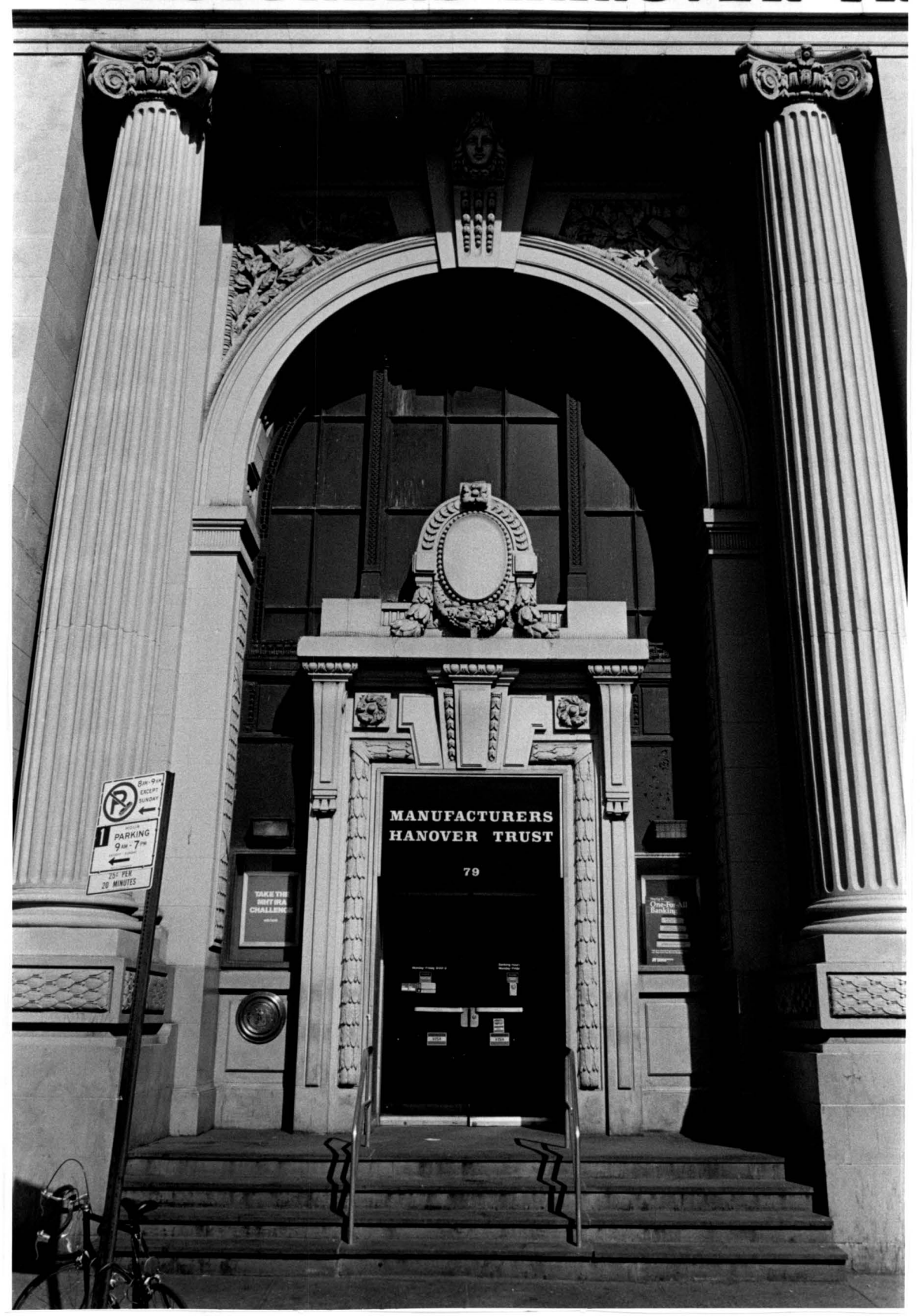
Manufacturers Hanover Bank Detail, Eighth Avenue facade, entrance