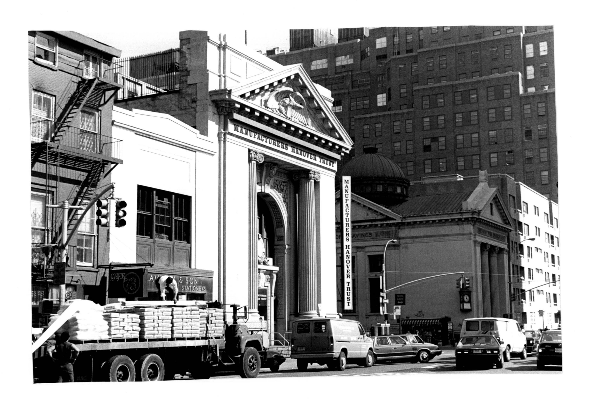
Manufacturers Hanover Bank View from the south