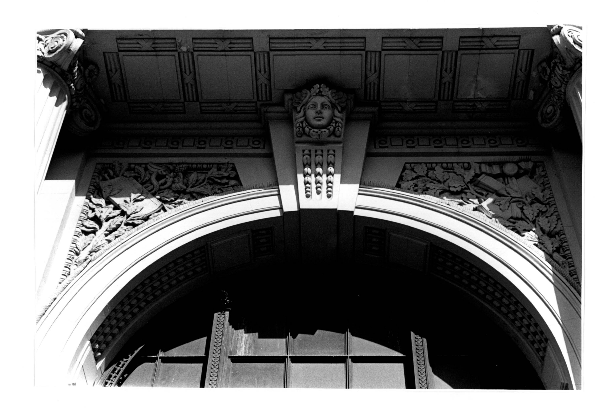
Manufacturers Hanover Bank Detail, Eighth Avenue facade, spandrels and keystone