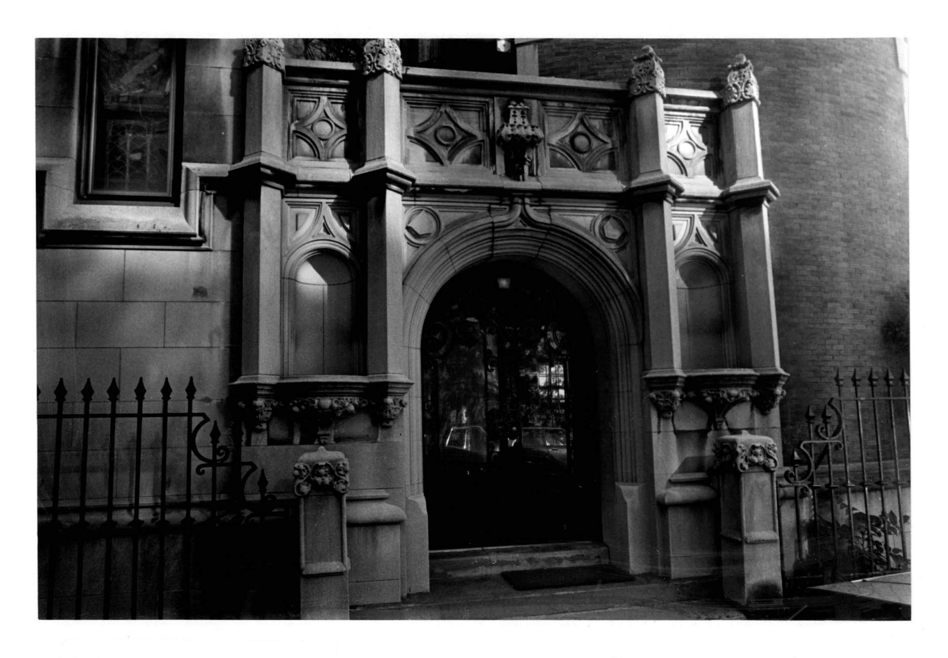
107-109 Riverside Drive Entrance