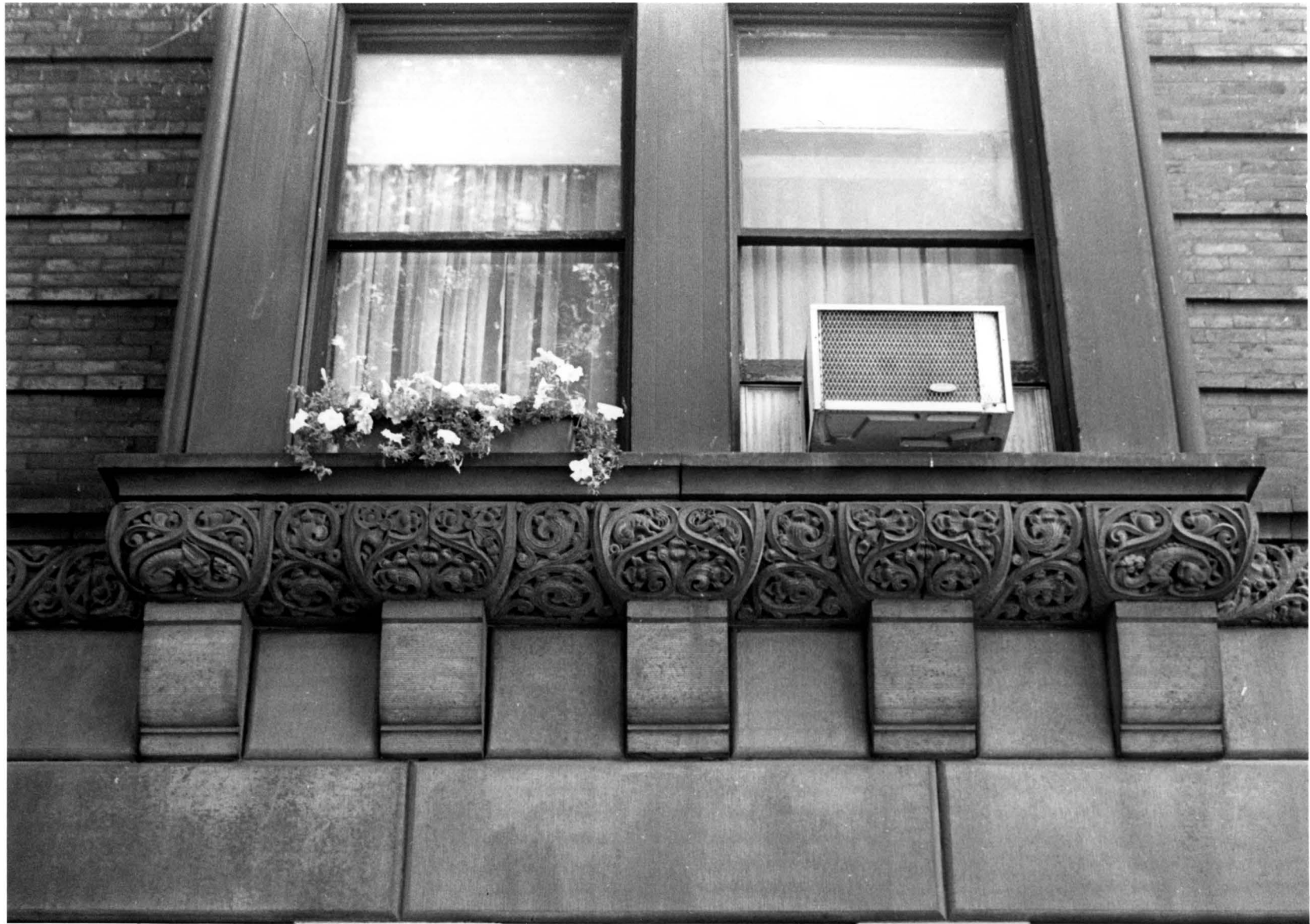
Plate 4. 322 West 85th street. Detail, foliated course.