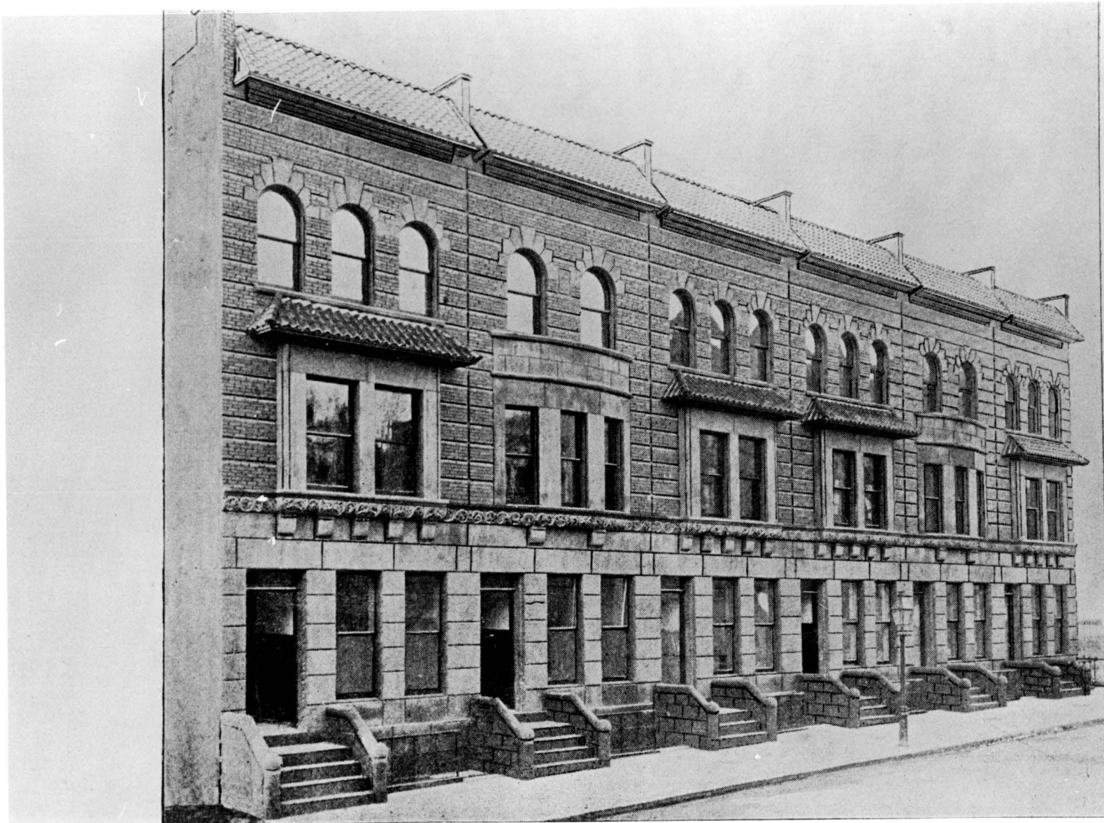
Plate 1. 316 - 326 West 85th Street. Real Estate Record & Guide (Supplement), Jan. 28, 1893.