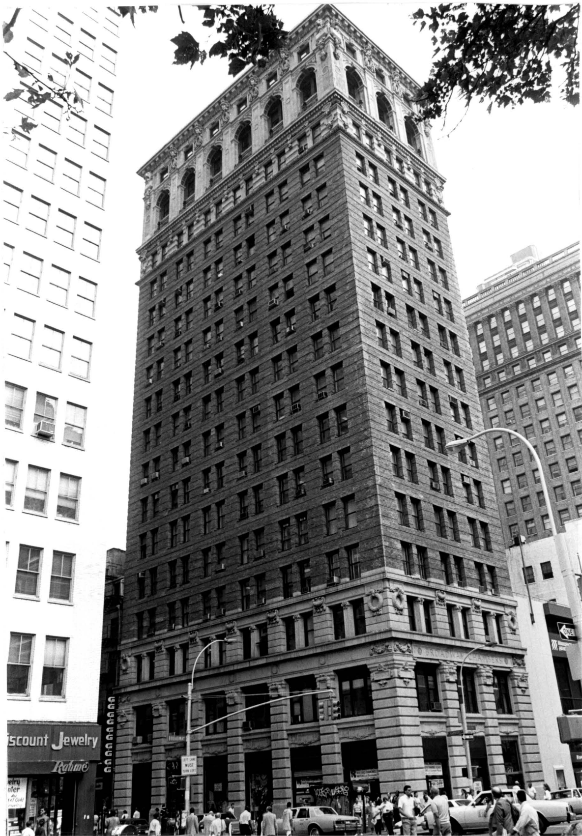
Fig. 1: The Broadway Chambers Building, 273-277 Broadway, view from the southeast.