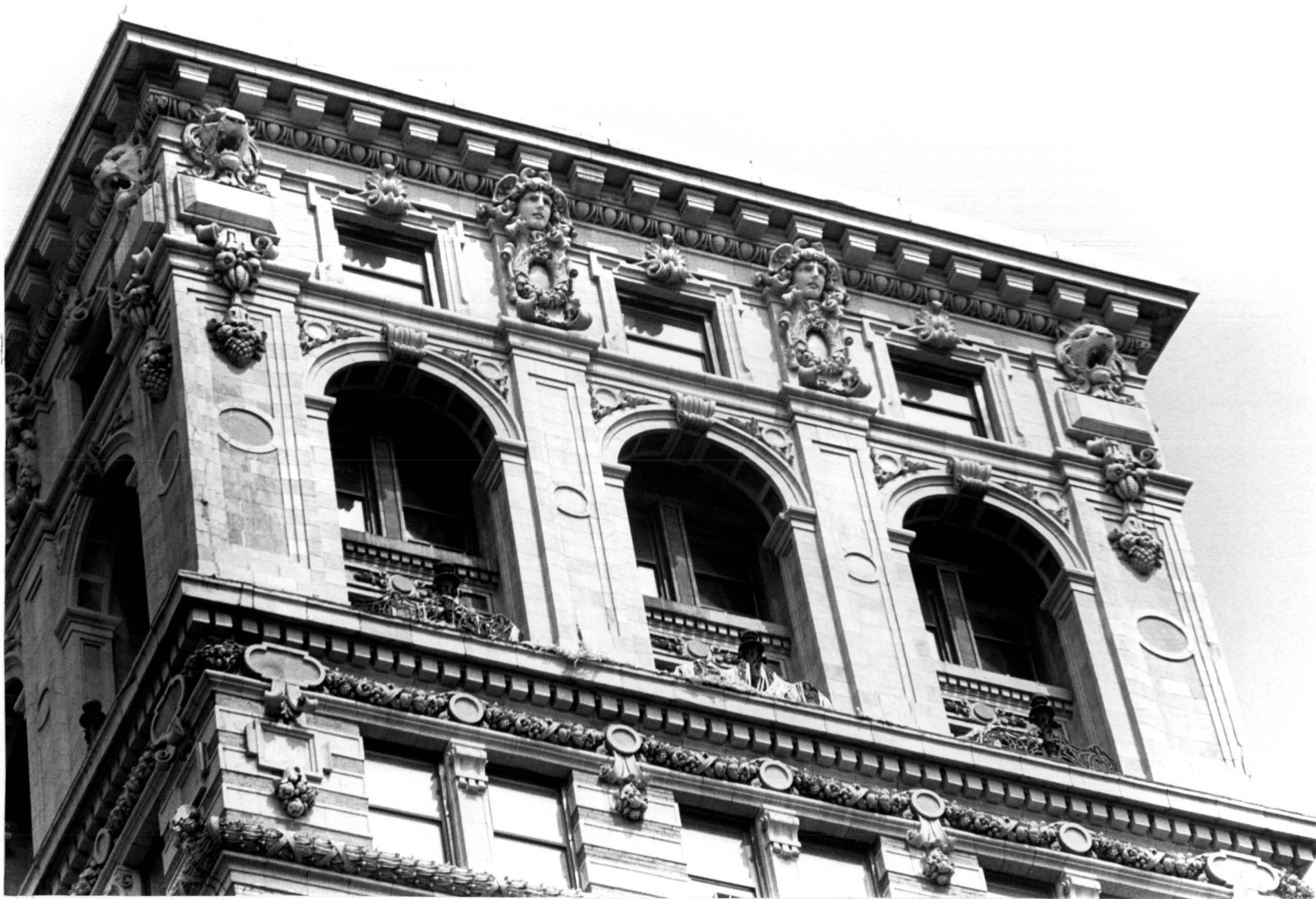
Fig. 3: Arcuated crown, Broadway Facade.