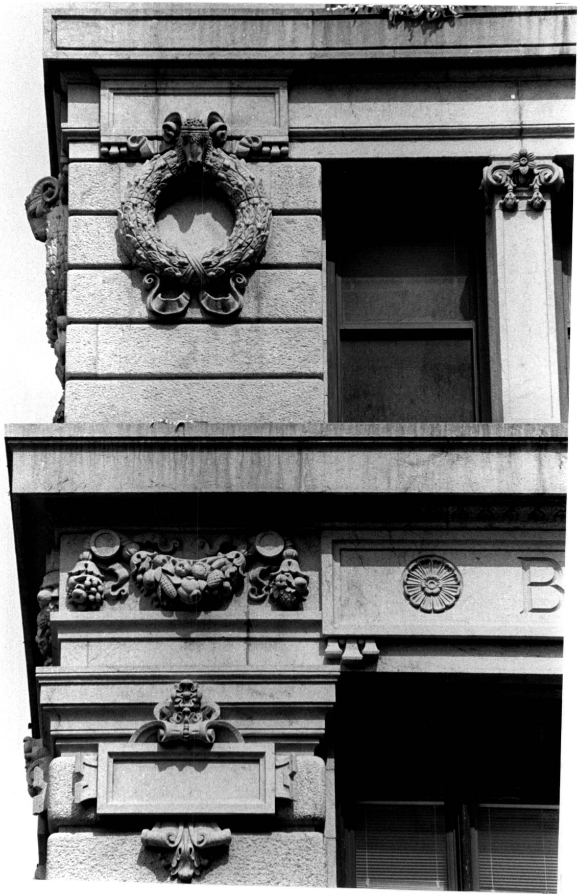
Fig. 2: Detail of ornament at second and third story, Broadway Facade.