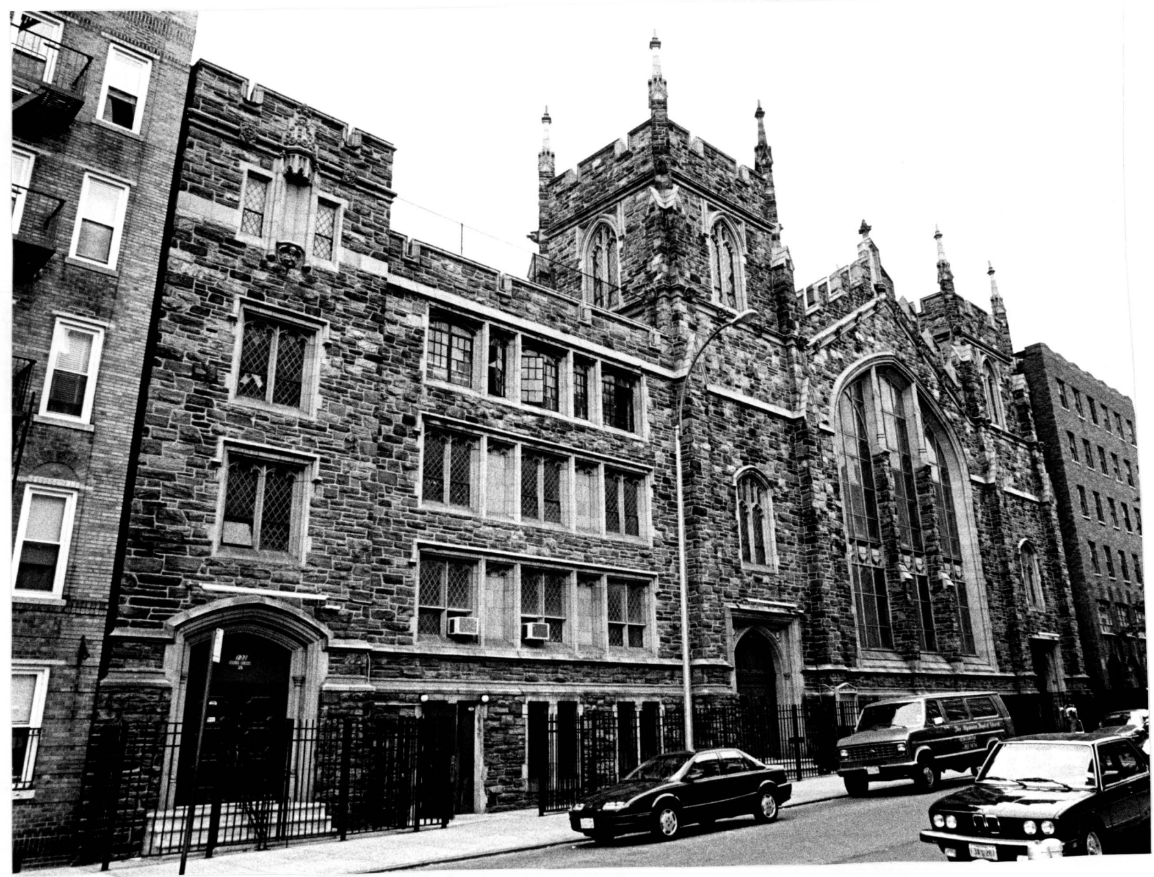
Abyssinian Baptist Church and Community House, Manhattan Community House (132-134 West 138th Street) and Church (136-142 West 138th Street)