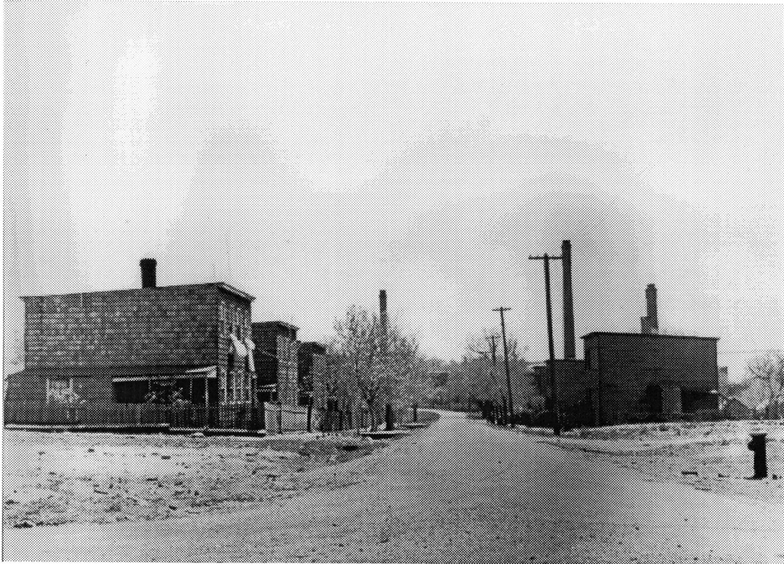
Kreischer Street, 1937. Kreischer Street Houses are on the left.