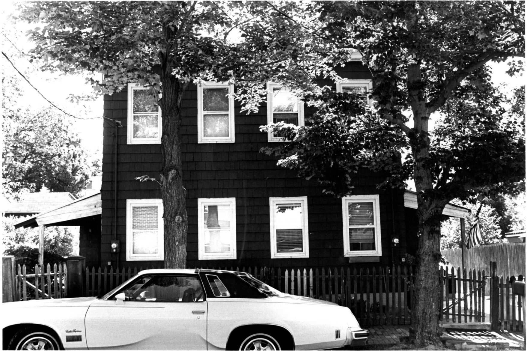
Kreischerville Workers' Houses, 85-87 Kreischer Street, Charleston, Staten Island.