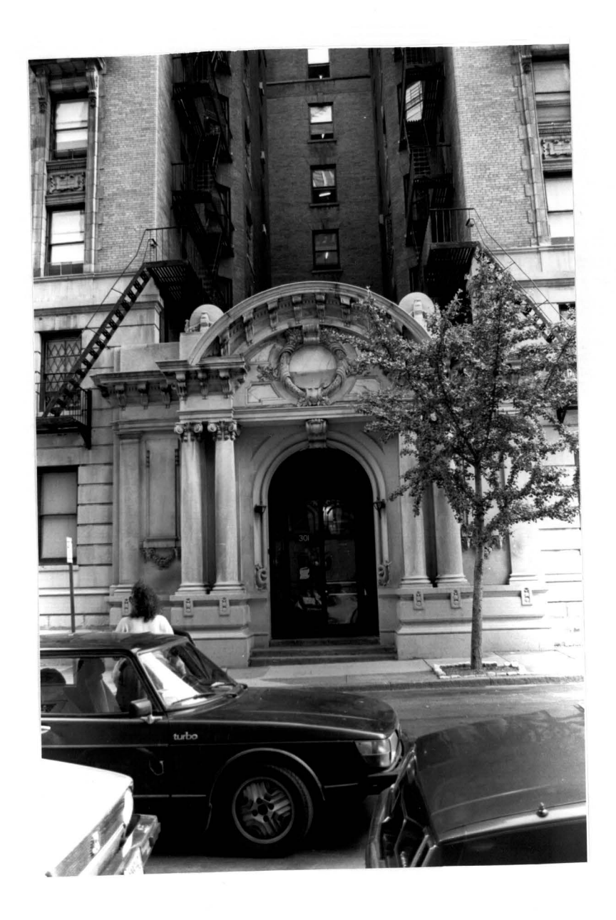
Detail of 301 West 108th Street entrance pavilion Photo: LPC, 1983