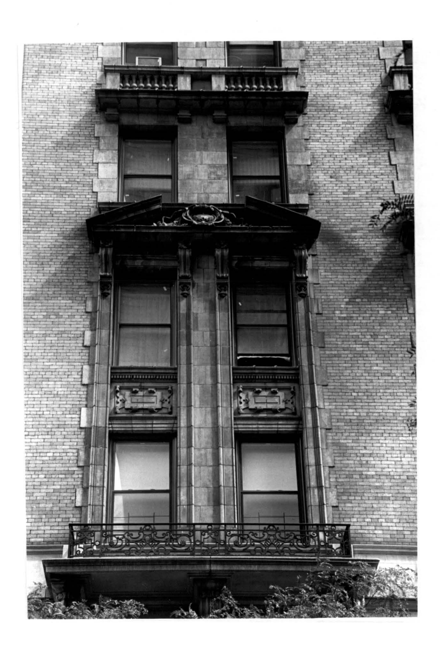
Detail of windows - 3rd to 5th floors Photo: Carl Forster, 1996