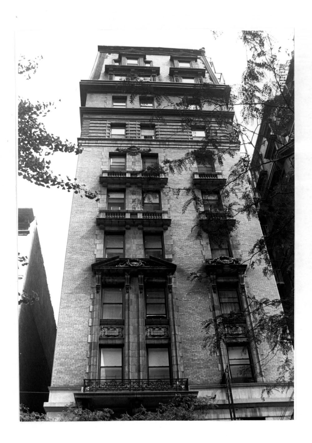
Detail of West 108th Street wing Photo: Carl Forster, 1996