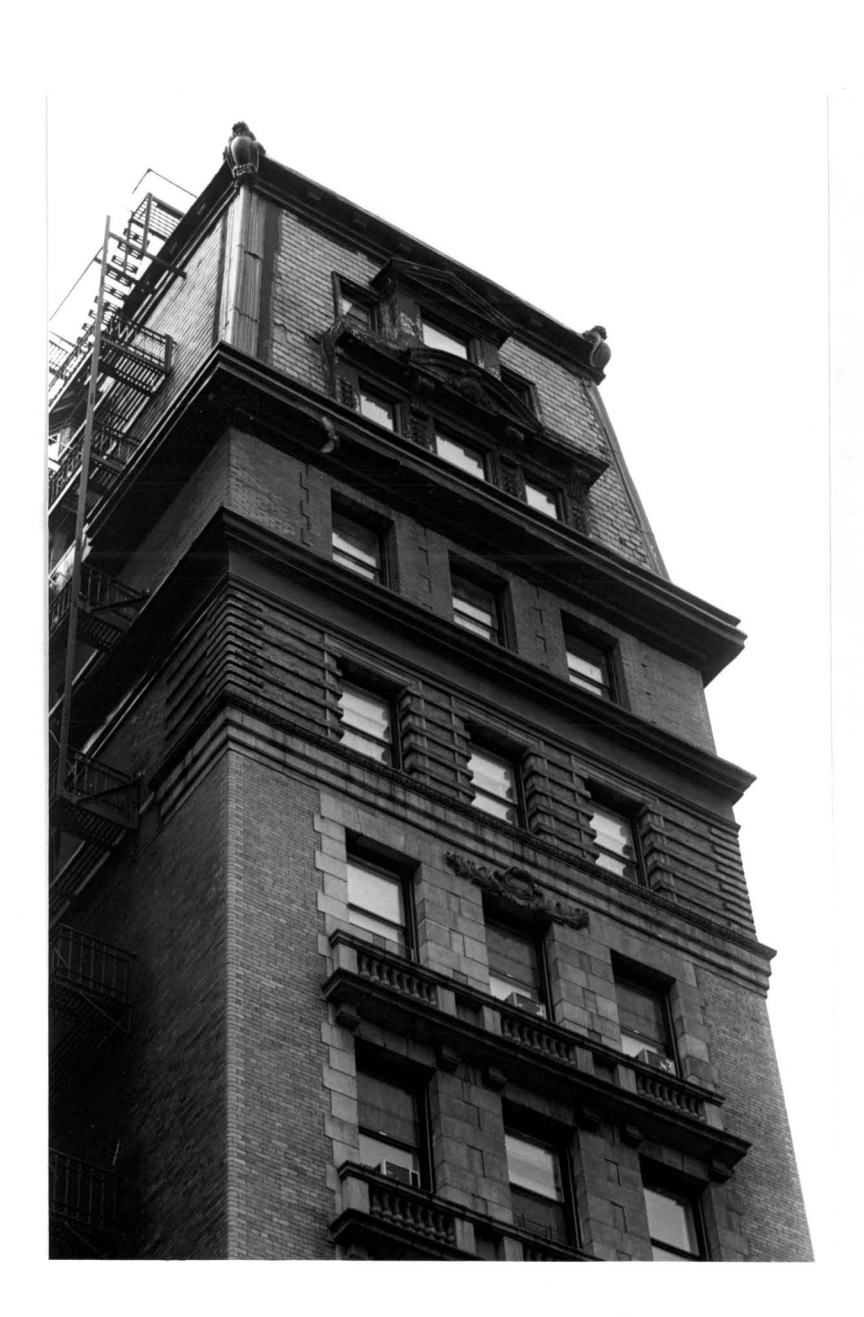
Detail of mansard roof - West 108th Street wing Photo: Carl Forster, 1996