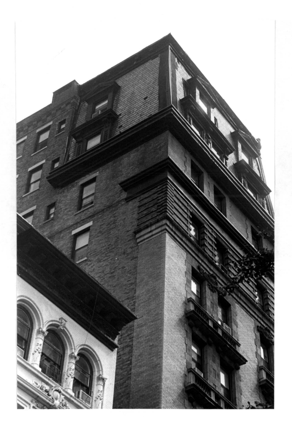
Detail of west elevation at roof level Photo: Carl Forster, 1996