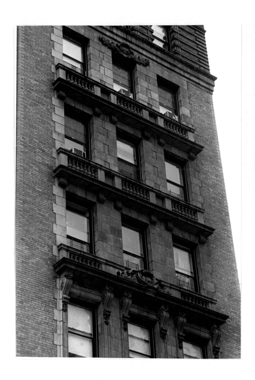
Detail of windows - 5th to 7th floors Photo: Carl Forsier, 1996