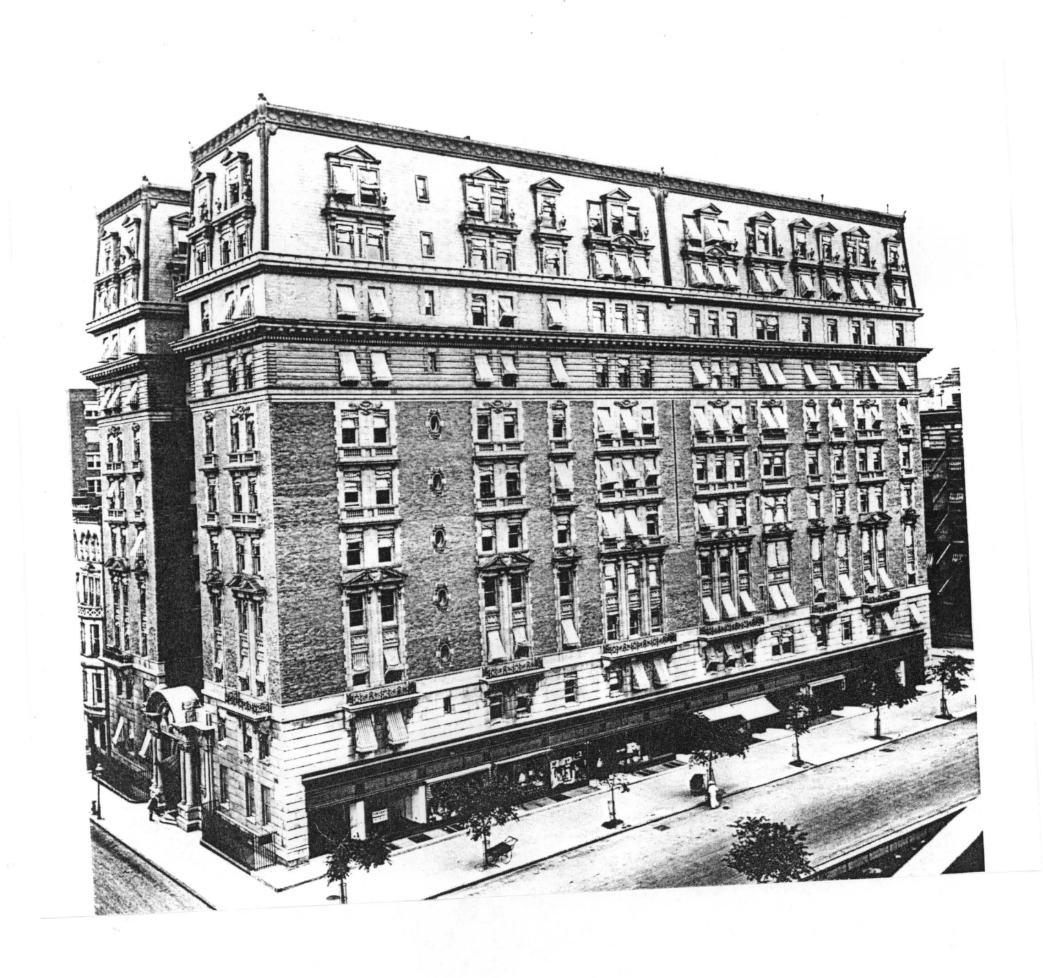
The Manhasset Apartments, c. 1920