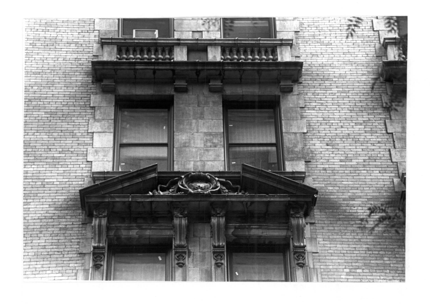
Detail of pediment above 4th floor windows - West 108th Street wing Photo: Carl Forster, 1996