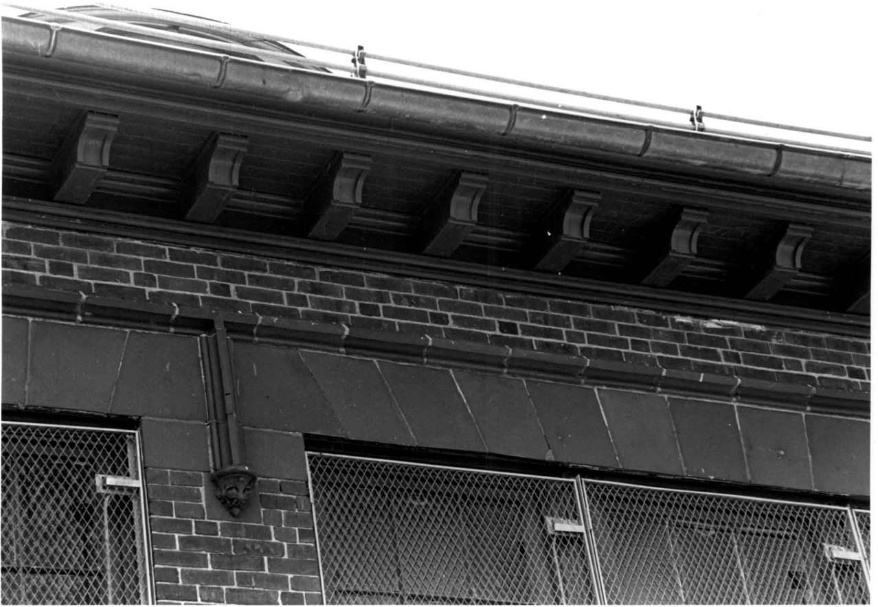
Detail of terra-cotta window lintels and bracketed roof cornice. Photo: Carl Forster, 1998.