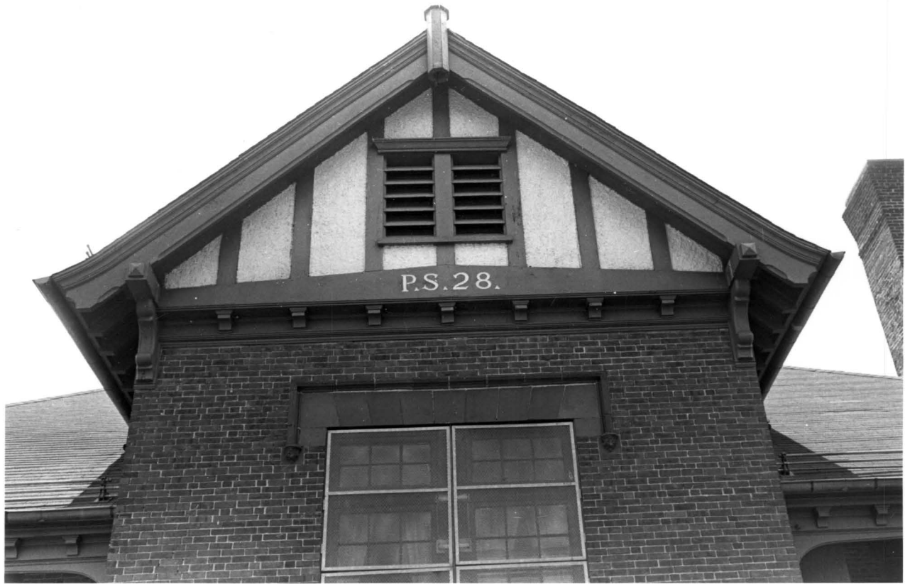
Detail of front gable.