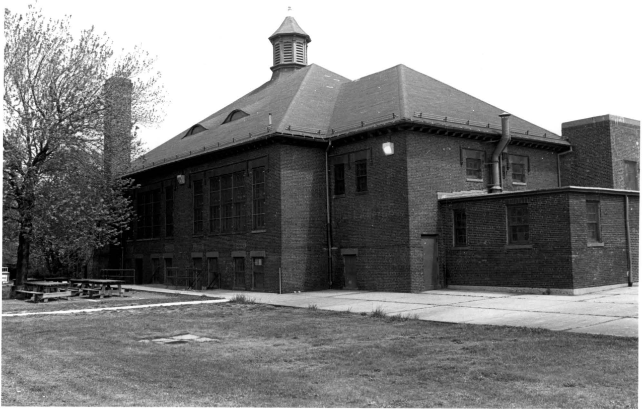
West facade and rear elevation with later additions.