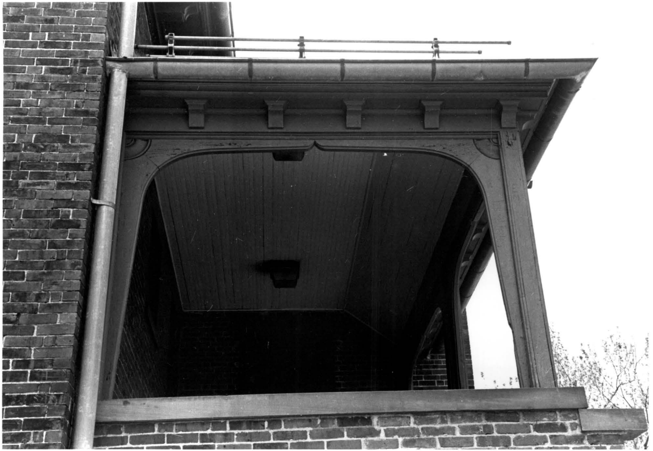
Detail of east porch.