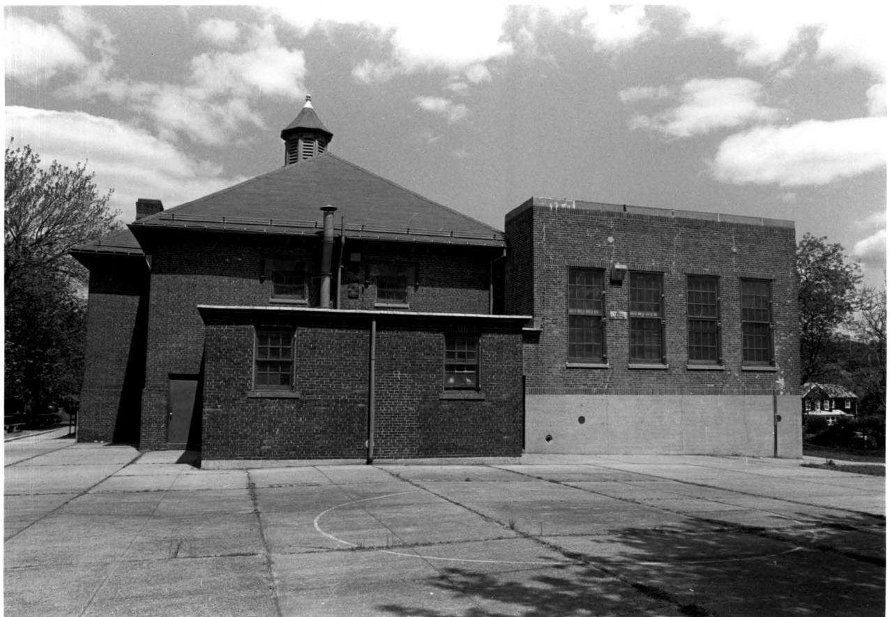
Rear elevations with early and mid-twentieth-century additions. Photo: Carl Forster, 1998.