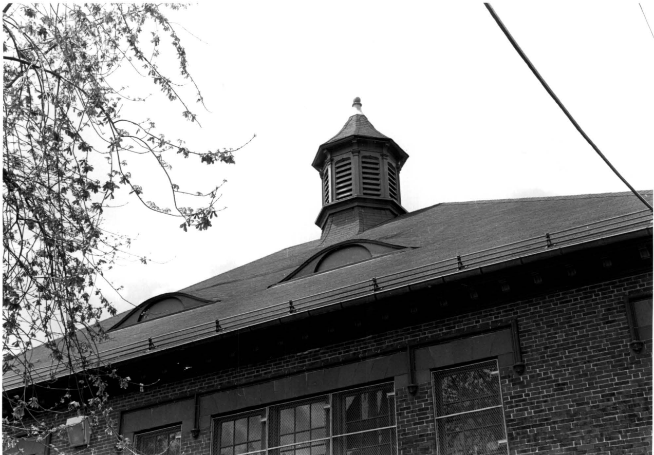
Roof detail with cupola and eyebrow windows