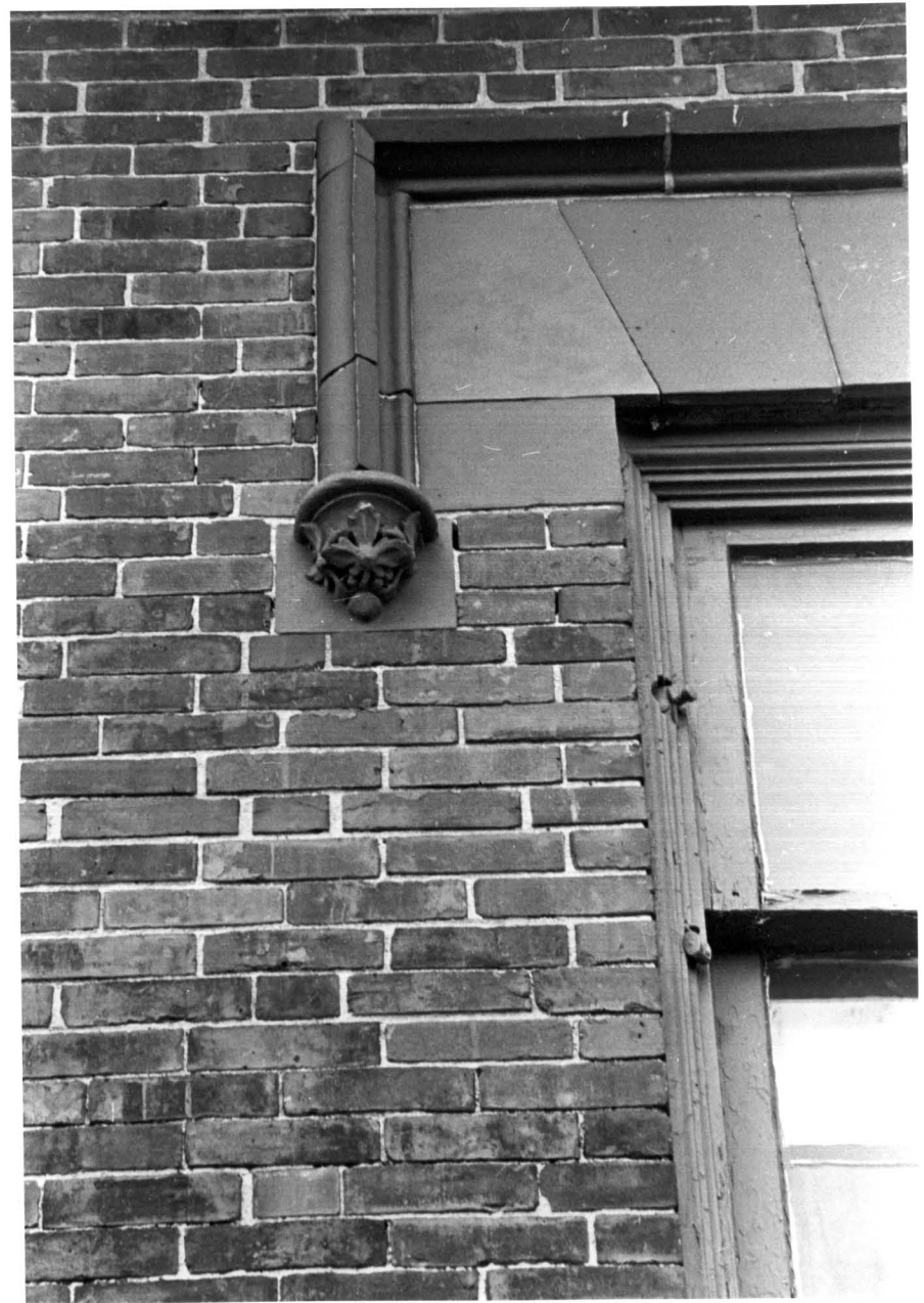
Detail of terra-cotta label molding.