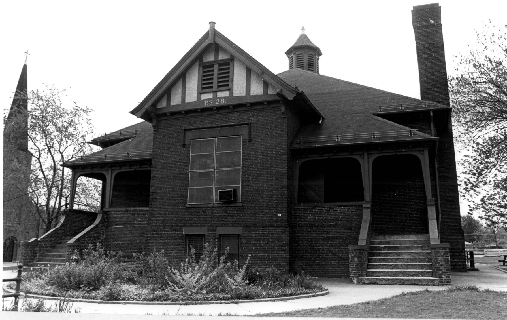
(Former) Public School 28, 276 Center Street, Staten Island.