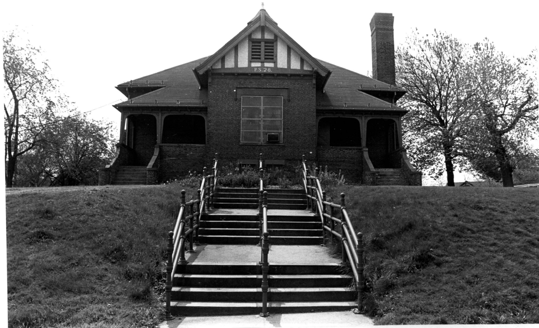
(Former) Public School 28, 276 Center Street, Staten Island.