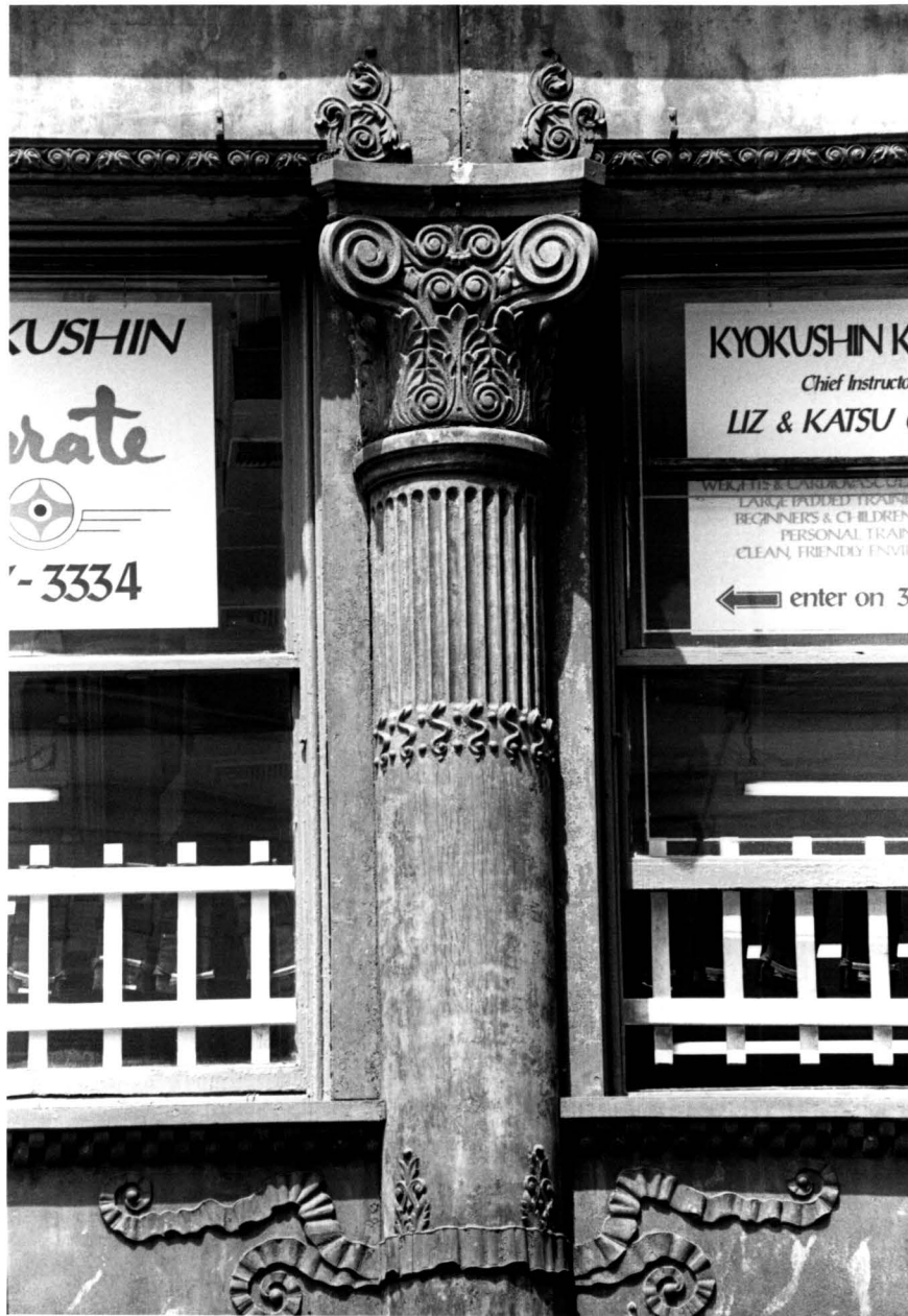
The Wilbraham, cast-iron column detail