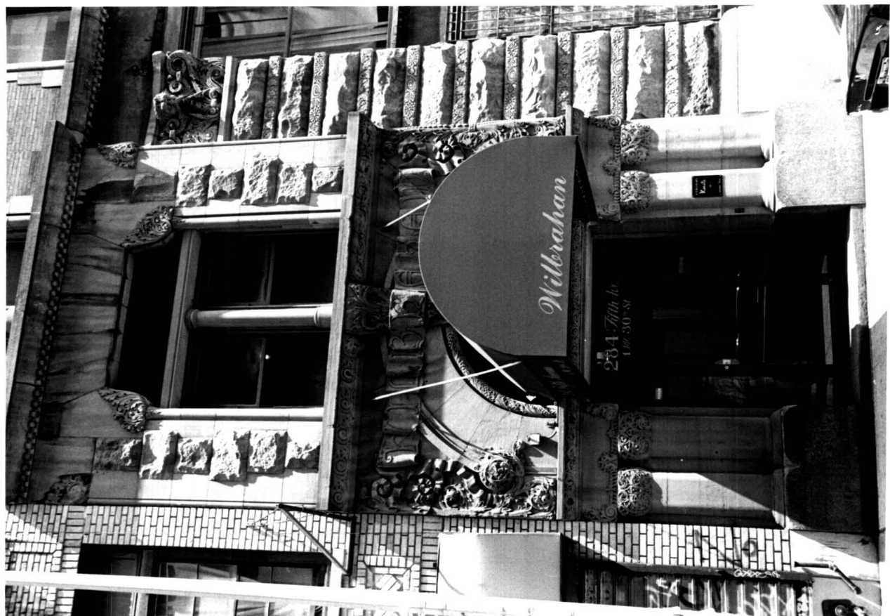
The Wilbraham, West 30 th Street entrance