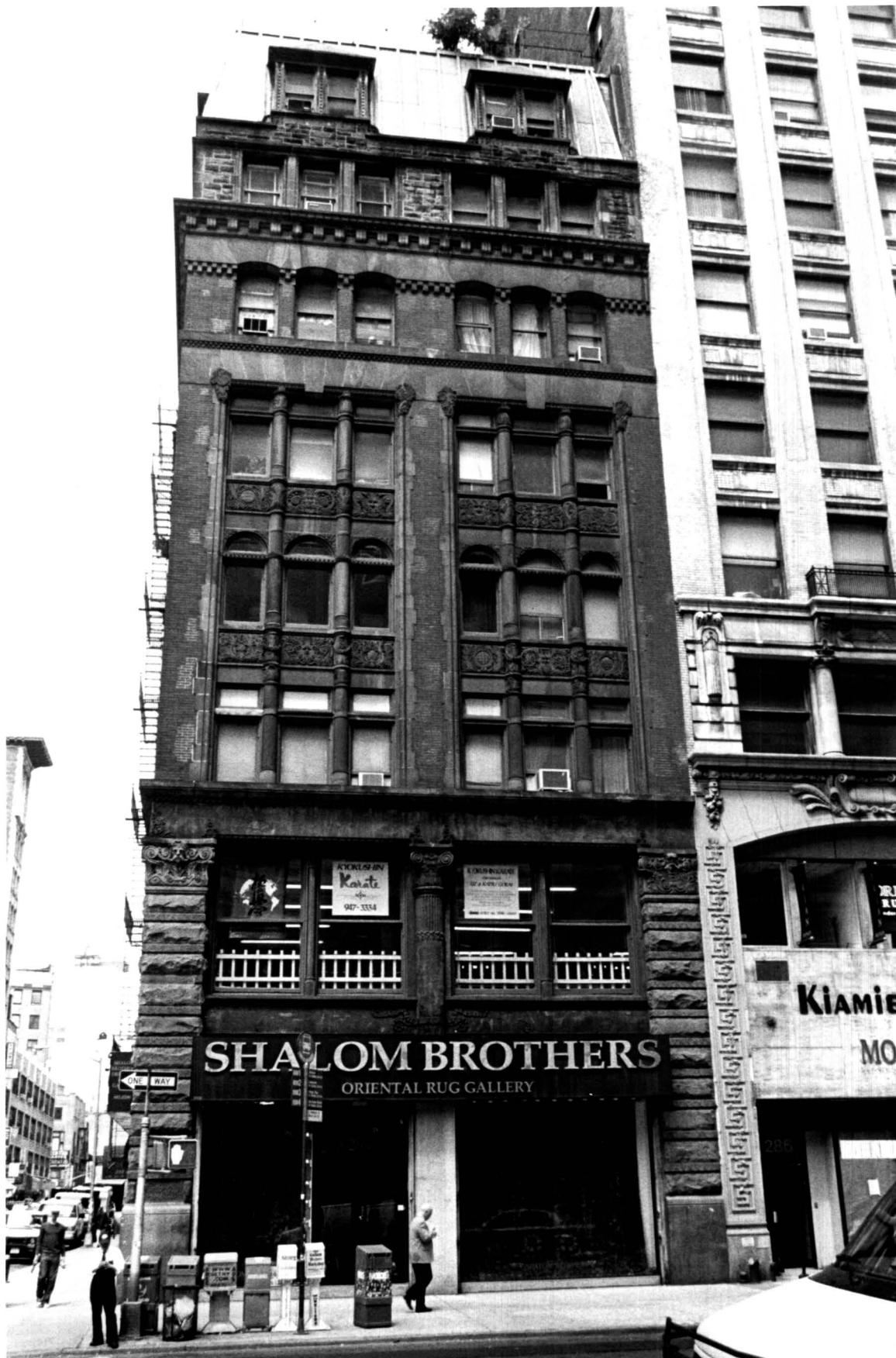
The Wilbraham, Fifth Avenue facade