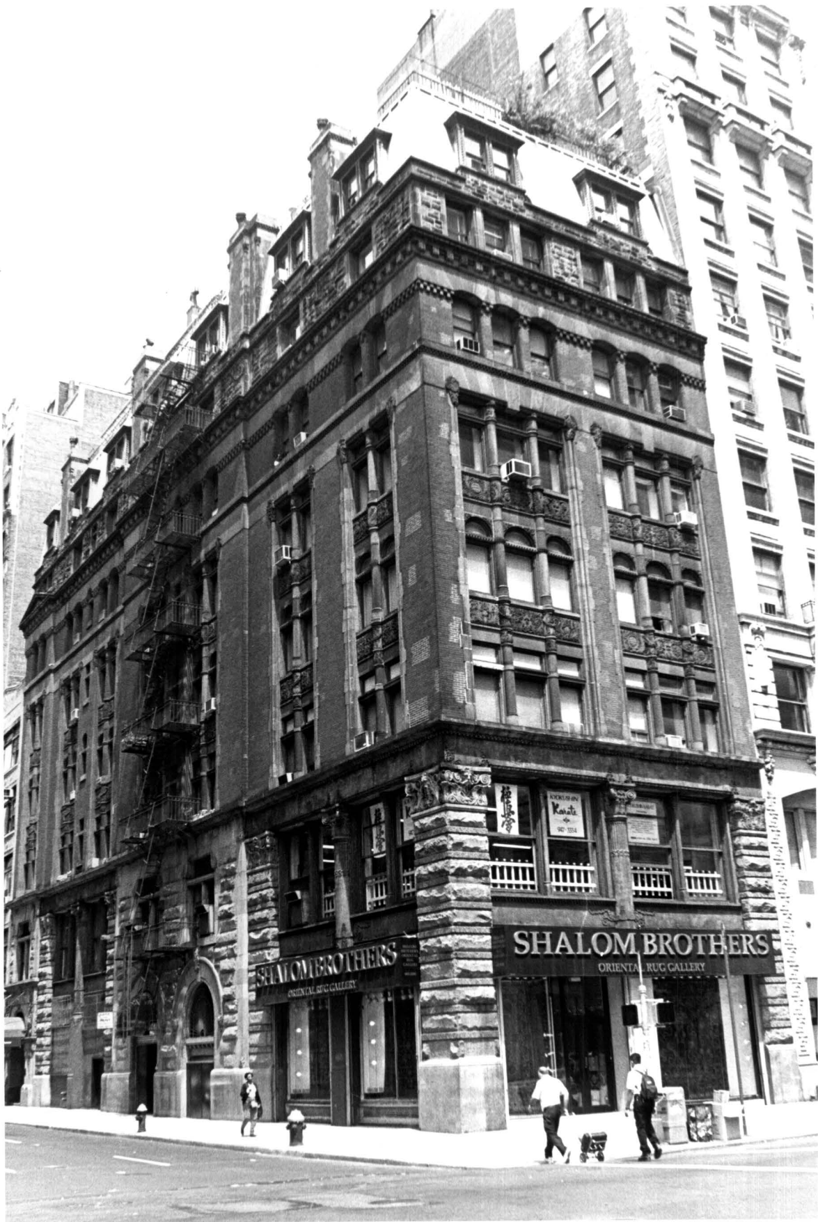
The Wilbraham, 1 West 30 th Street (aka 282-284 Fifth Avenue)