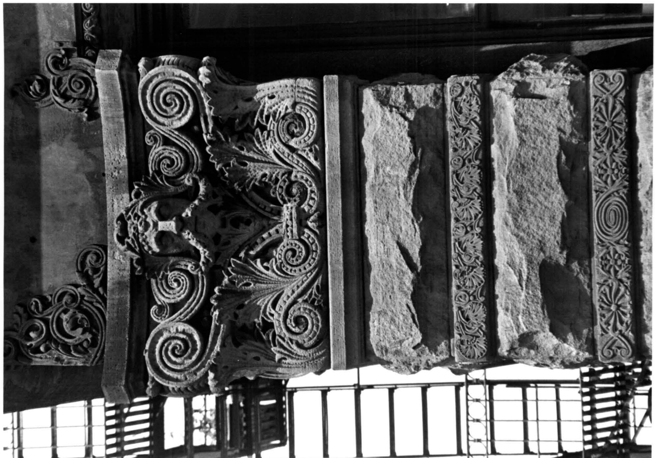
The Wilbraham, pier carving details