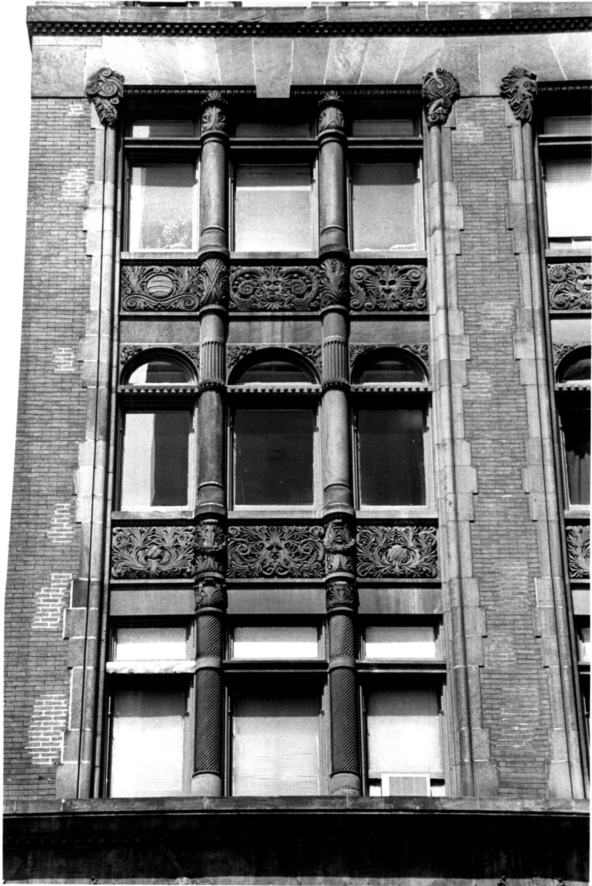
The Wilbraham, Fifth Avenue facade, detail of third through fifth stories