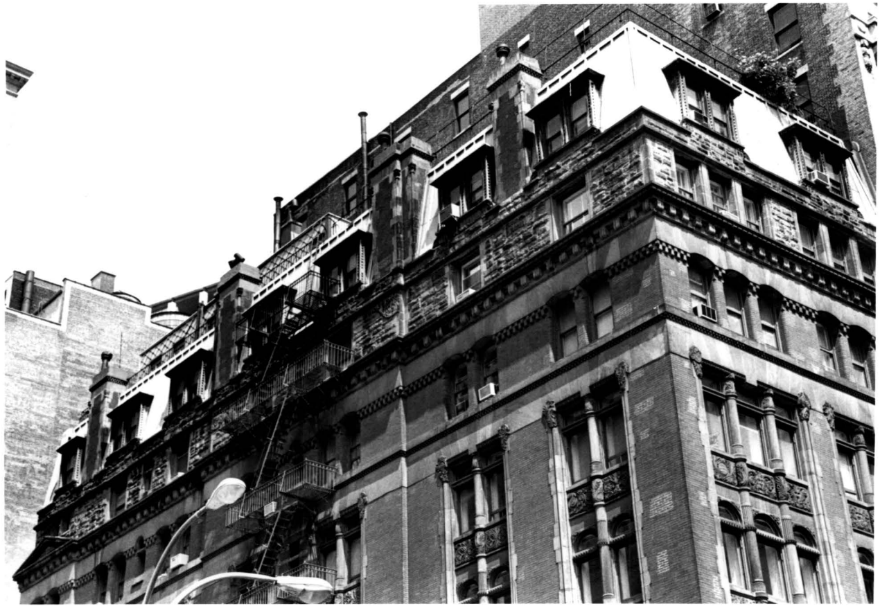
The Wilbraham, upper section