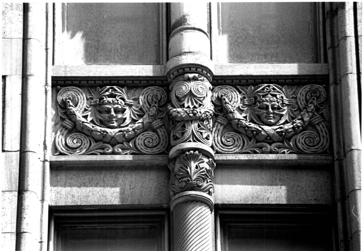
The Wilbraham, spandrel details