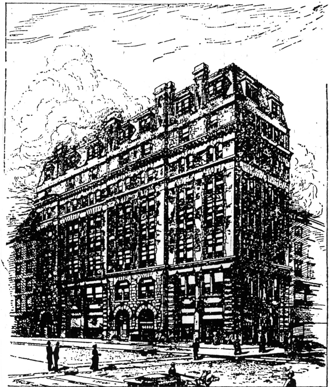
The Wilbraham, rendering