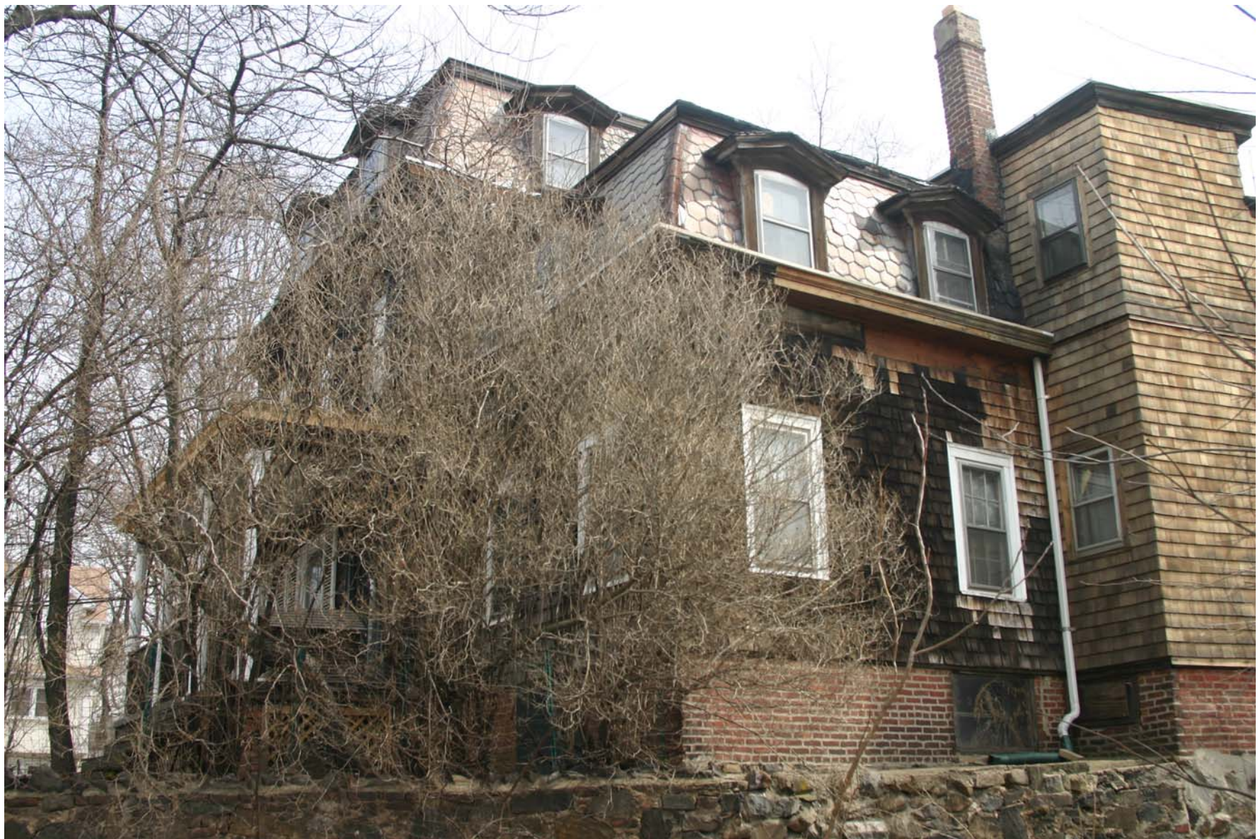
John De Groot House, Dining room wing and kitchen-bathroom addition