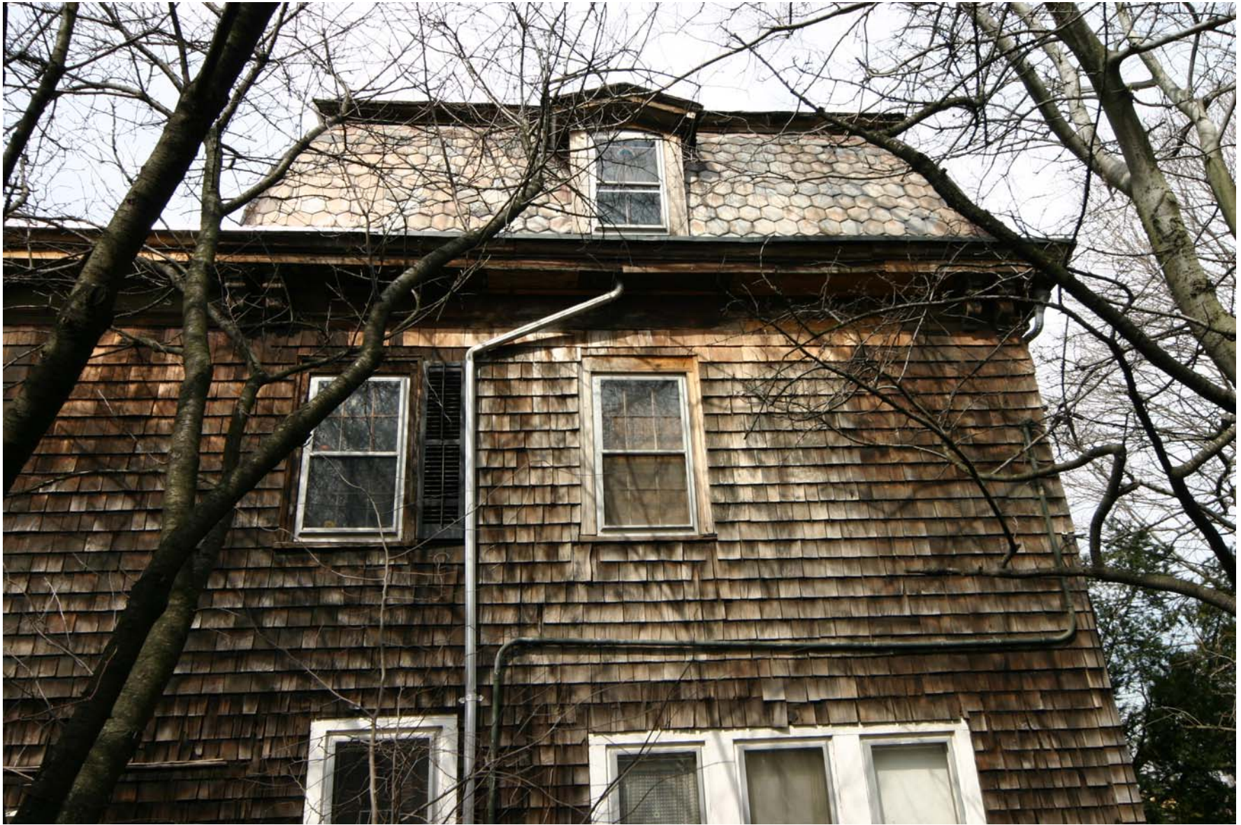
John De Groot House, Detail south (rear) façade