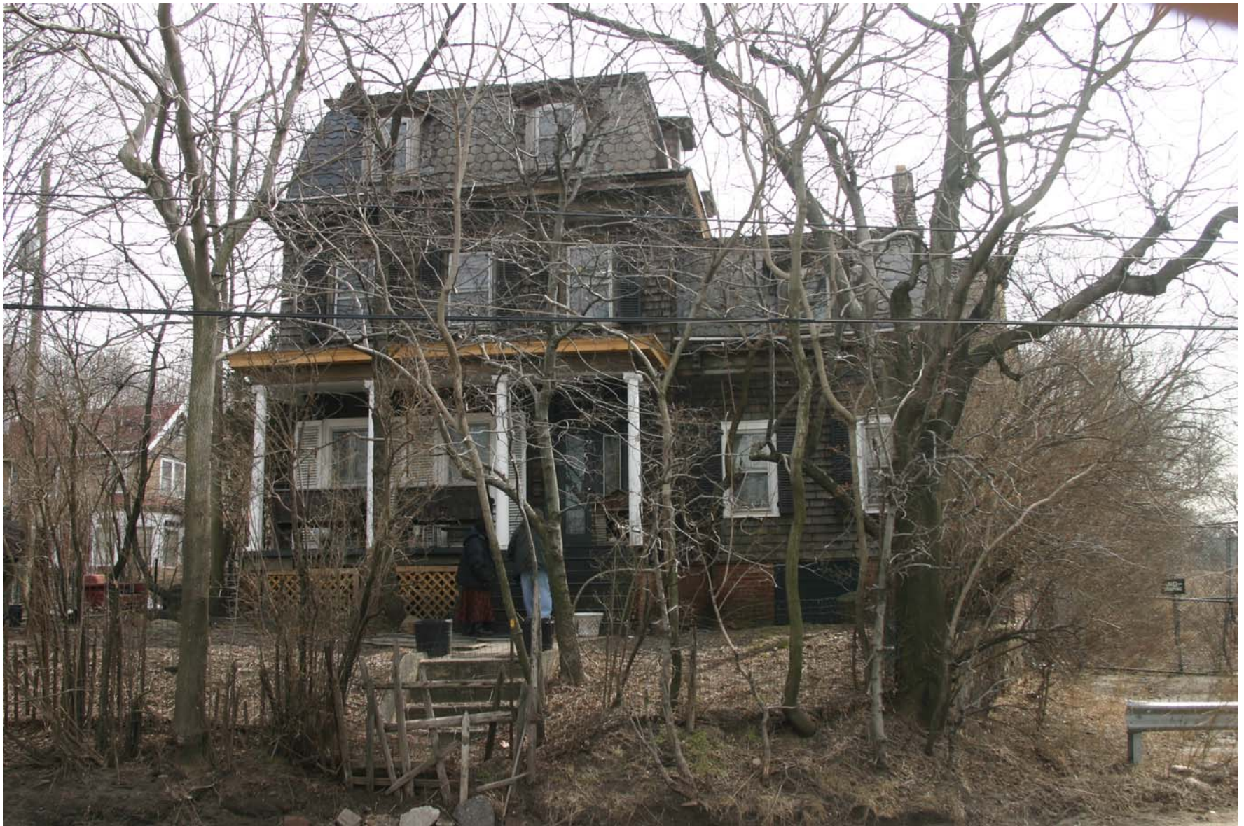
John De Groot House, 1674 Richmond Terrace, Staten Island