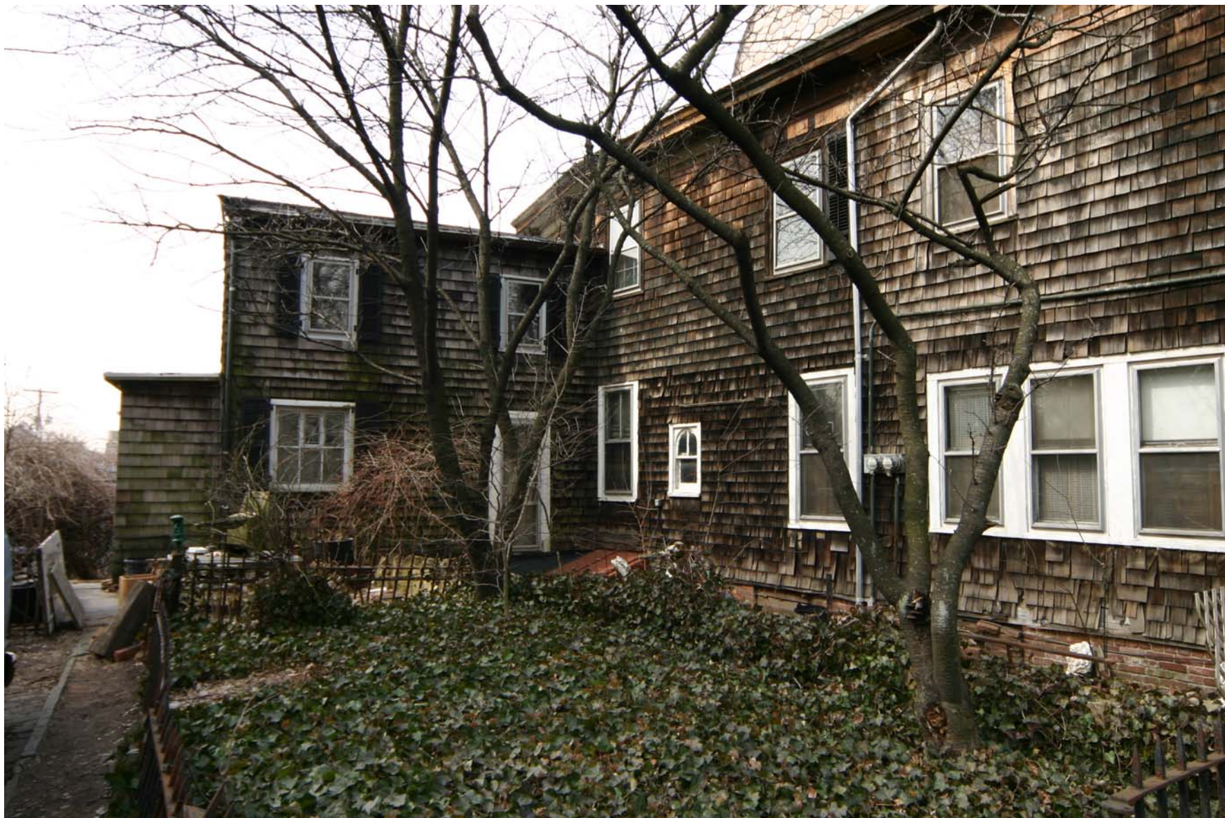
John De Groot House, Rear ell, built c. 1810-15, raised to two stories late 19th century, Photo Carl Forster