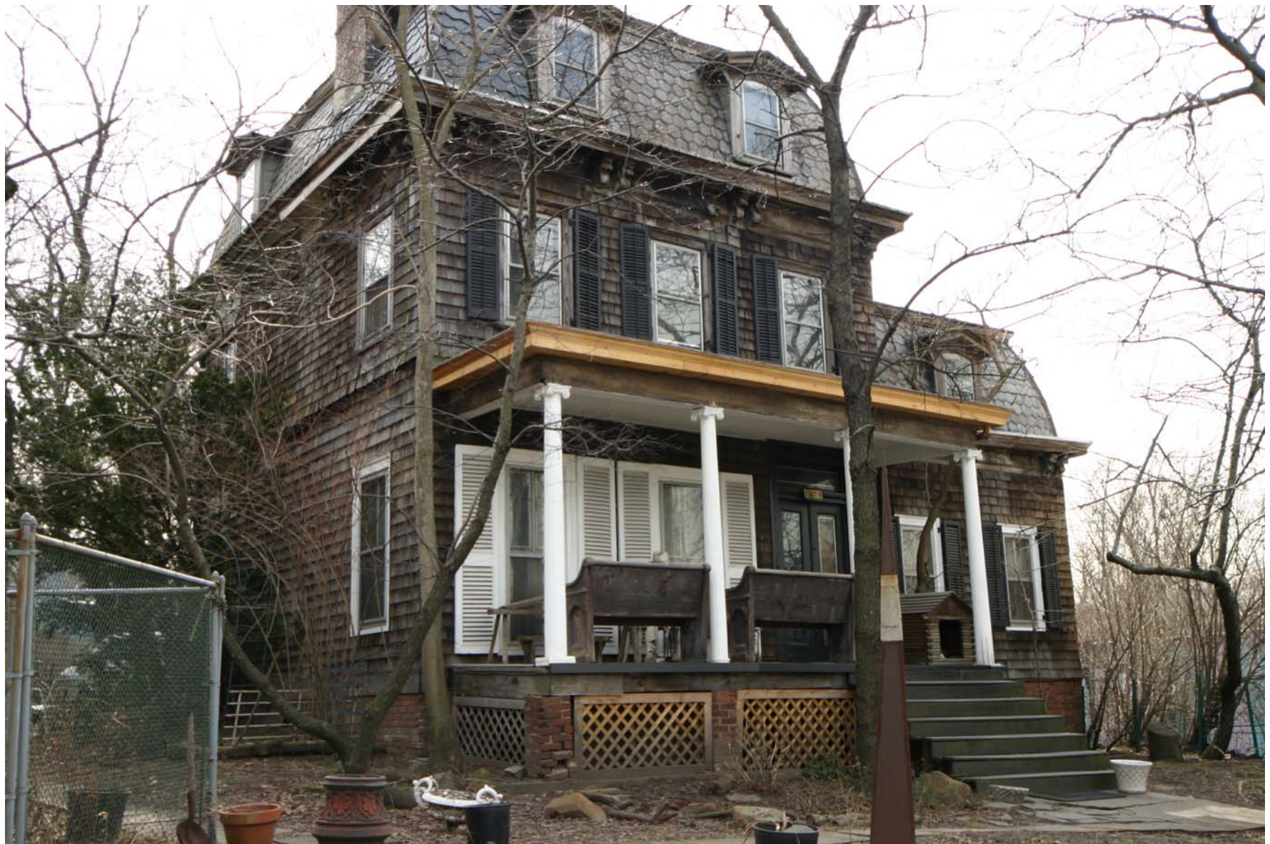
John De Groot House, 1674 Richmond Terrace, Staten Island, Photo Carl Forster