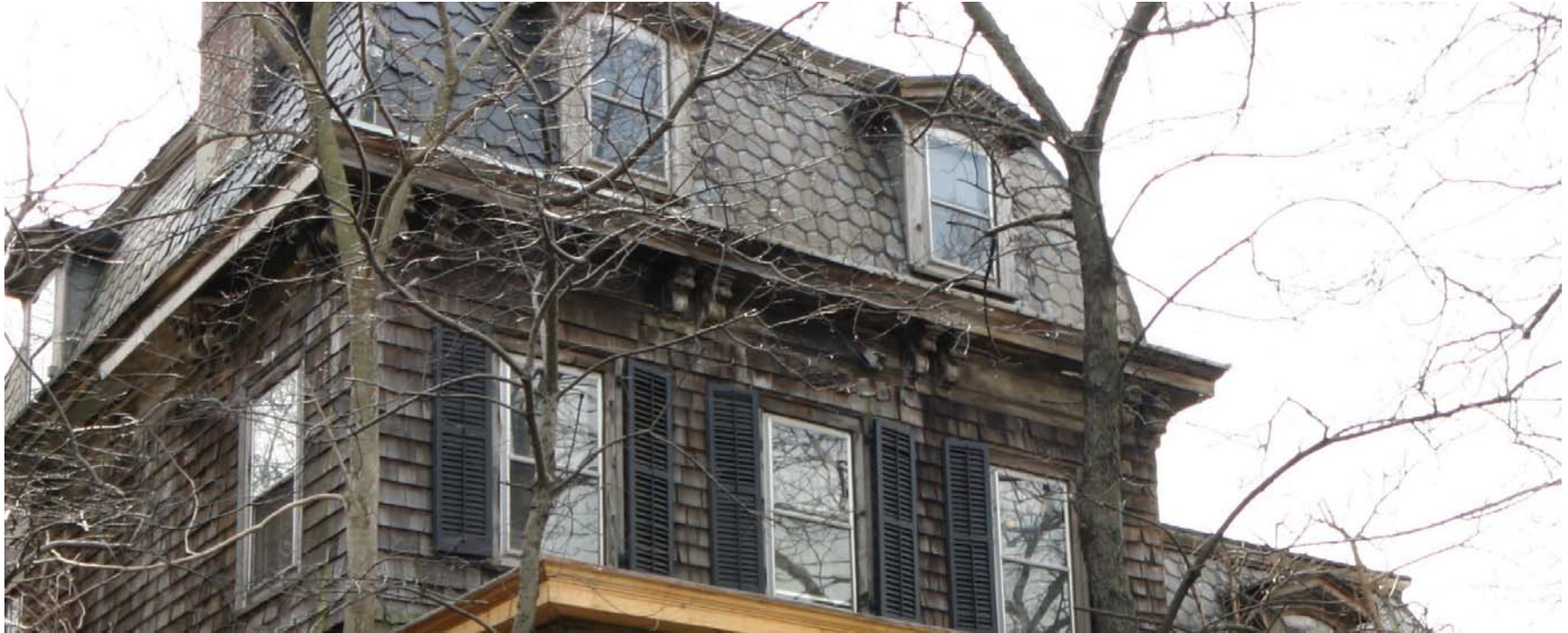
John De Groot House, Detail of upper stories