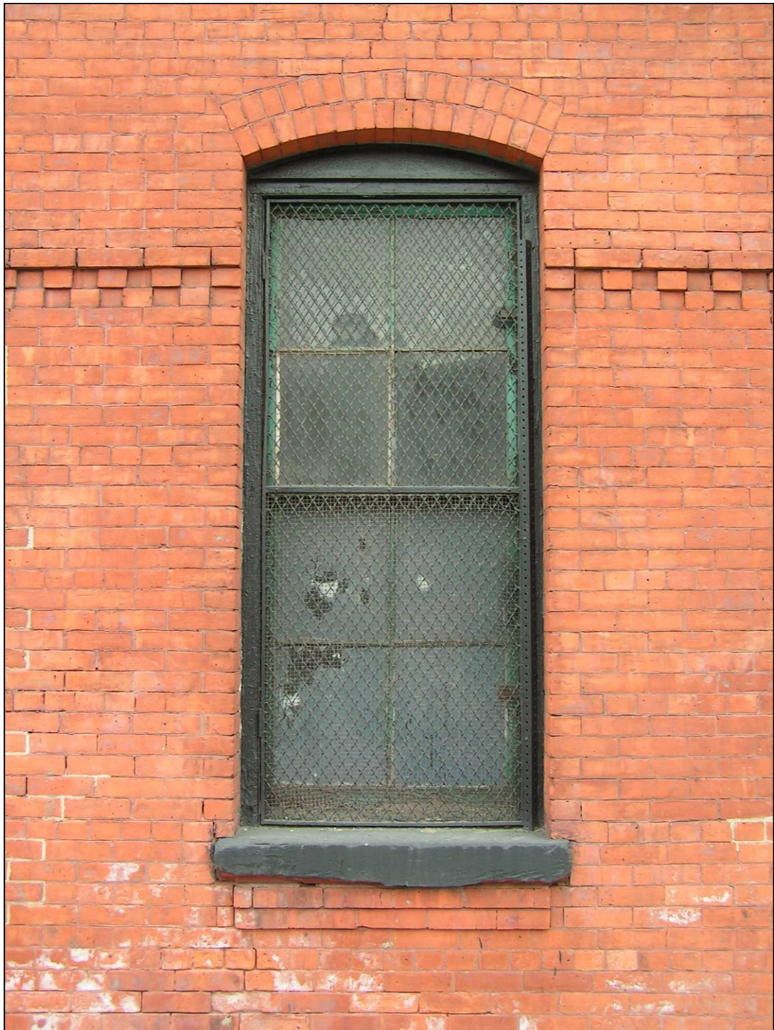
Estey Piano Company Factory, typical four-over-four double-hung wood window with wood frame.