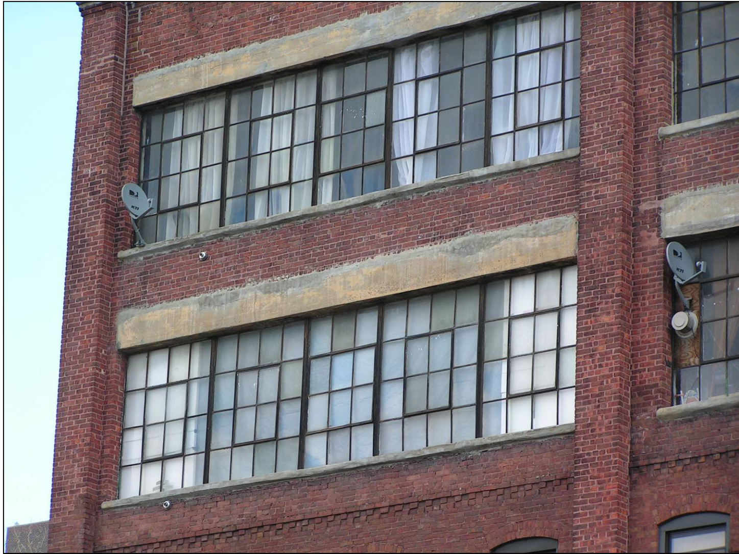
Estey Piano Company Factory, typical windows on 1919 addition.