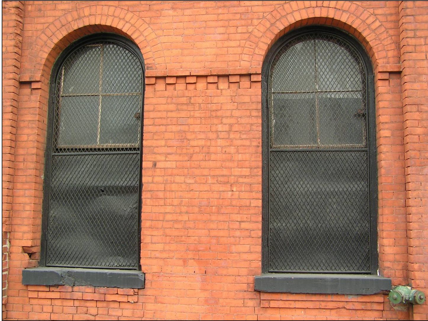
Estey Piano Company Factory, first-floor windows on Lincoln Avenue façade.