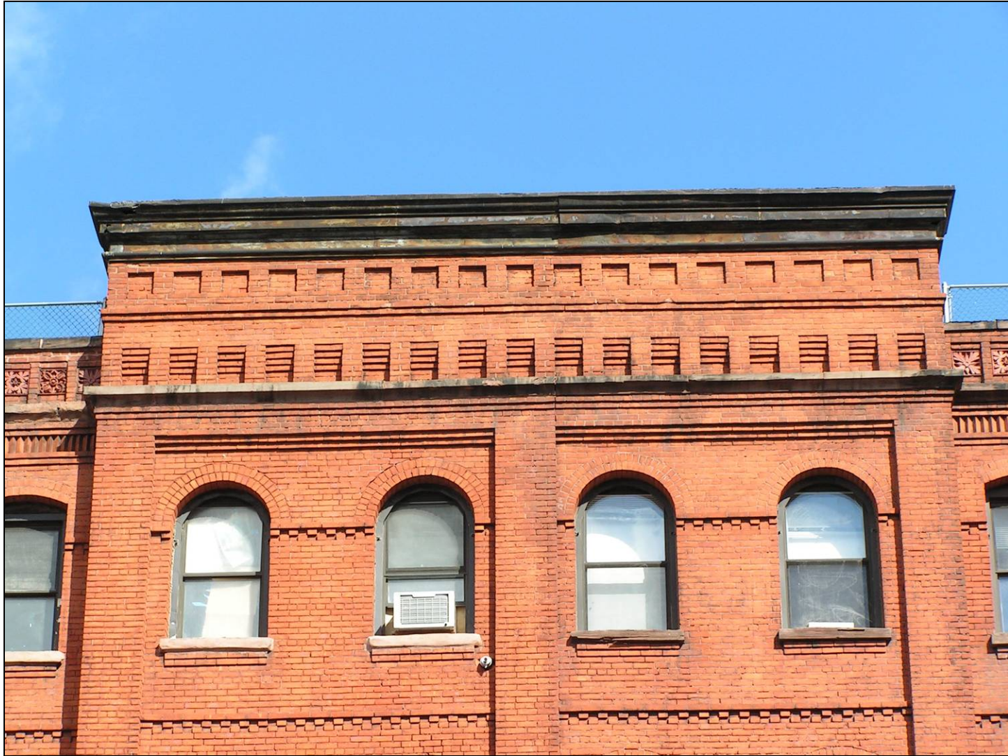
Estey Piano Company Factory, parapet.