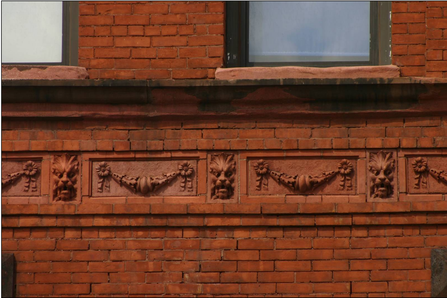
Estey Piano Company Factory, terra cotta belt course. Photo: Carl Forster