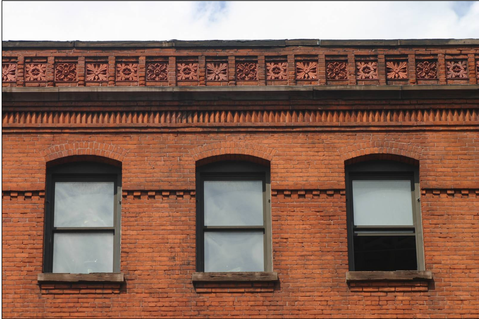
Estey Piano Company Factory, parapet and top story.