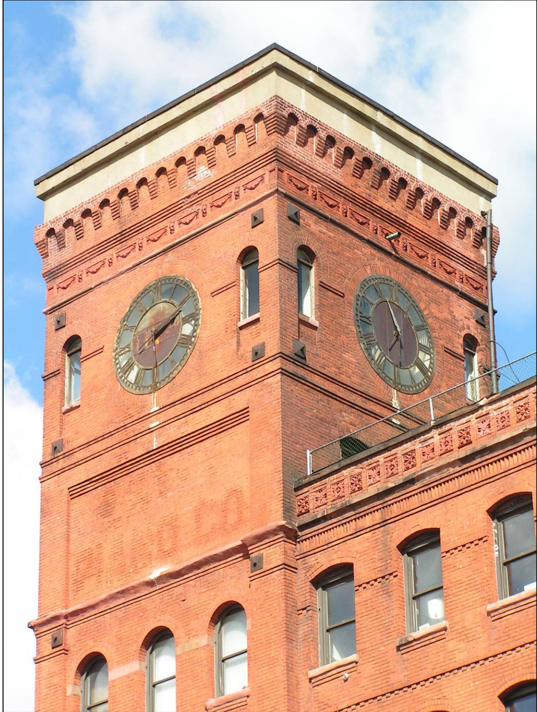
Estey Piano Company Factory, south (left) and east (right) faces of the clock tower.