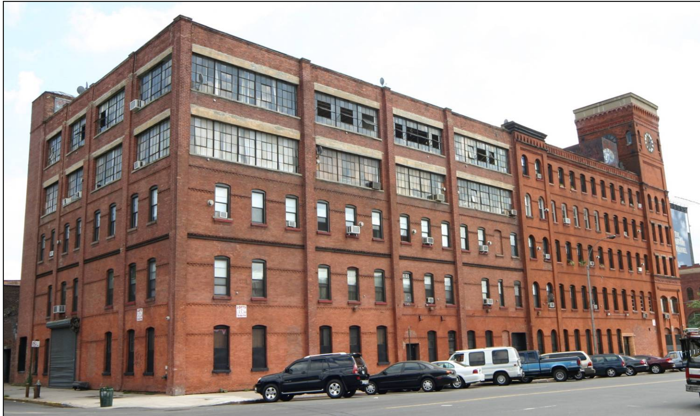
Estey Piano Company Factory, 134 th Street, or north (left) and Lincoln Avenue (center and right) facades.