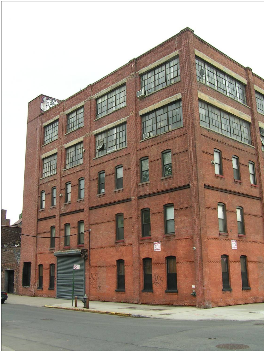
Estey Piano Company Factory, 134 th Street (north) façade. The elevator shaft at the eastern end of this façade was built at the same time as the top two stories, in 1919.