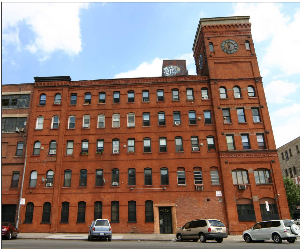
Estey Piano Company Factory, southernmost portion of the Lincoln Avenue façade. The original, 1885-86 portion of this façade comprises the clock tower, the ten upper-story bays immediately to the north of the tower, and the round-arched, two-bay projection.