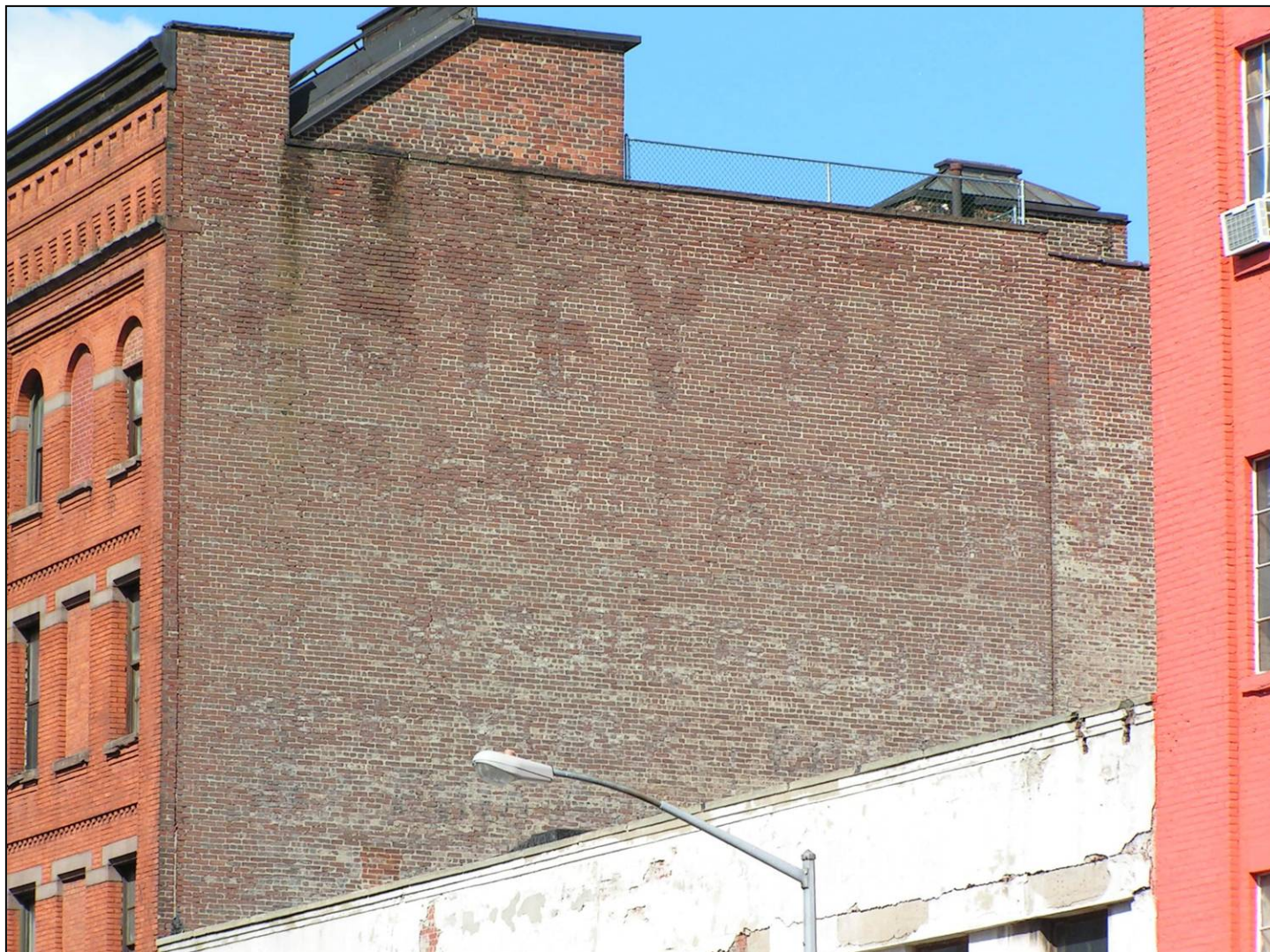
Estey Piano Company Factory, east façade of the Bruckner Boulevard leg of the building. The white building at lower-center and the building at far-right are not included in this Designation.