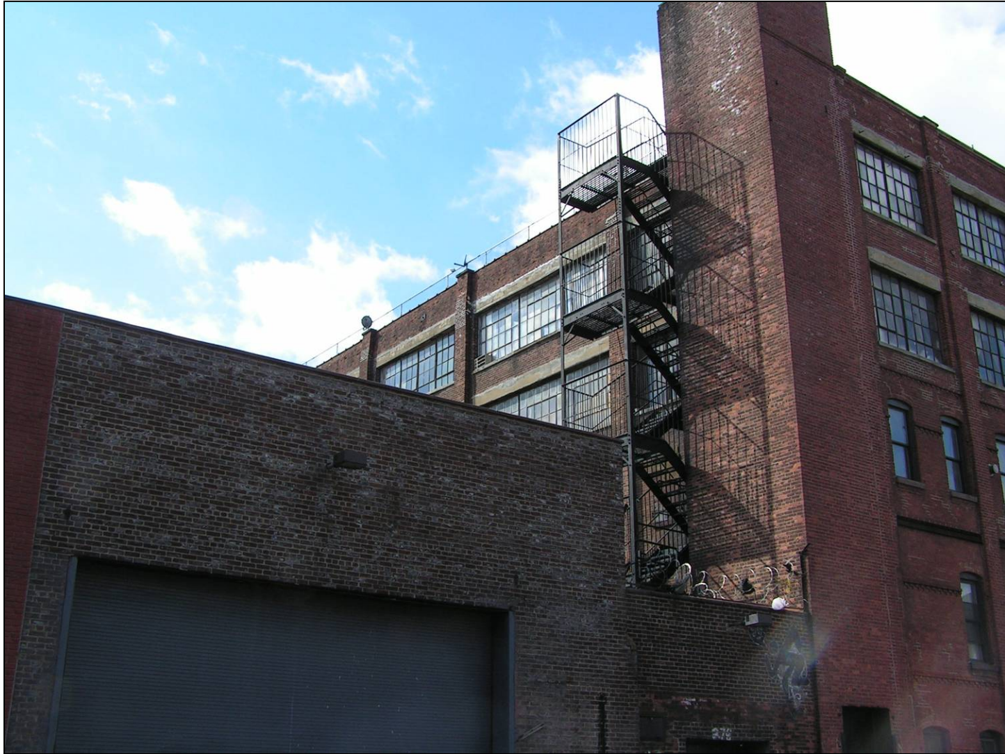
Estey Piano Company Factory, portion of the 134 th Street façade (right) and portion of the east (rear) façade of the Lincoln Avenue leg of the building (center). The buildings to the left of the elevator shaft are not included in this Designation.