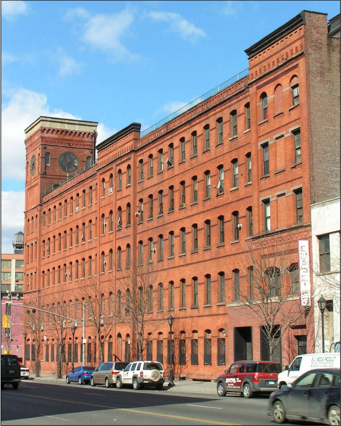
Estey Piano Company Factory, Bruckner Boulevard façade.