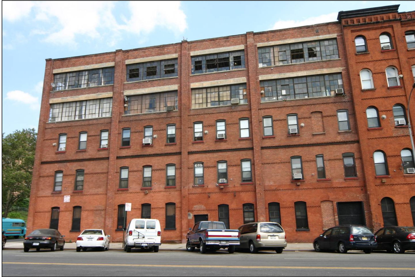
Estey Piano Company Factory, Lincoln Avenue façade, showing the first-floor addition apparently dating from 1895 and later expanded; the second- and third-floor additions dating from 1909; and the fourth- and fifth-floor additions dating from 1919.