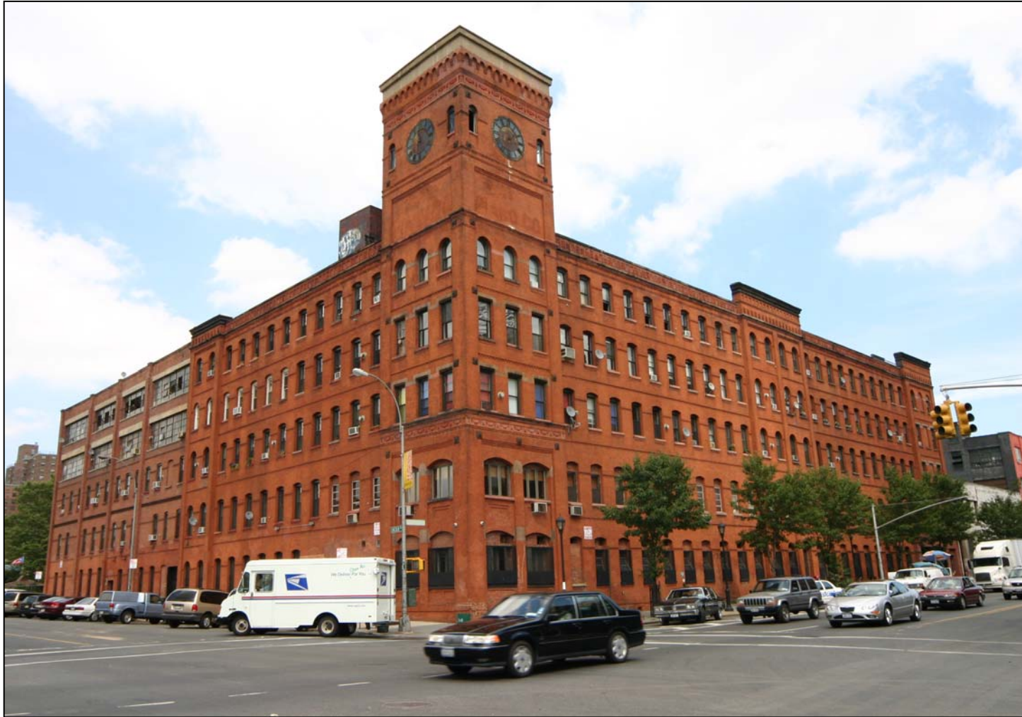
Estey Piano Company Factory, Lincoln Avenue (west) façade at left; Bruckner (formerly Southern) Boulevard (south) façade at right.