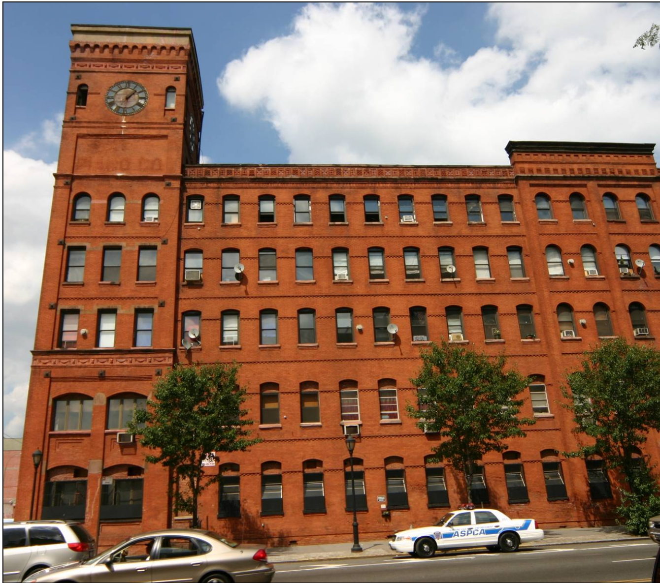
Estey Piano Company Factory, westernmost portion of the Bruckner Boulevard façade. The original, 1885-86 portion of this façade comprises the clock tower, the ten bays immediately to the east of the tower, and the two westernmost bays of the round-arched, four-bay projection.