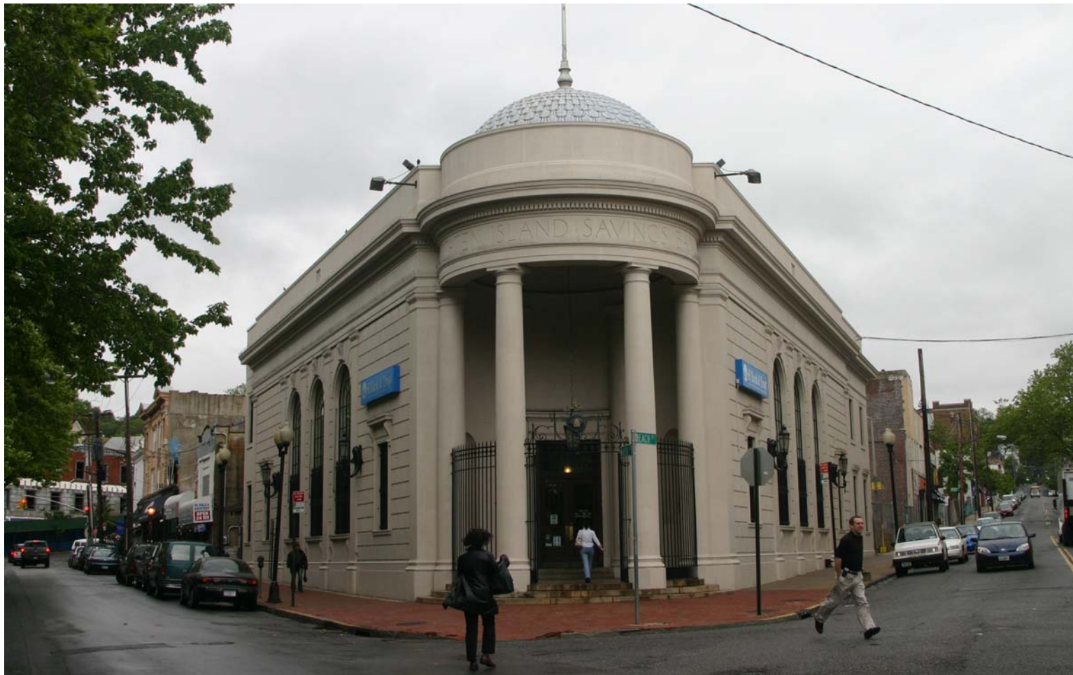
Staten Island Savings Bank Building 81 Water Street Staten Island