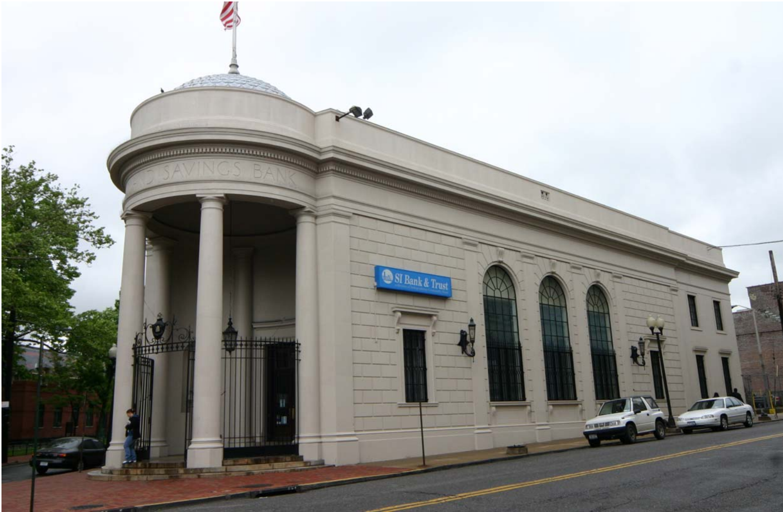
Staten Island Savings Bank Building Beach Street facade