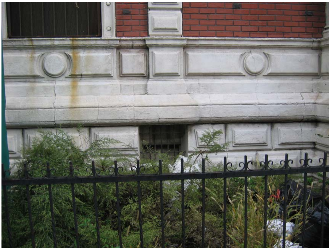
New York and Long Island Coignet Stone Company Building Third Avenue stairs Third Avenue, south part of base