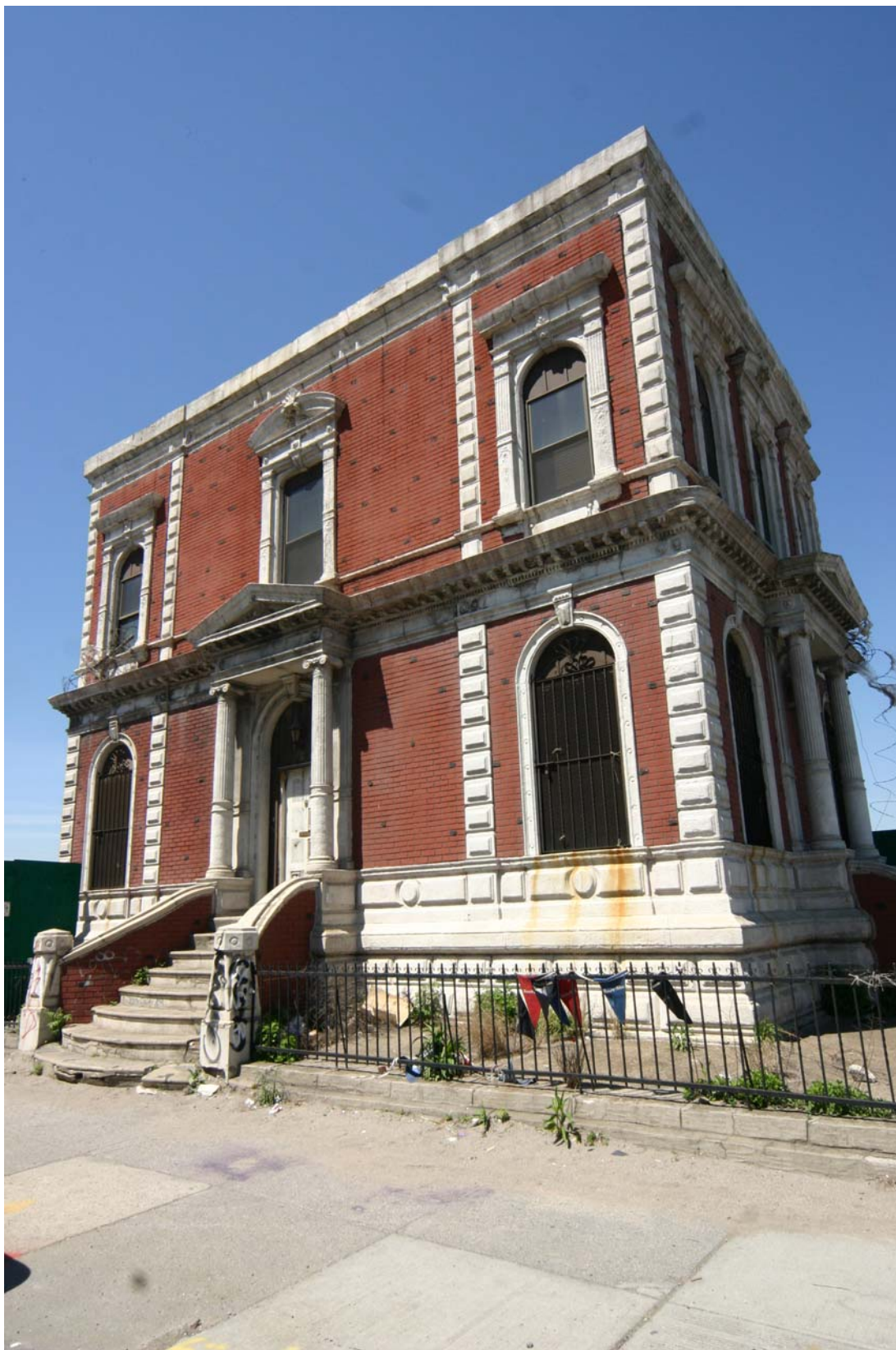
New York and Long Island Coignet Stone Company Building Third Avenue facade