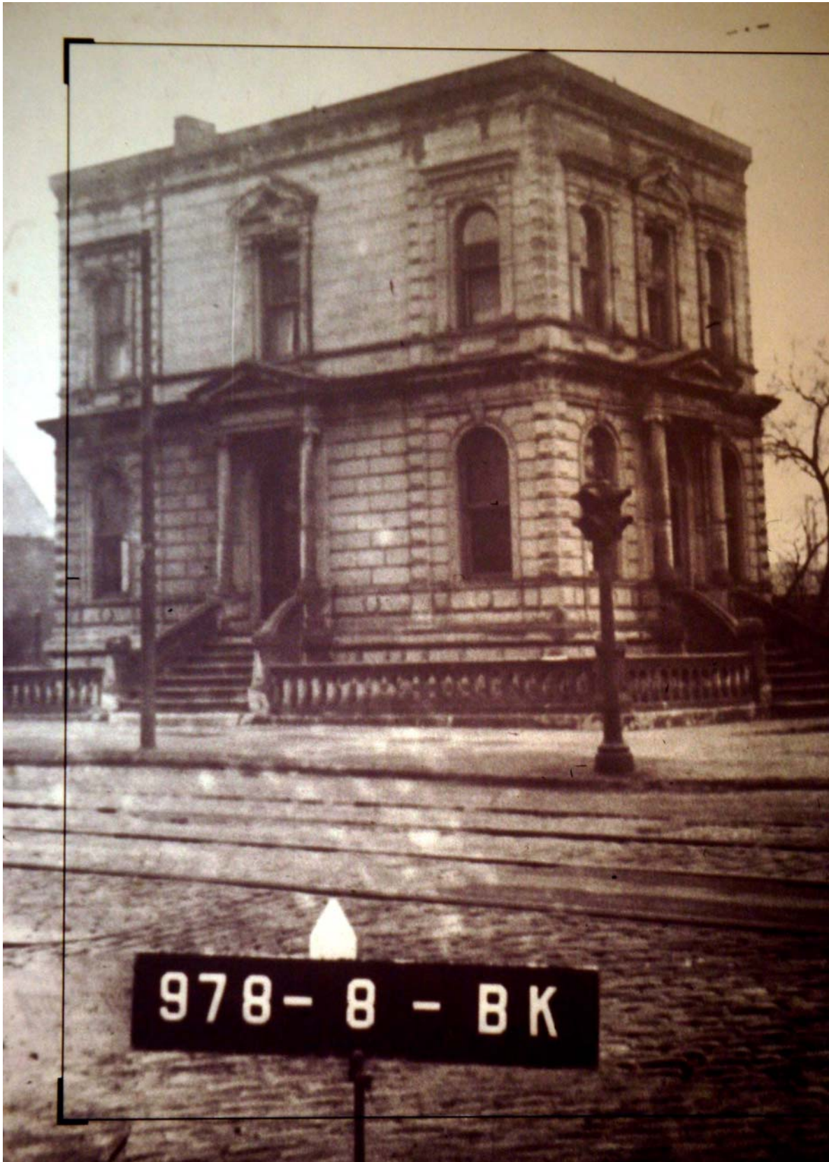
New York and Long Island Coignet Stone Company Building