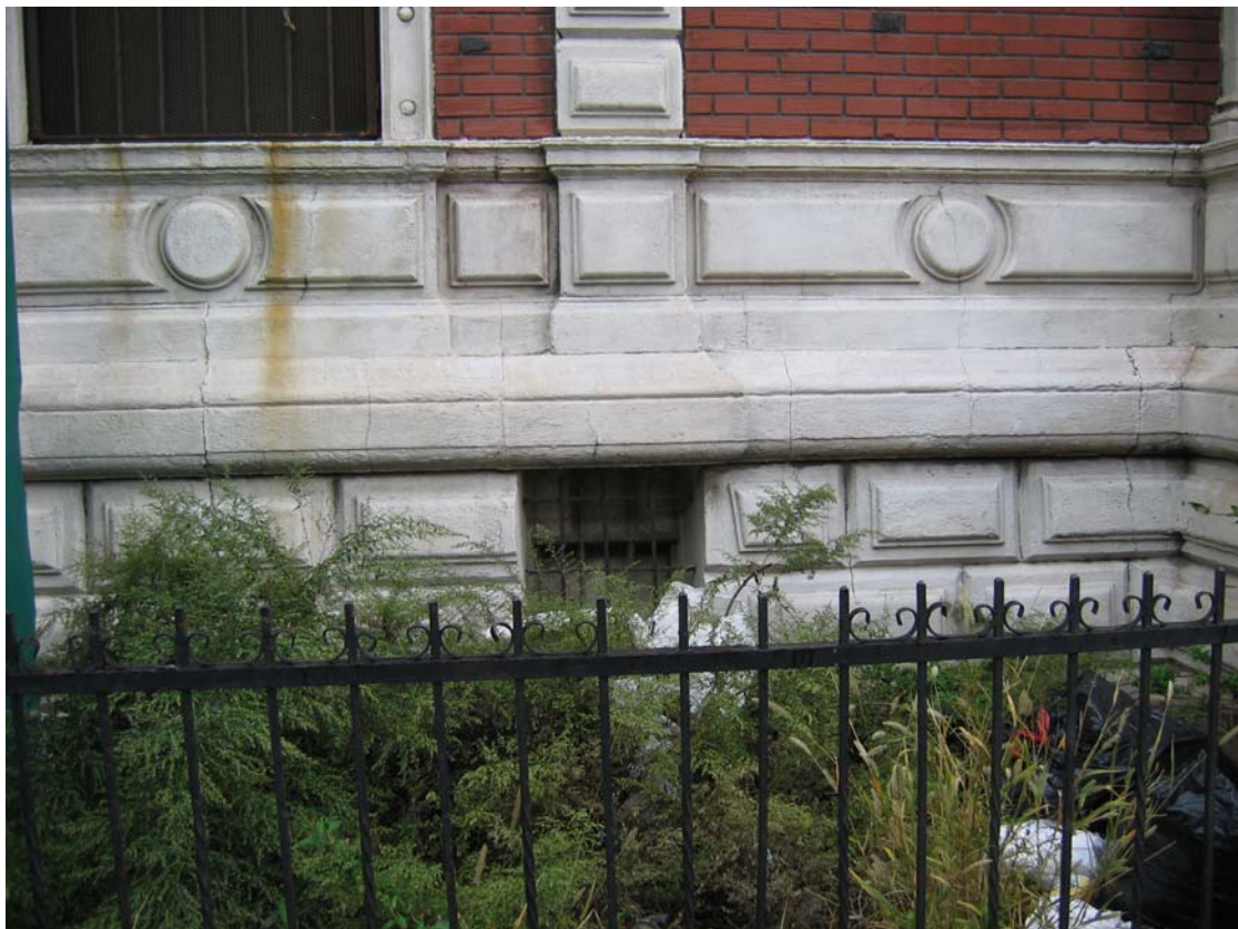
New York and Long Island Coignet Stone Company Building