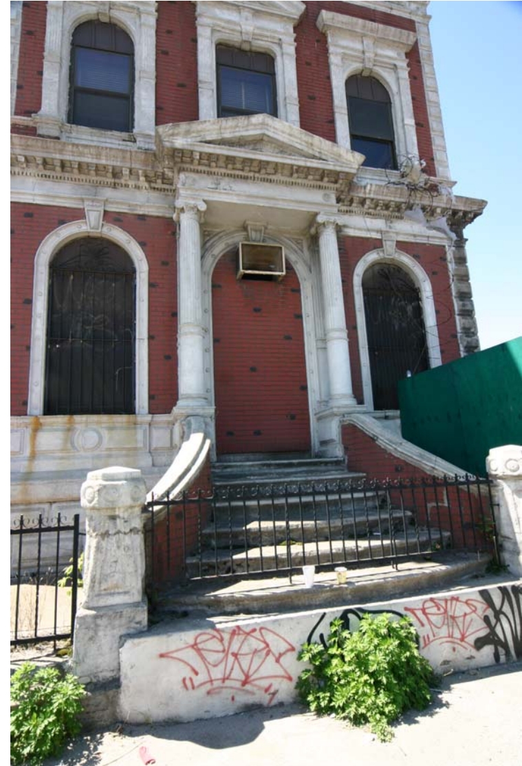
New York and Long Island Coignet Stone Company Building Third Avenue stairs and Third Street stairs