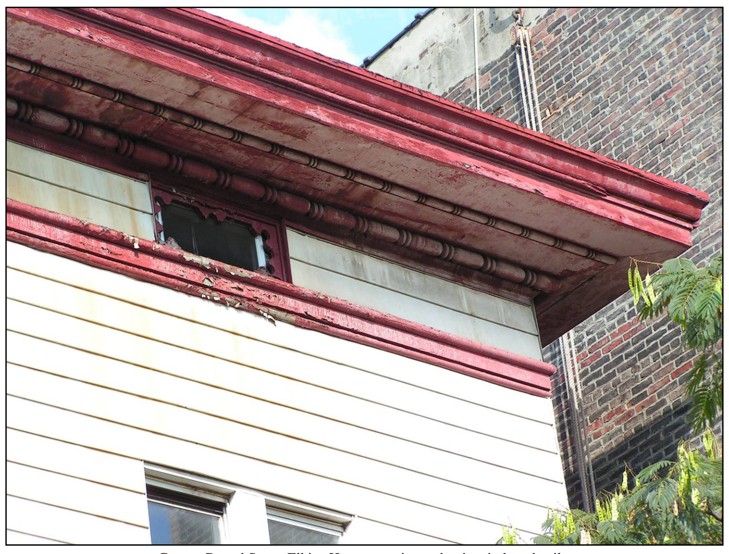
George B. and Susan Elkins House, cornice and attic window details.