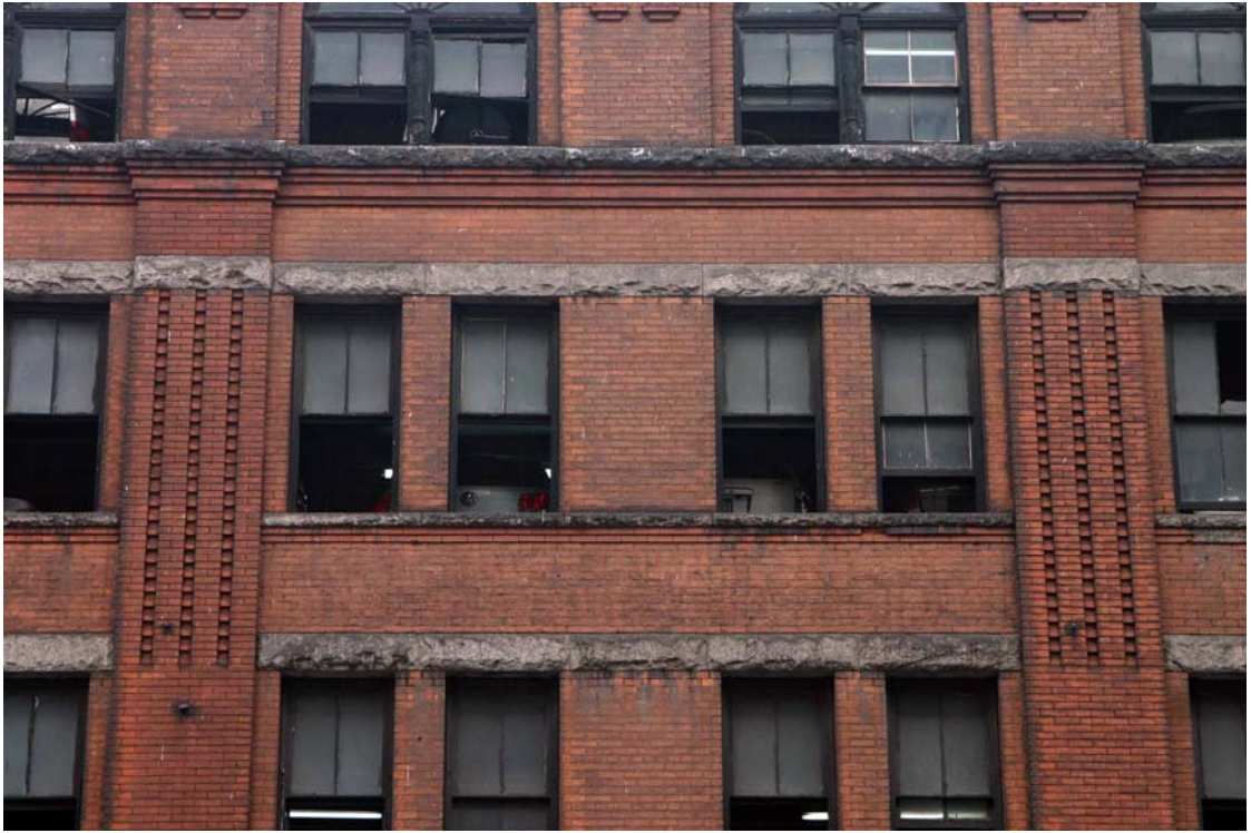
New-York Cab Company Stable Views of windows on West 75th Street