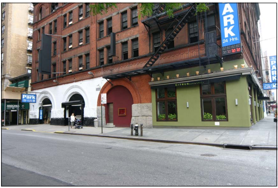
New-York Cab Company Stable Views of West 75th Street elevation