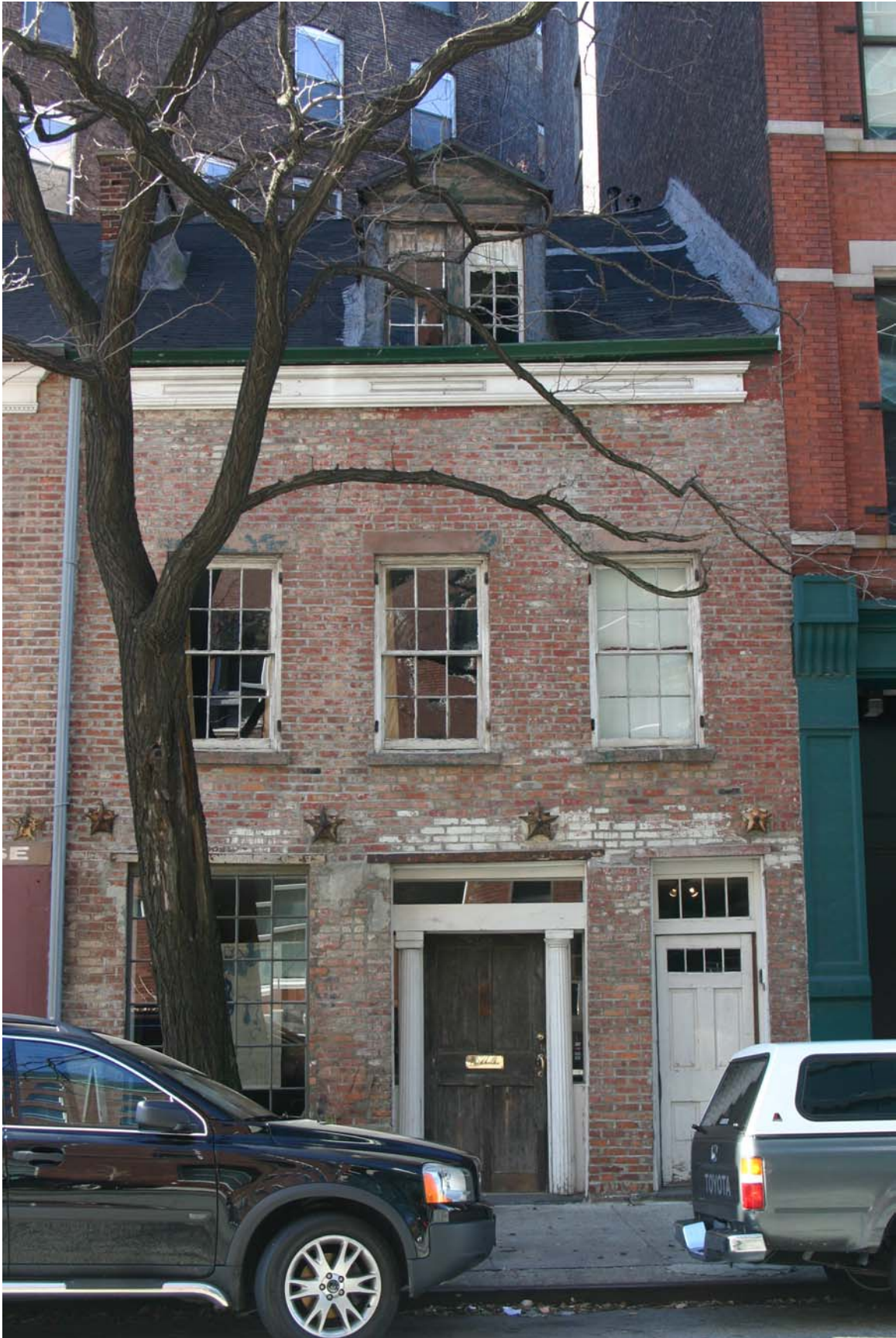
488 Greenwich Street House, Manhattan