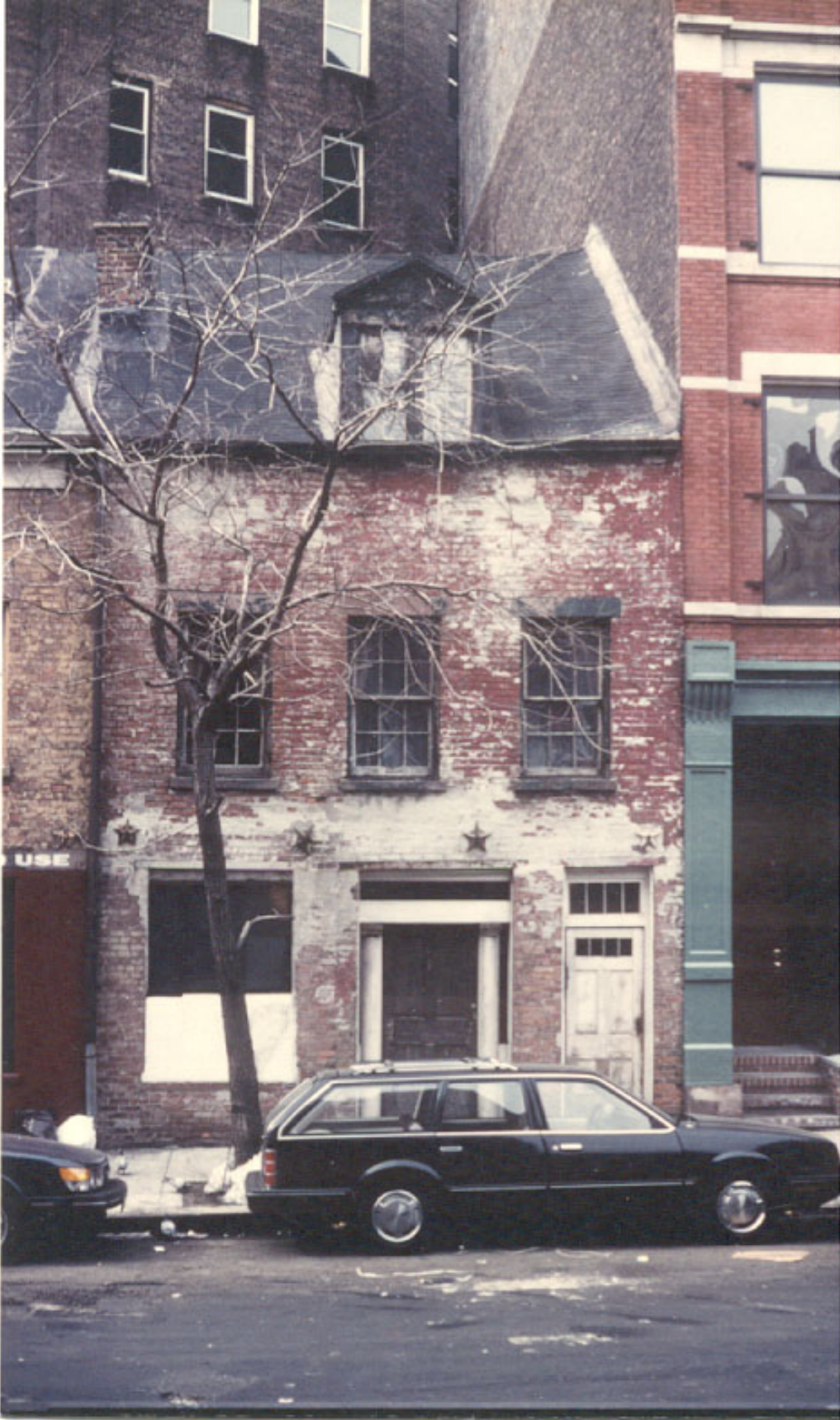
488 Greenwich Street House, Manhattan