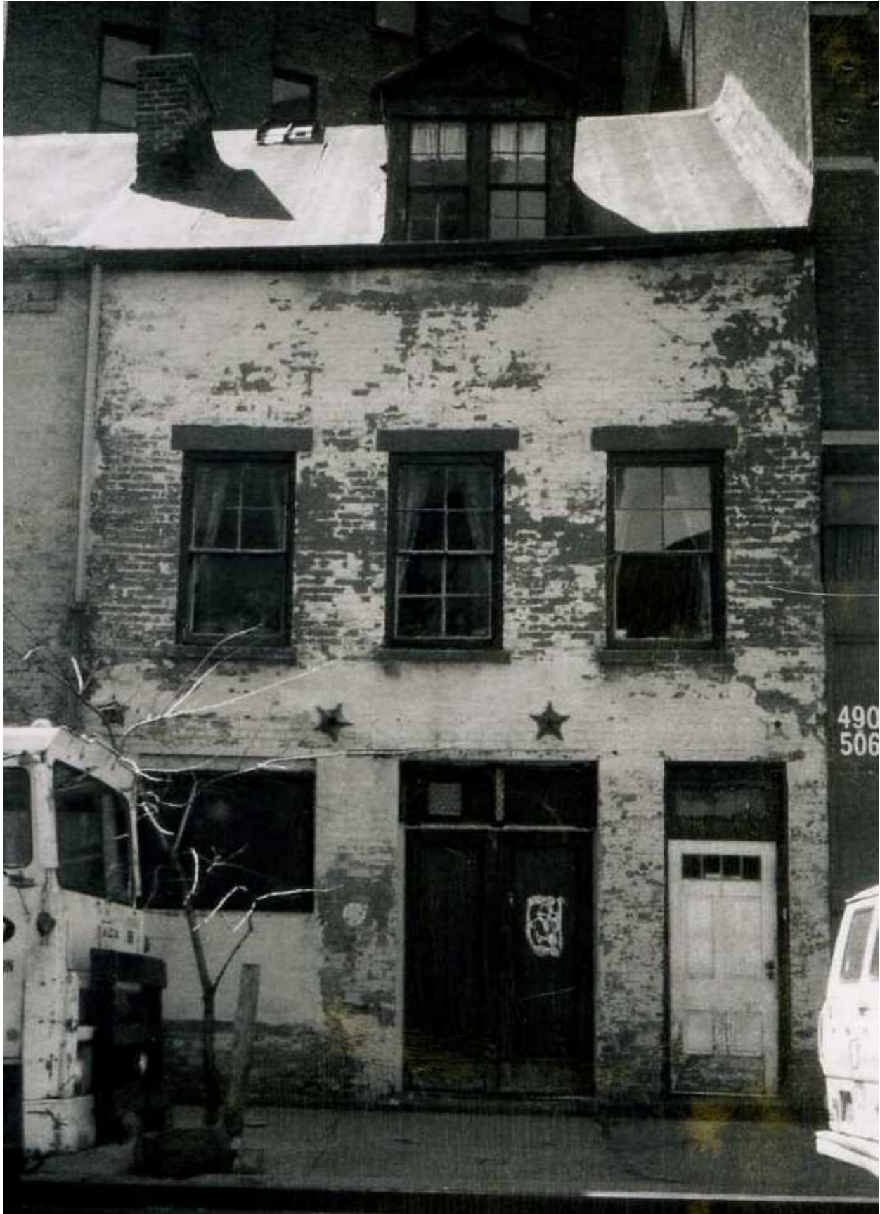
488 Greenwich Street House, Manhattan Photo: LPC (1978)