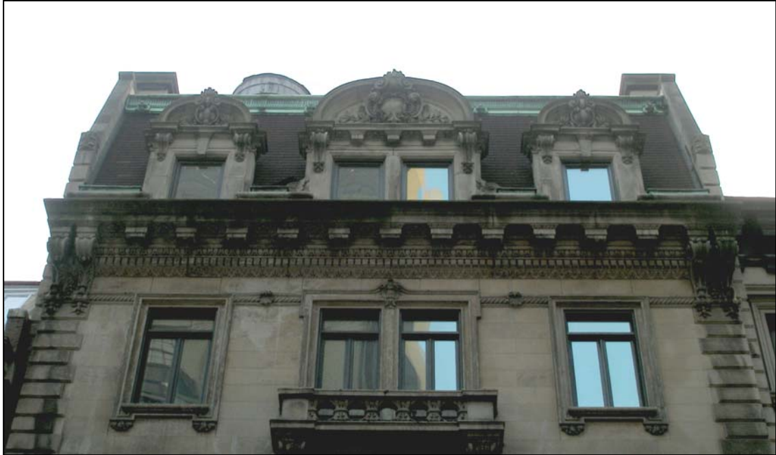
Henry Seligman Residence Fourth floor and roof