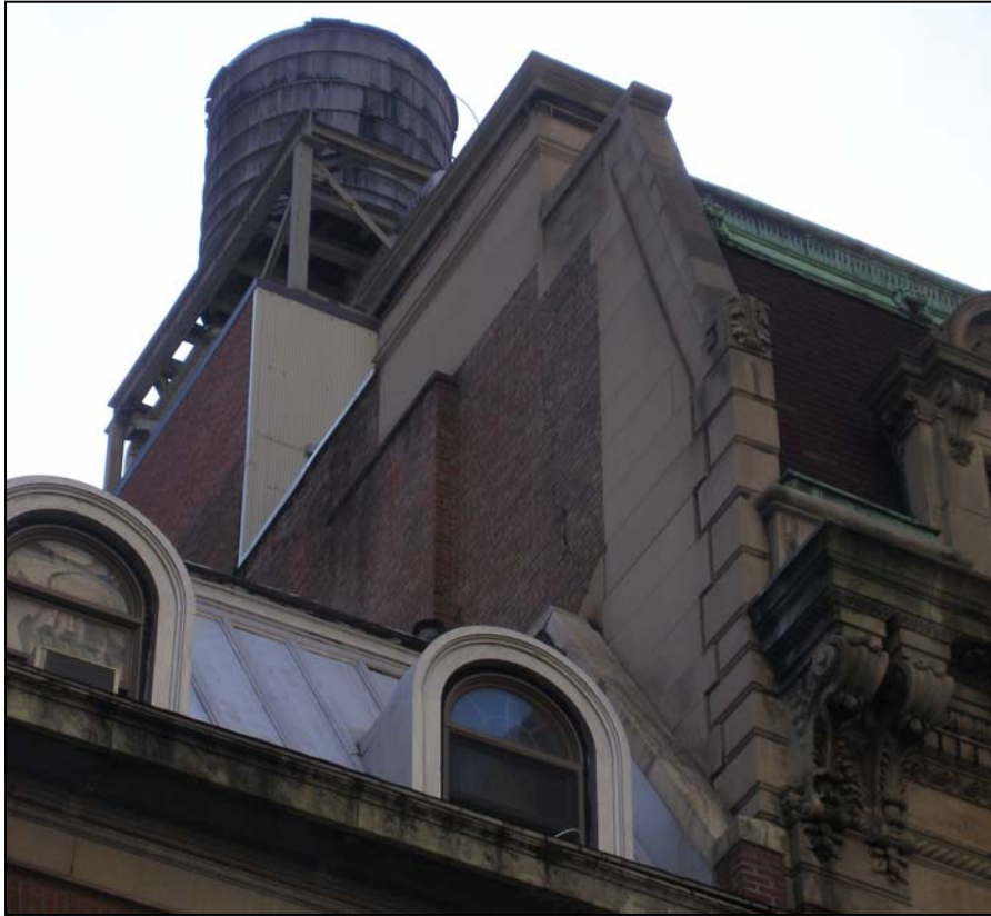
Henry Seligman Residence Exposed east façade party wall