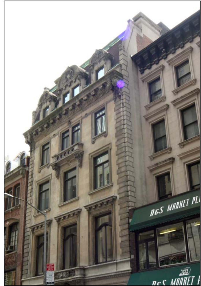
Henry Seligman Residence Main (north) façade and exposed west façade party wall