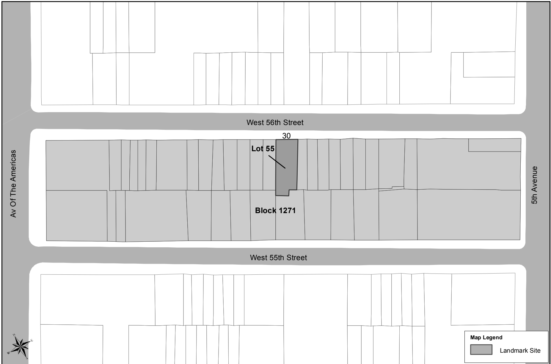
HENRY SELIGMAN RESIDENCE (LP-2227), 30 West 56th Street (aka 30-32 West 56th Street). Landmark Site: Borough of Manhattan Tax Map Block 1271, Lot 55.