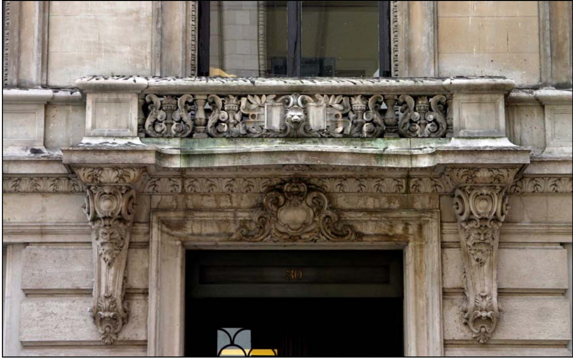
Henry Seligman Residence Second floor balcony