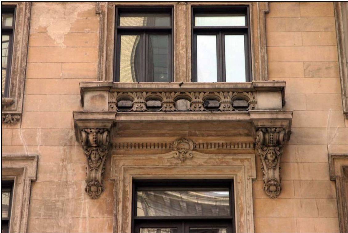
Henry Seligman Residence Fourth floor balcony