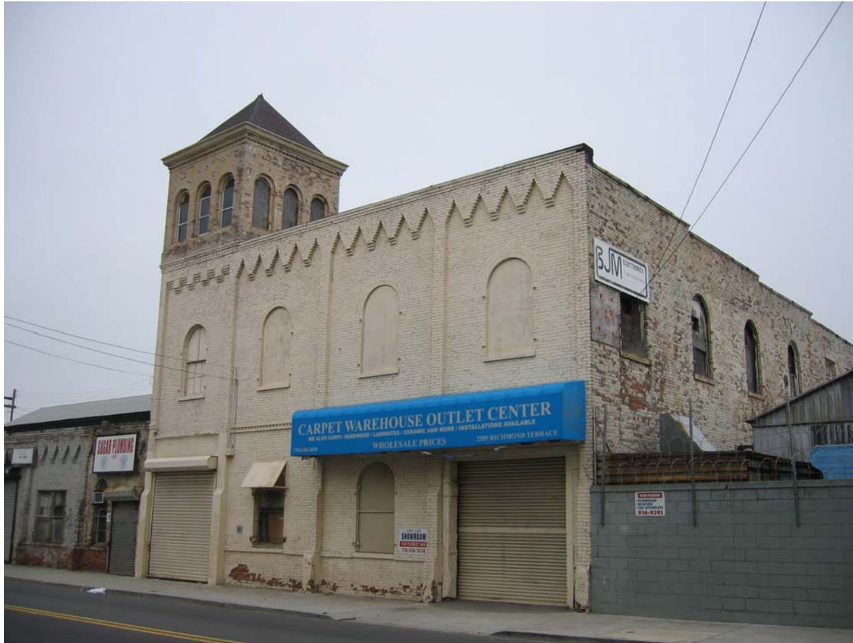
Standard Varnish Works Factory Office Building 2589 Richmond Terrace, Staten Island