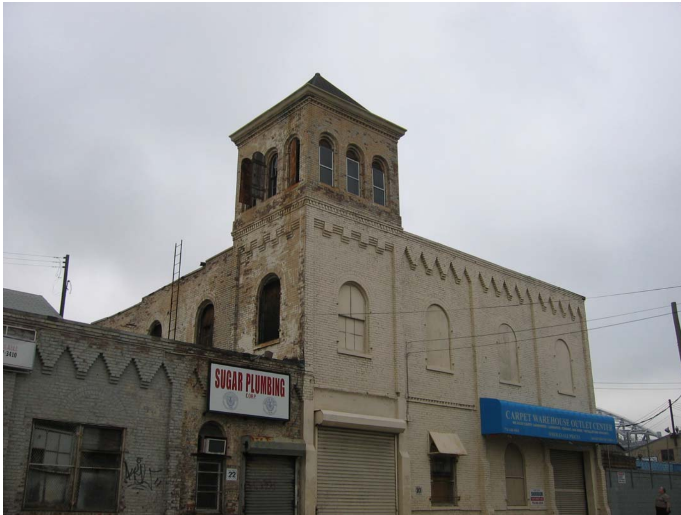
Standard Varnish Works Factory Office Building View from the southwest