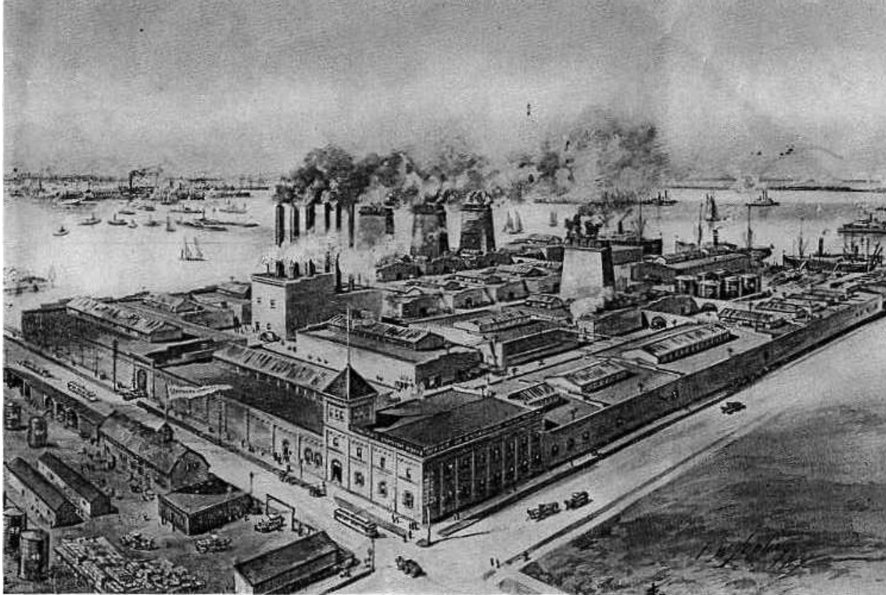
Standard Varnish Works Factory, c. 1914