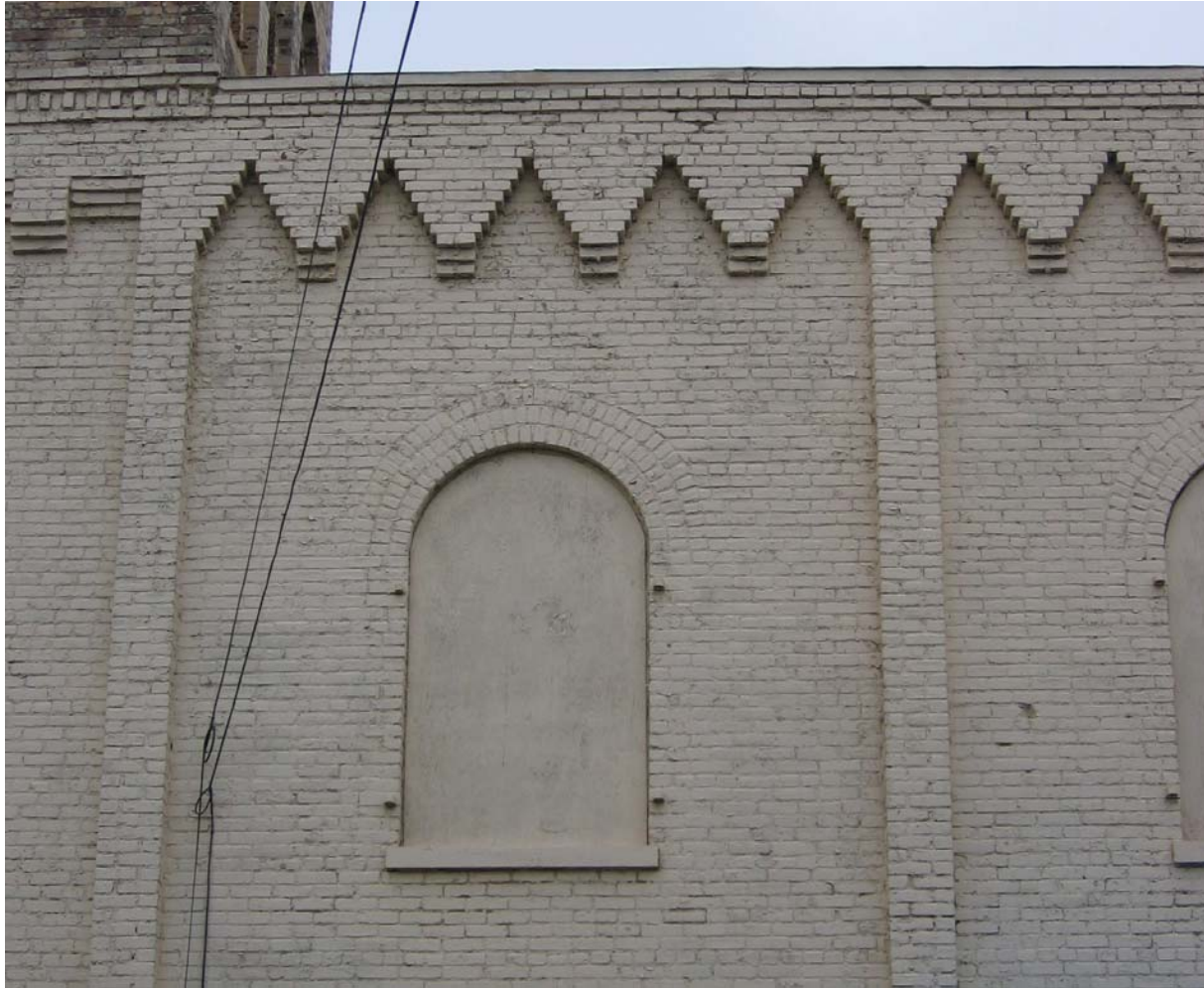
Standard Varnish Works Factory Office Building Detail of second story