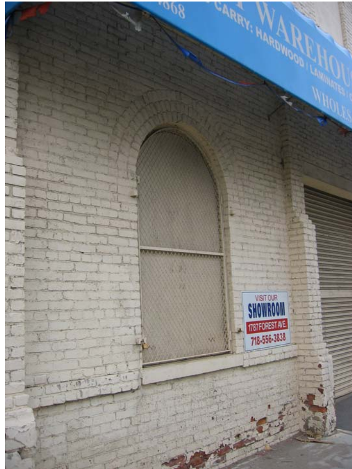
Standard Varnish Works Factory Office Building Detail of first story