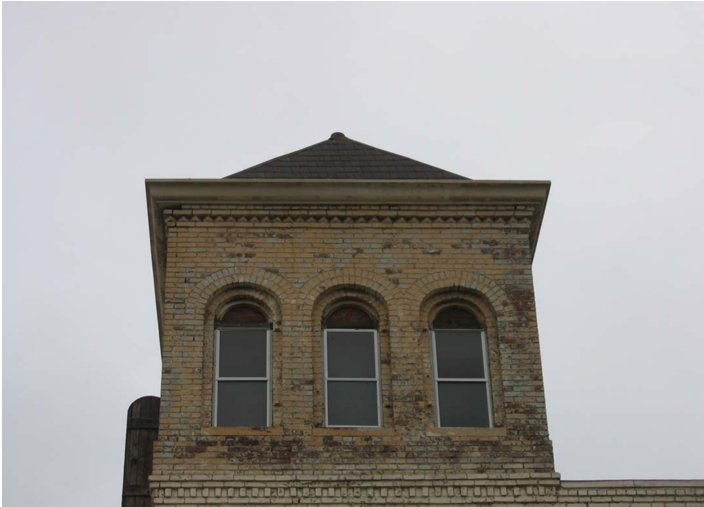
Standard Varnish Works Factory Office Building Tower