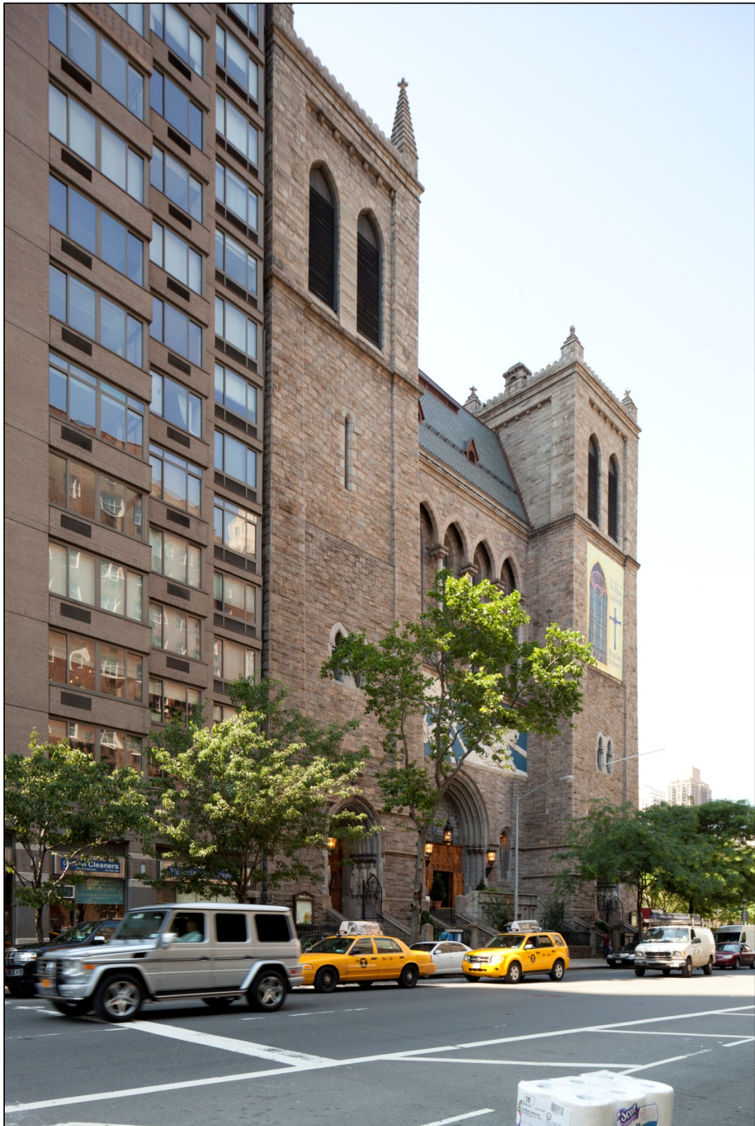
Church of St. Paul the Apostle Columbus Avenue facade