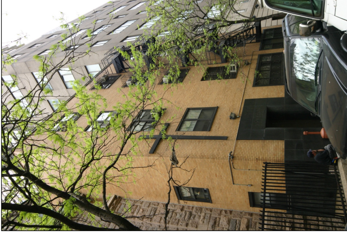
Church of St. Paul the Apostle Left: south facade, from West 59 th Street Right: 120 West 60 th Street (not part of the designation, see addendum)