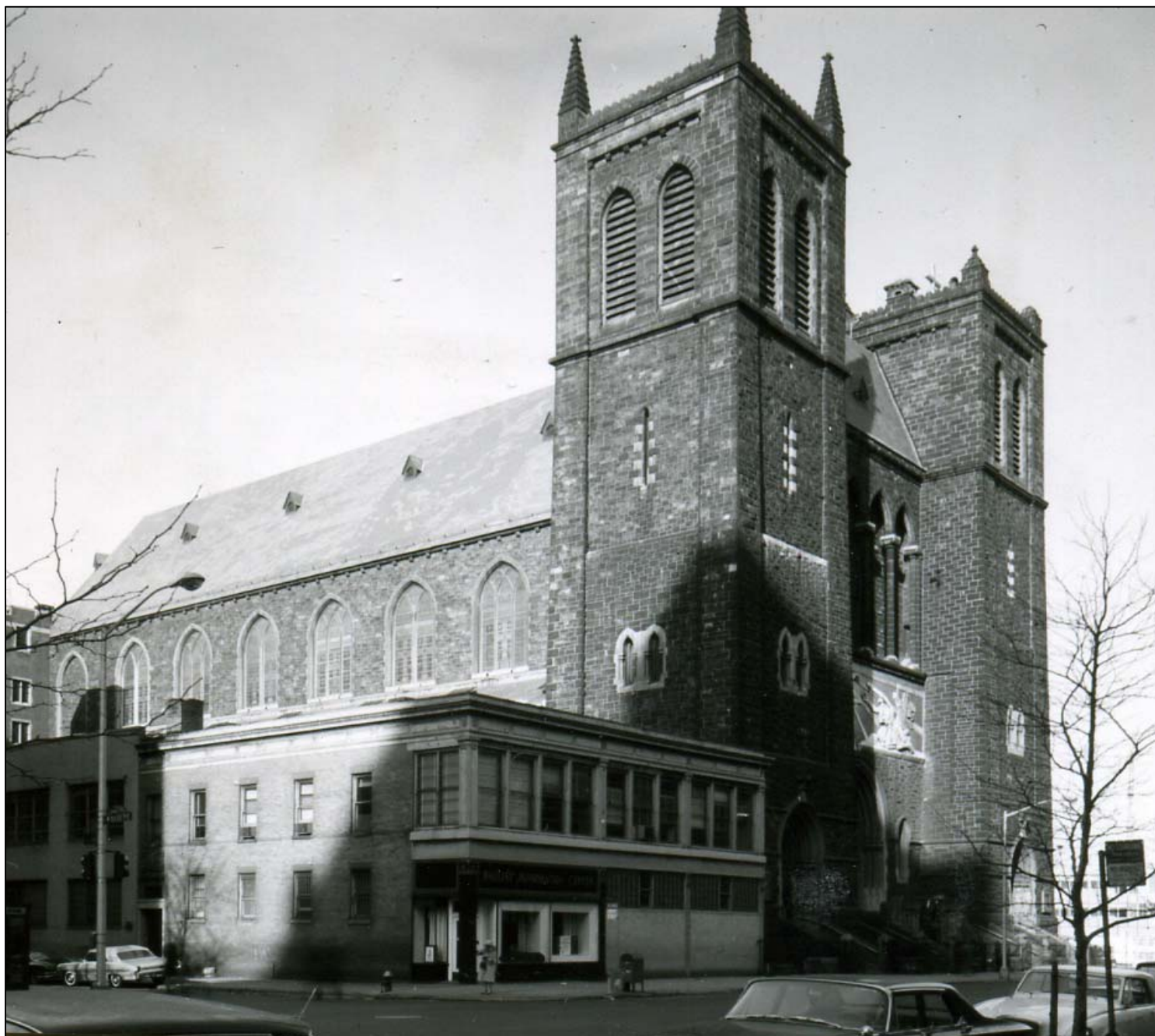
Church of St. Paul the Apostle View from Columbus Avenue and 59 th Street Photo: Landmarks Preservation Commission, c. 1966