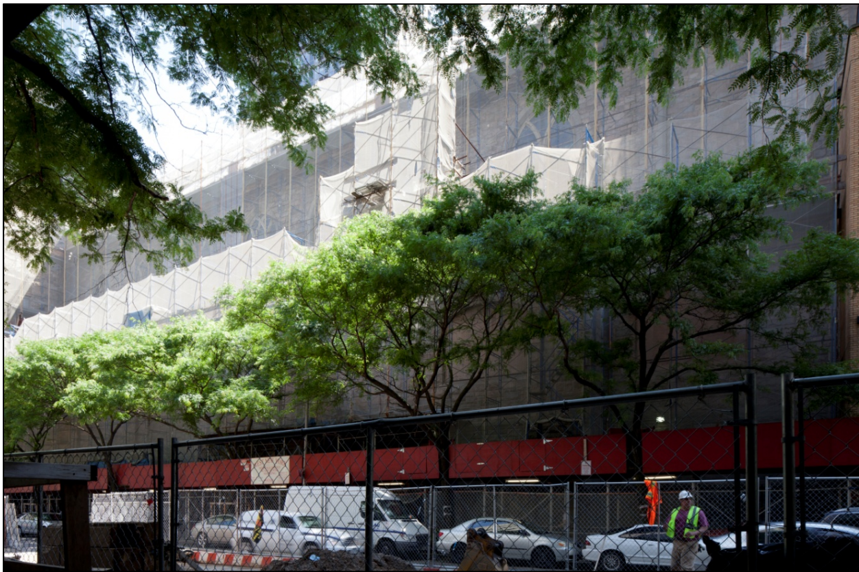
Church of St. Paul the Apostle Views of West 60 th Street Upper: Carl Forster, 2007; Lower: Christopher D. Brazeel, 2013