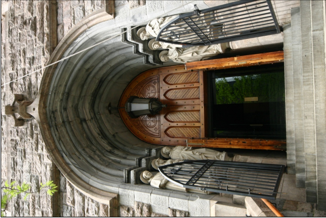
Church of St. Paul the Apostle Columbus Avenue facade Left: south entrance Right: north entrance Photos: Carl Forster, 2007