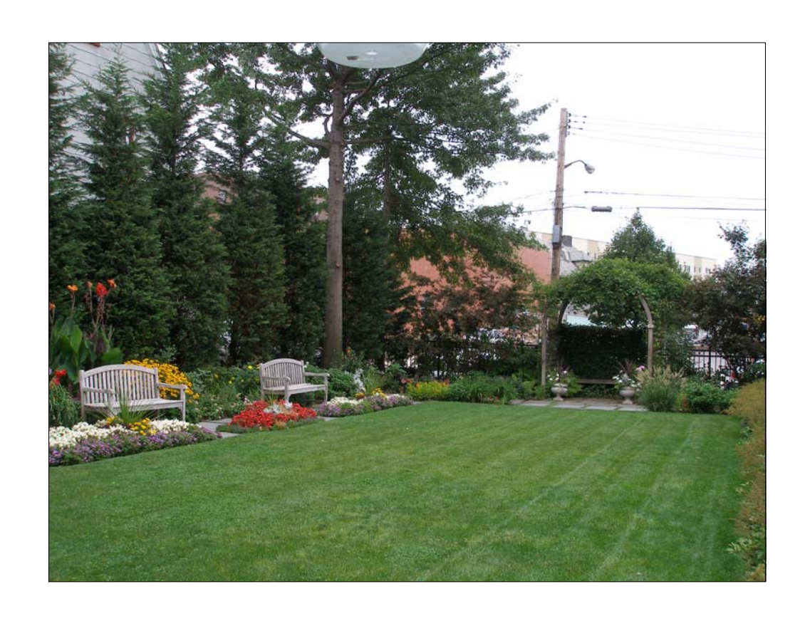
Voelker Orth Gardens