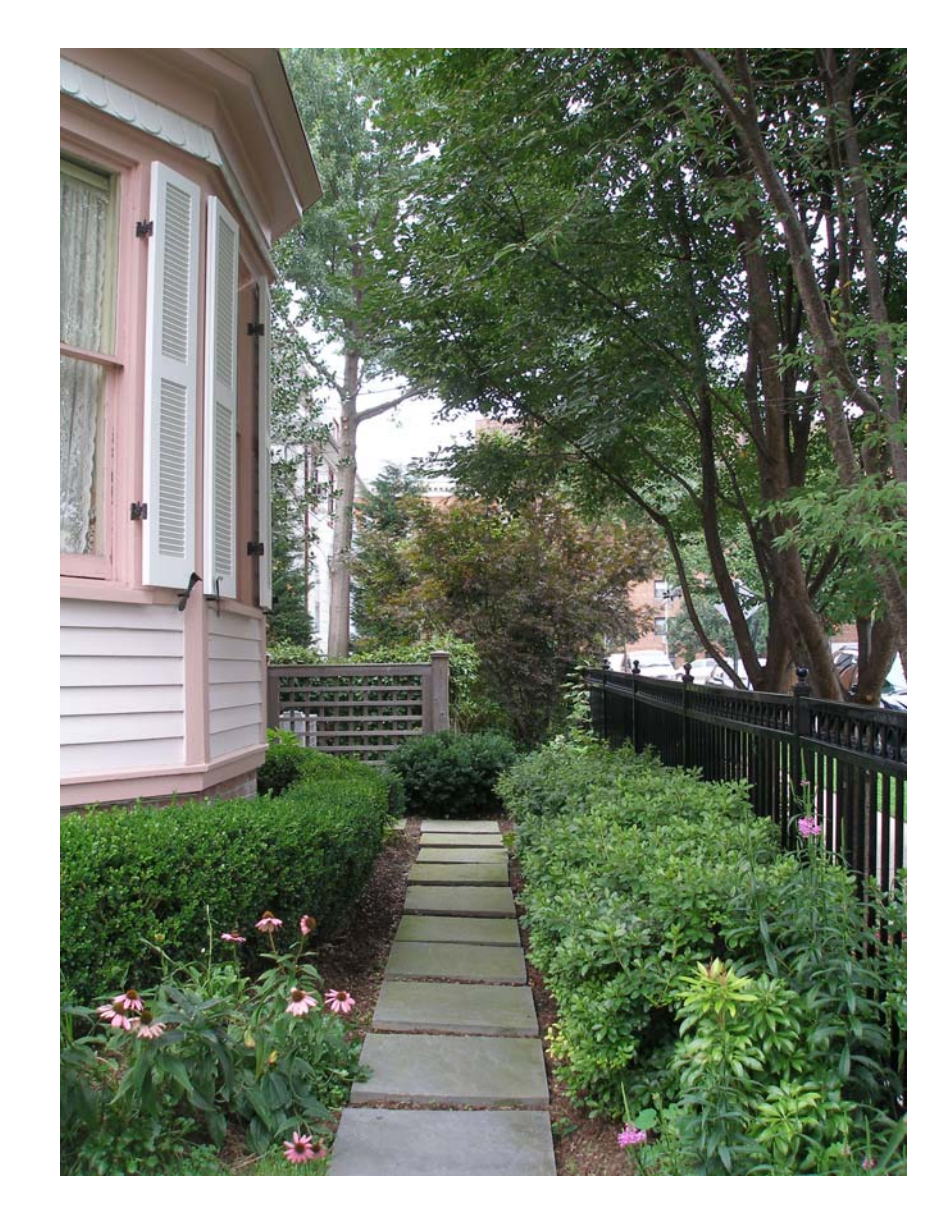
Voelker Orth Museum, Bird Sanctuary and Victorian Garden Details