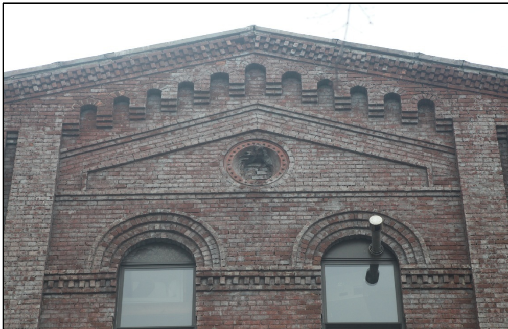
William Ulmer Brewery Stable and Storage Building, Cornice Detail Photo: Christopher D. Brazee, 2009

Photo: New York City Department of Taxes Photograph, c. 1939 Source: NYC, Department of Records and Information Service, Municipal Archives