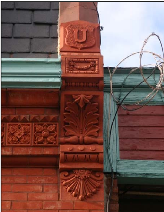
William Ulmer Brewery Office Building, Terra-Cotta Details