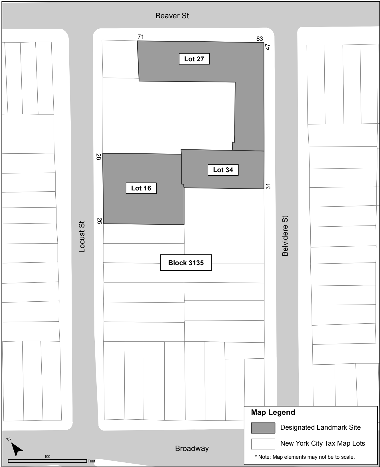
WILLIAM ULMER BREWERY (LP-2280), Office, 31 Belvidere Street, Main Brew House and Addition, 71-83 Beaver Street (aka 45-47 Belvidere Street), Engine and Machine House, 35-43 Belvidere Street, Stable and Storage Building, 26-28 Locust Street. Borough of Brooklyn, Tax Map Block 3135, Lots 34, 27 & 16.