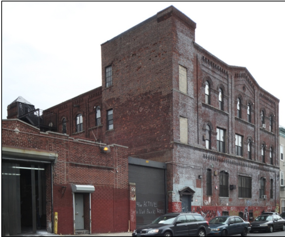
William Ulmer Brewery Stable and Storage Building, Northeast and Northwest Facades