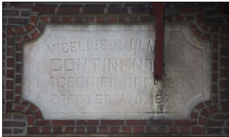
William Ulmer Brewery Main Brew House, Date Stone Detail