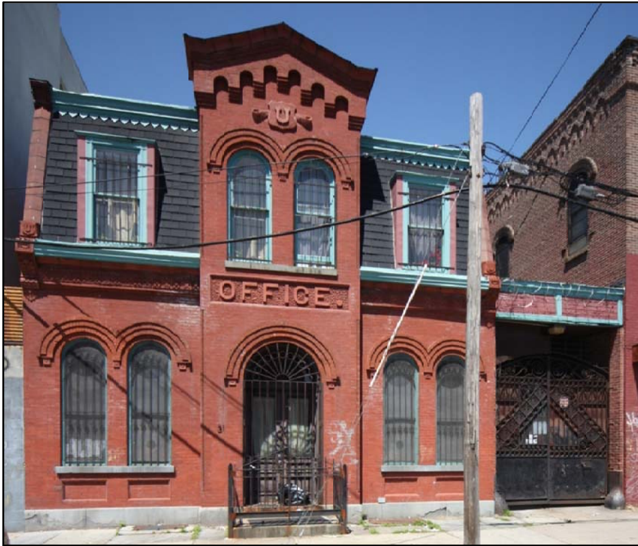
William Ulmer Brewery Office Building