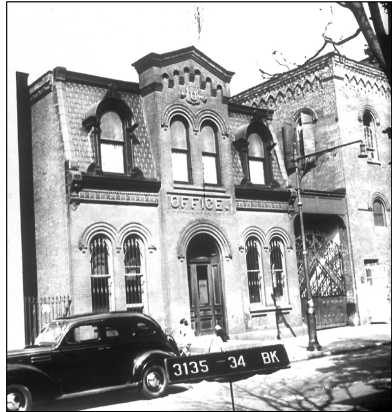
William Ulmer Brewery Office Building Photo: New York City Department of Taxes Photograph, c. 1939 Source: NYC, Department of Records and Information Service, Municipal Archives