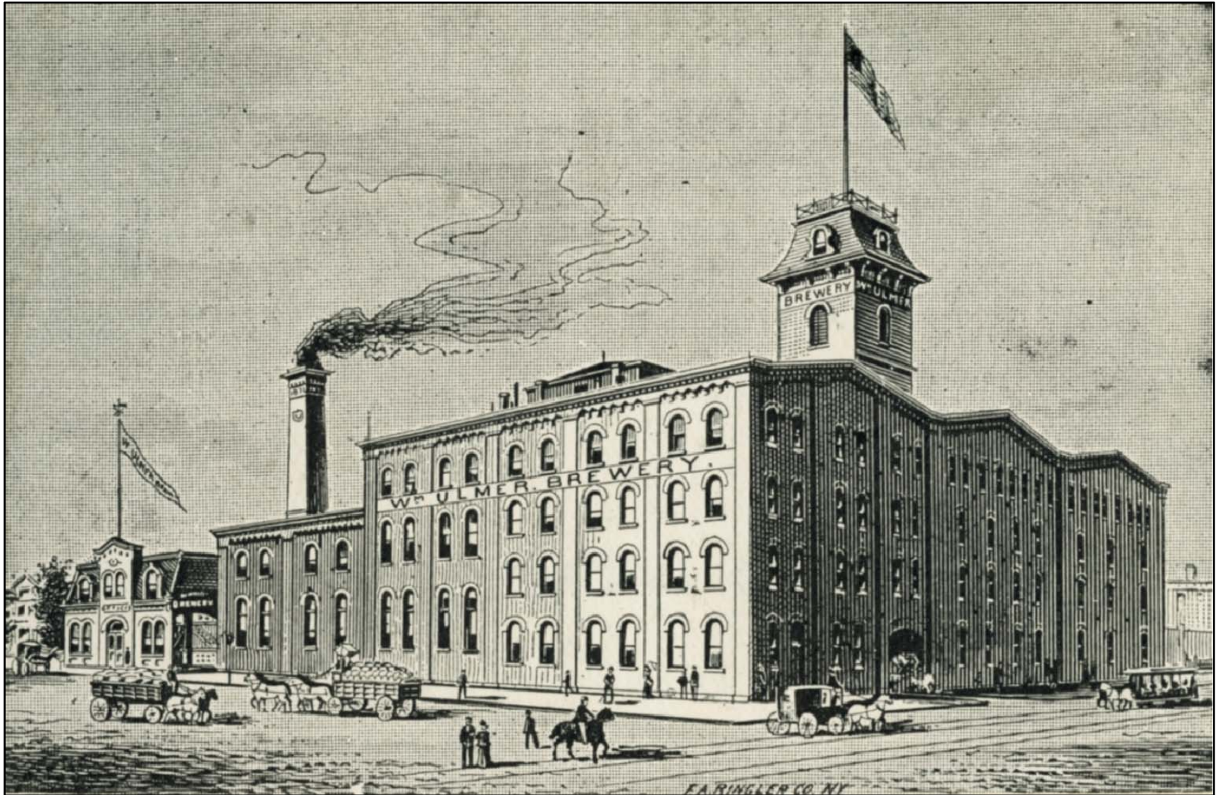
William Ulmer Brewery