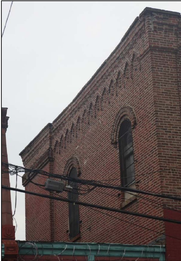
William Ulmer Brewery Engine and Machine House, Southwest Facade