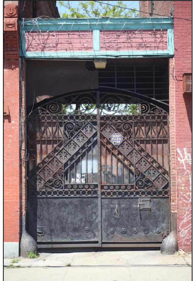
William Ulmer Brewery Office Building, Gate