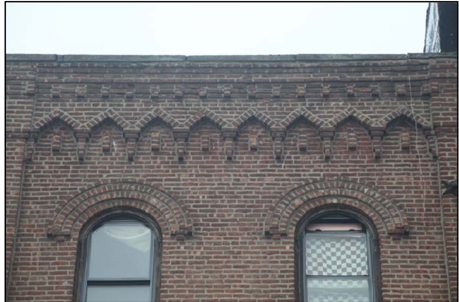
William Ulmer Brewery Engine and Machine House, Cornice Detail