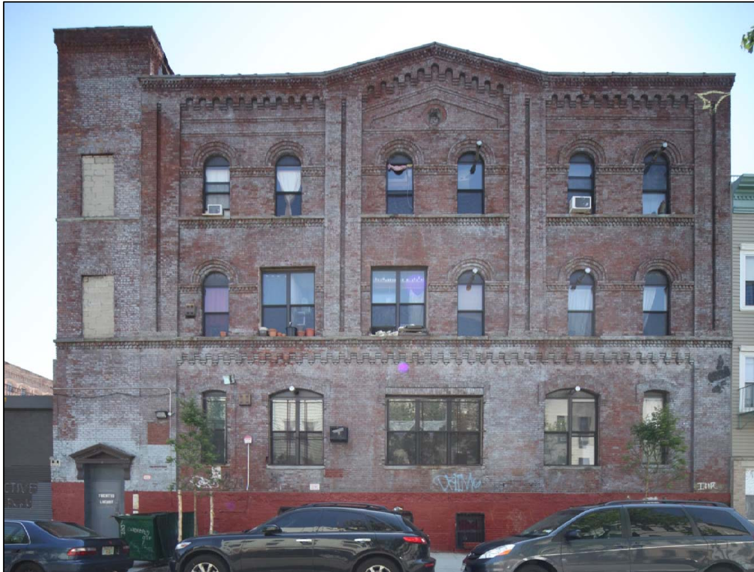
William Ulmer Brewery Stable and Storage Building, Northwest Facade Photo: Christopher D. Braze, 2010