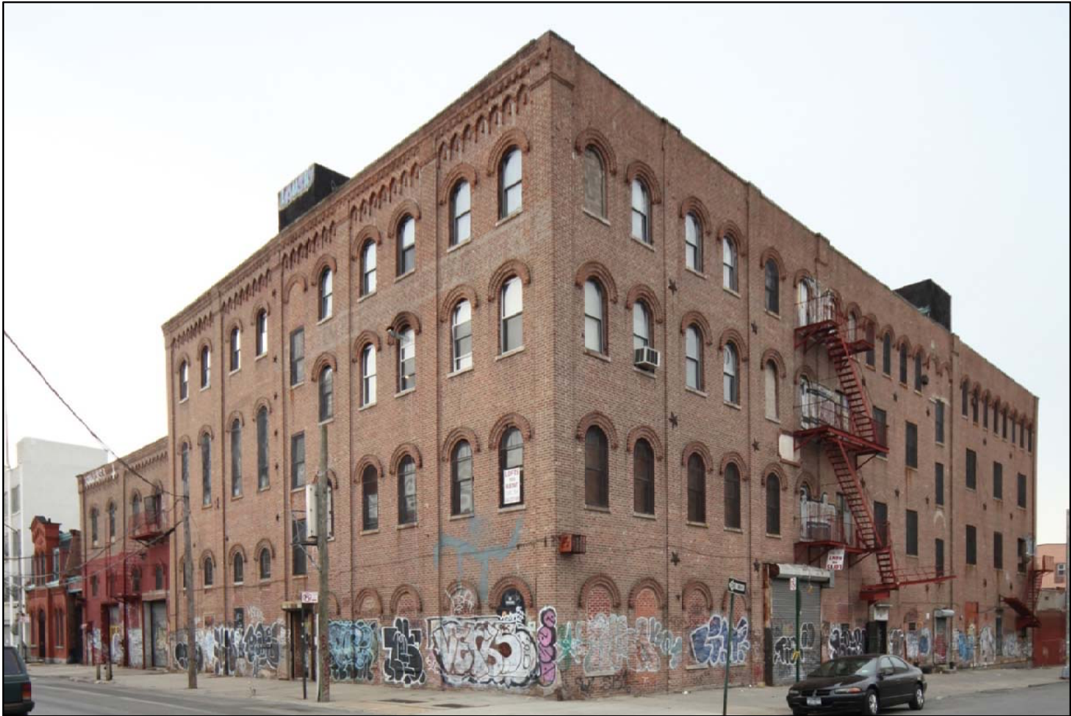
William Ulmer Brewery Office , 31 Belvidere Street, Main Brew House and Addition , 71-83 Beaver Street (aka 45-47 Belvidere Street), Engine and Machine House , 35-43 Belvidere Street, Stable and Storage Building , 26-28 Locust Street, Brooklyn Borough of Brooklyn Tax Map Block 3135, Lots 34, 27, 16 Photo: Christopher D. Brazee, 2009