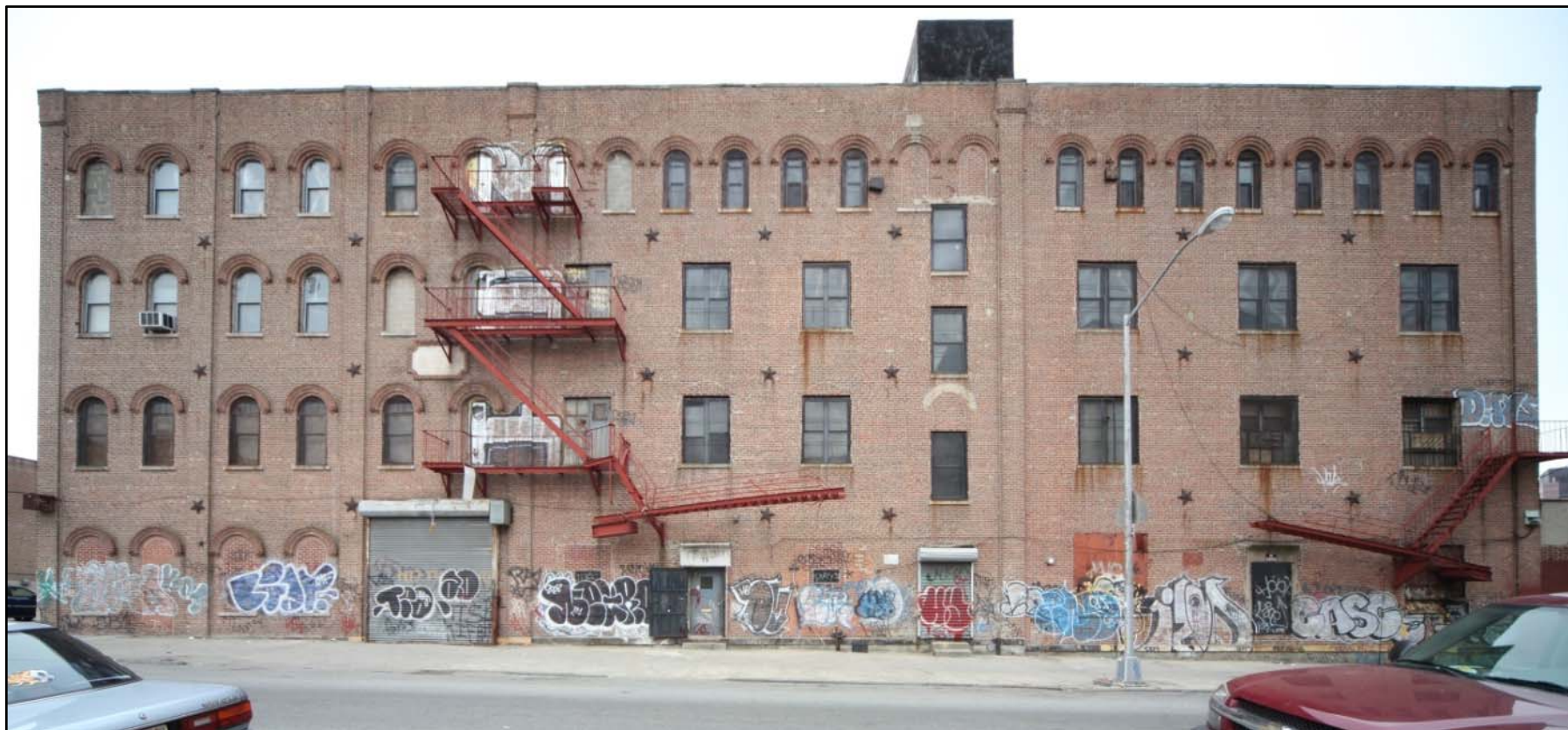
William Ulmer Brewery Main Brew House and Addition, Northeast Facade