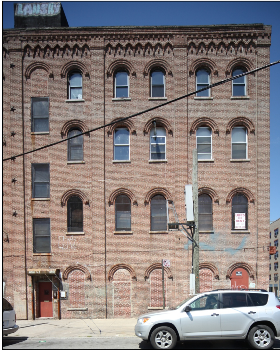
William Ulmer Brewery Main Brew House, Southeast Facade