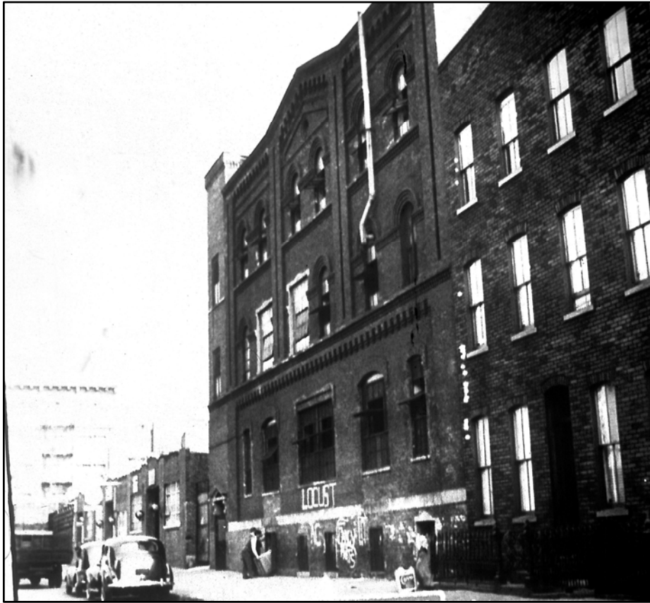
William Ulmer Brewery Stable and Storage Building

Photo: New York City Department of Taxes Photograph, c. 1939 Source: NYC, Department of Records and Information Service, Municipal Archives