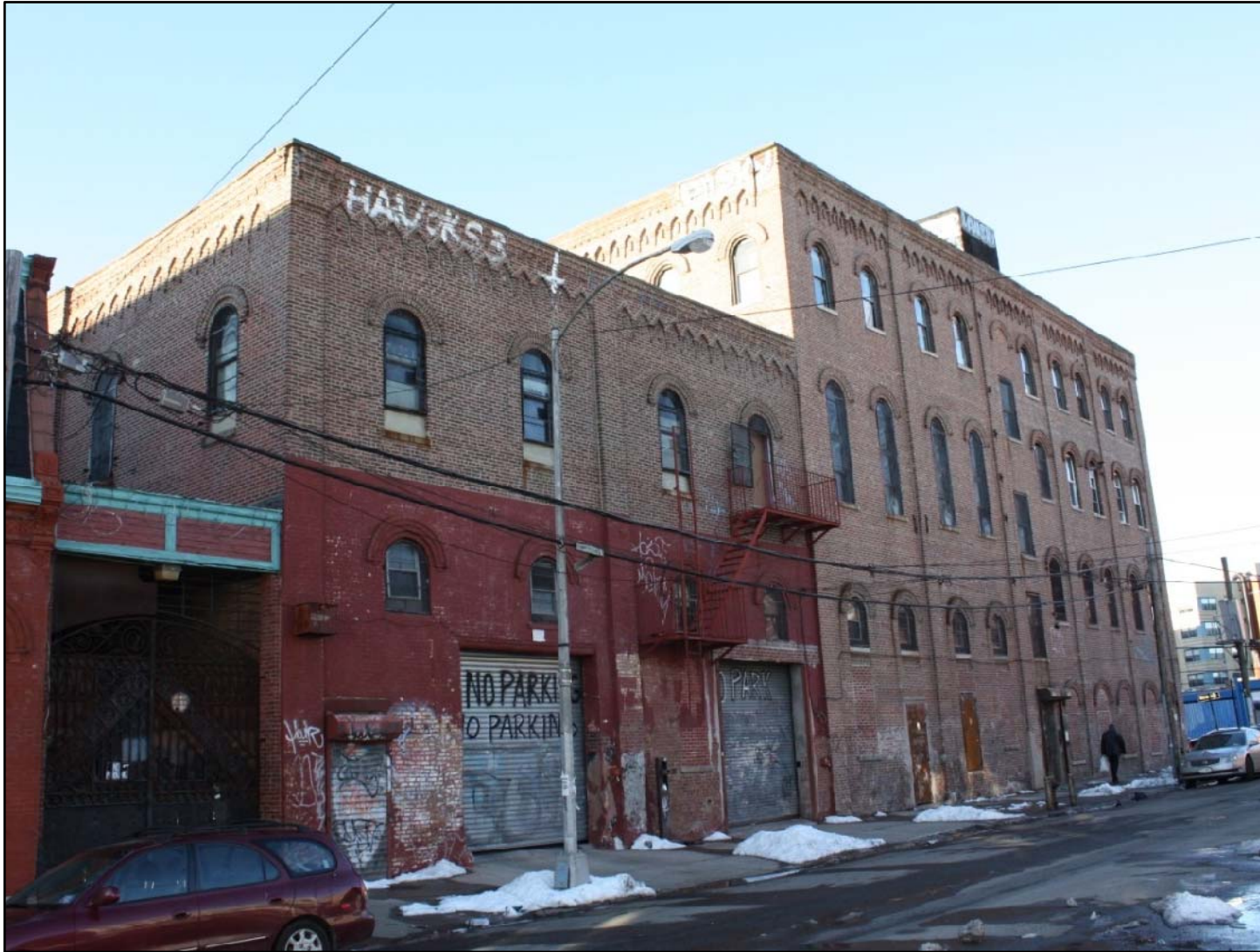
William Ulmer Brewery Engine and Machine House