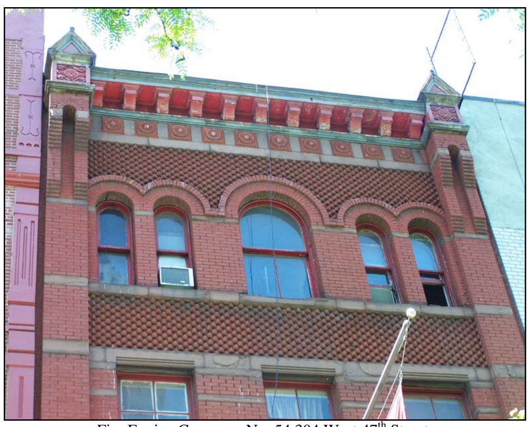
Fire Engine Company No. 54 304 West 47<sup>th</sup> Street, Detail of Roof line