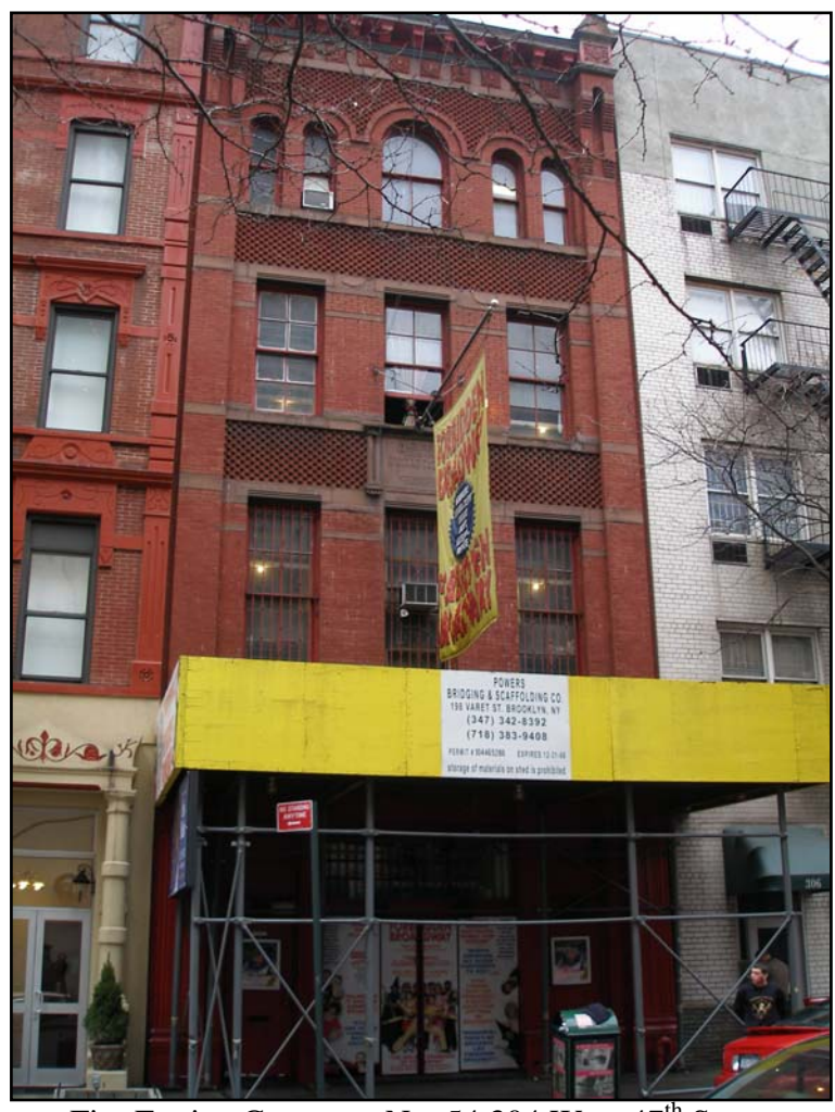
Fire Engine Company No. 54 304 West 47<sup>th</sup> Street