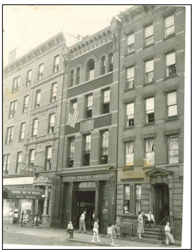
Fire Engine Company No. 54 304 West 47<sup>th</sup> Street