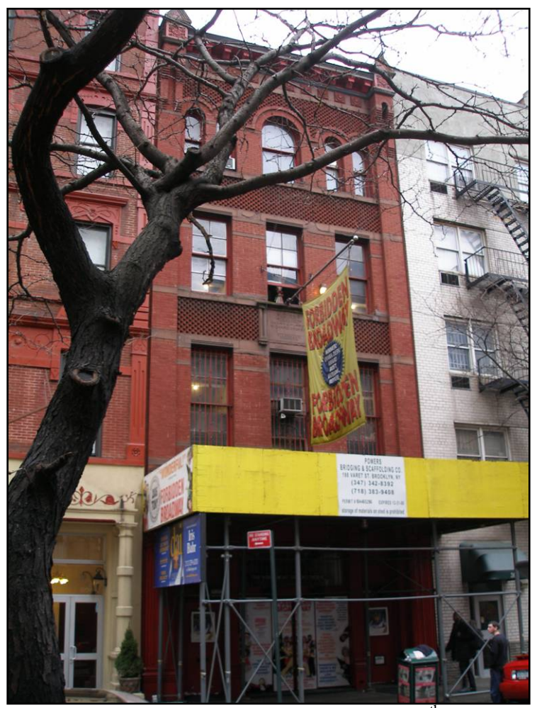
Fire Engine Company No. 54 304 West 47<sup>th</sup> Street, Photo Theresa C. Noonan