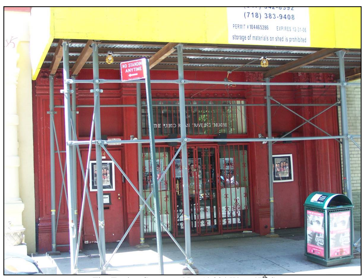
Fire Engine Company No. 54 304 West 47<sup>th</sup> Street