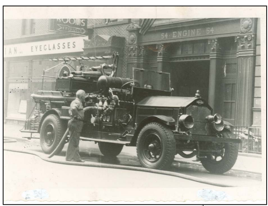
Fire Engine Company No. 54 304 West 47<sup>th</sup> Street