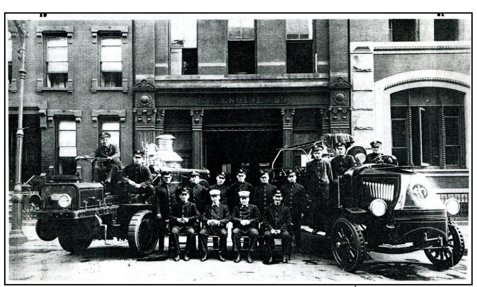
Fire Engine Company No. 54 304 West 47<sup>th</sup> Street