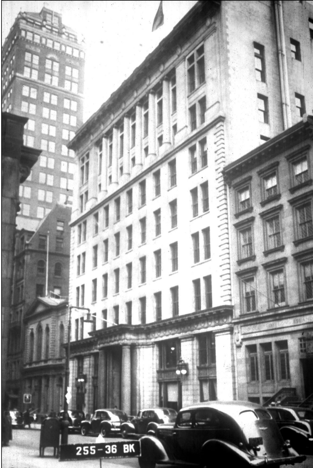
Brooklyn Union Gas Company Building