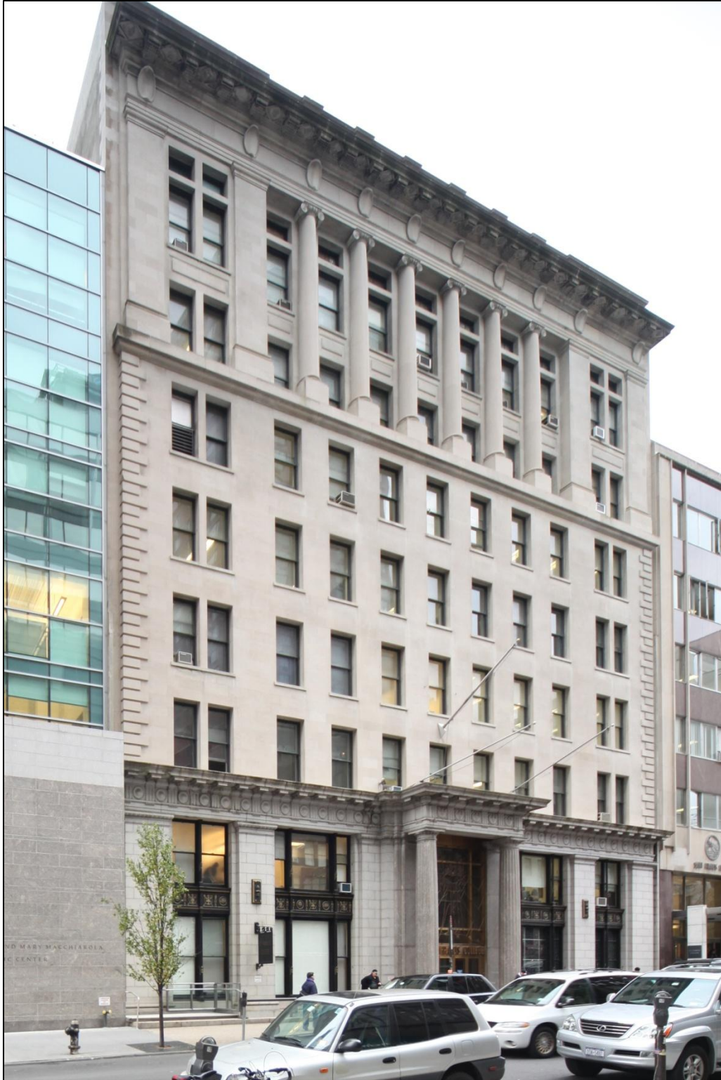
Brooklyn Union Gas Company Building 176 Remsen Street (aka 172-178 Remsen Street) Borough of Brooklyn Tax Map Block 255, Lot 36 in part Built: 1914