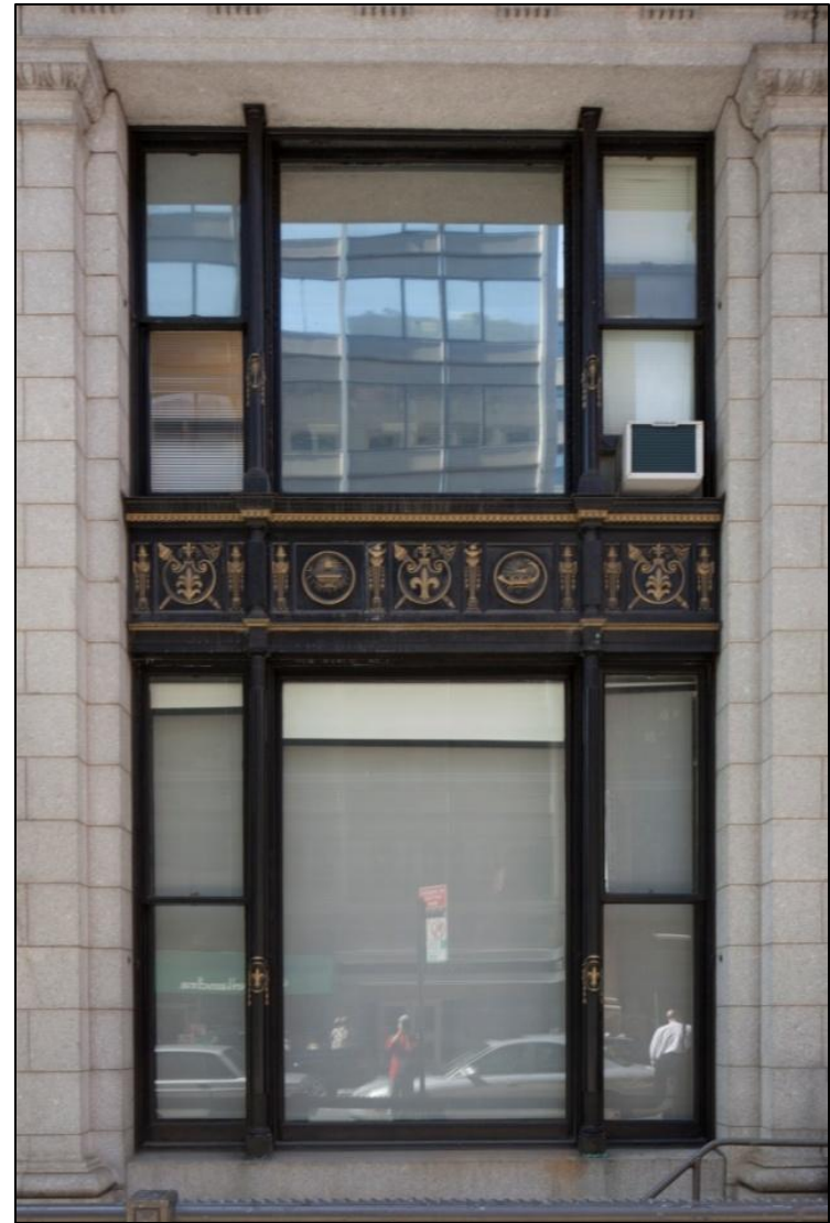
Brooklyn Union Gas Company Building Bronze window panels of main story