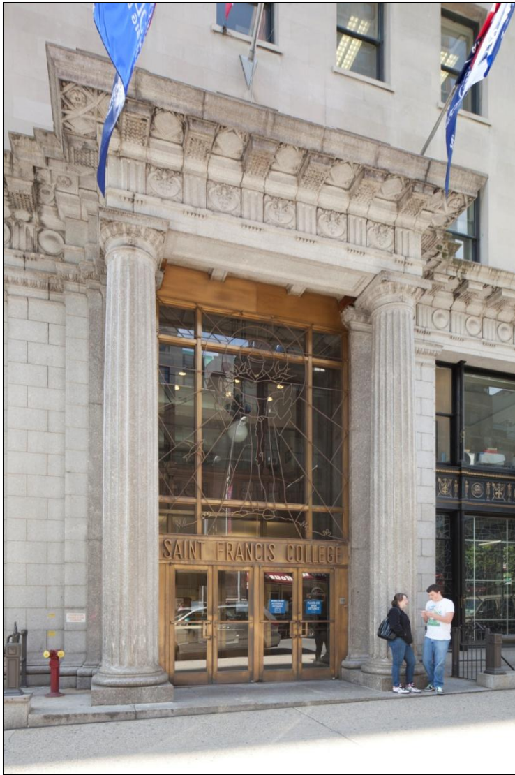
Brooklyn Union Gas Company Building Entrance portico