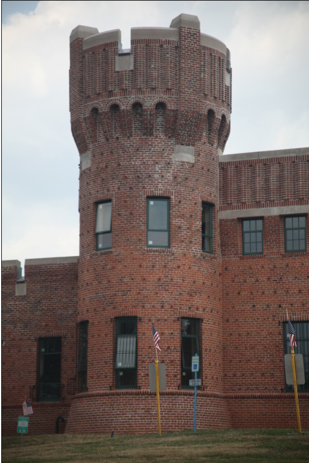
Headquarters Troop, 51st Cavalry Brigade Armory Main facade tower