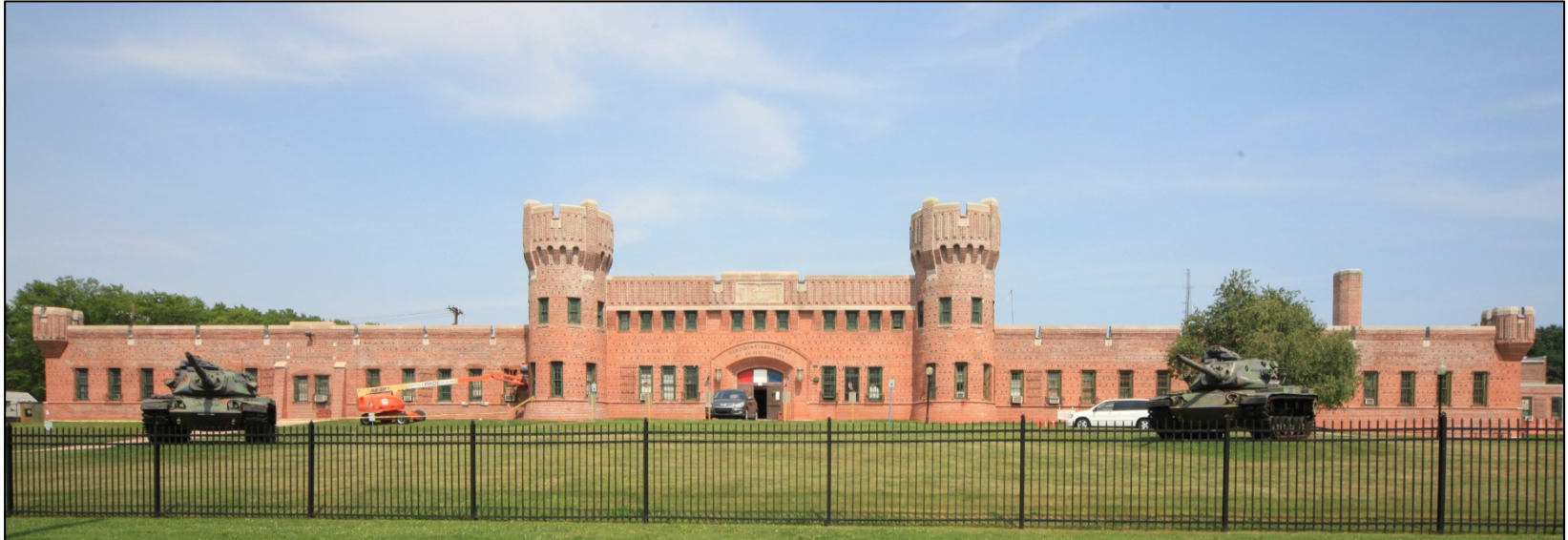
Headquarters Troop, 51st Cavalry Brigade Armory 321 Manor Road, Staten Island Main Facade