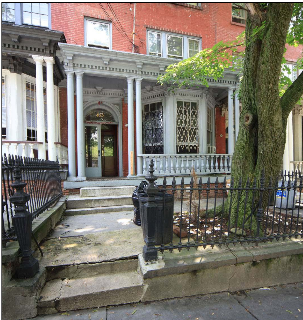
413 Westervelt Avenue