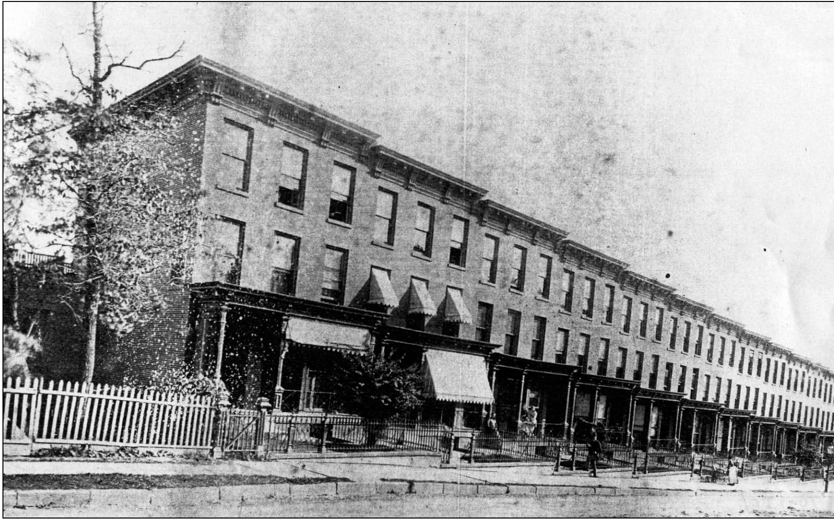
Horton's Row, Front View Photograph by Isaac Almstaedt, c. 1885 Source: Staten Island Historical Society Collection