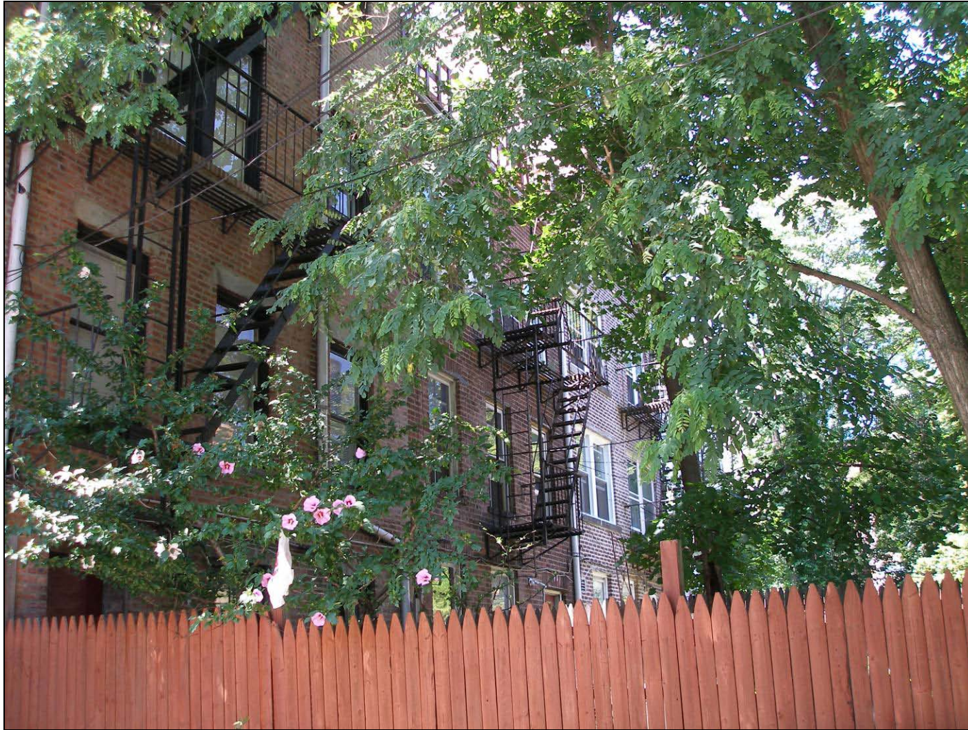
415-411 Westervelt Avenue, Rear Facades