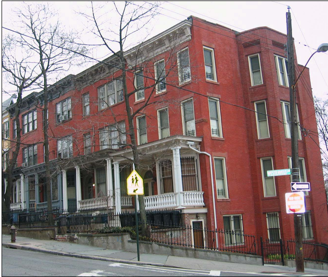
411-417 Westervelt Avenue, Horton's Row Photo: Tara Harrison, 2009