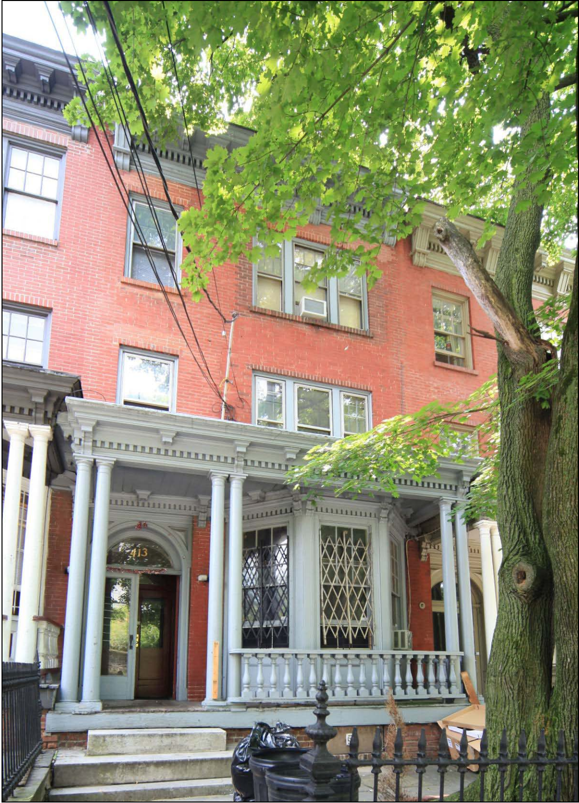
413 Westervelt Avenue Photo: Christopher D. Brazee, 2009