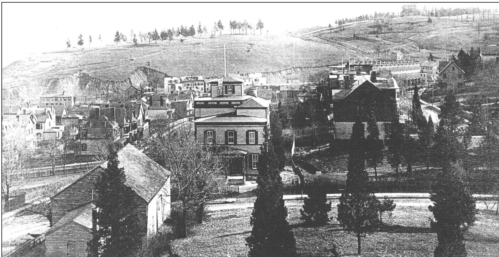
View from Brighton Heights Photograph by Isaac Almstaedt, c. 1888 Source: Staten Island Historical Society Collection