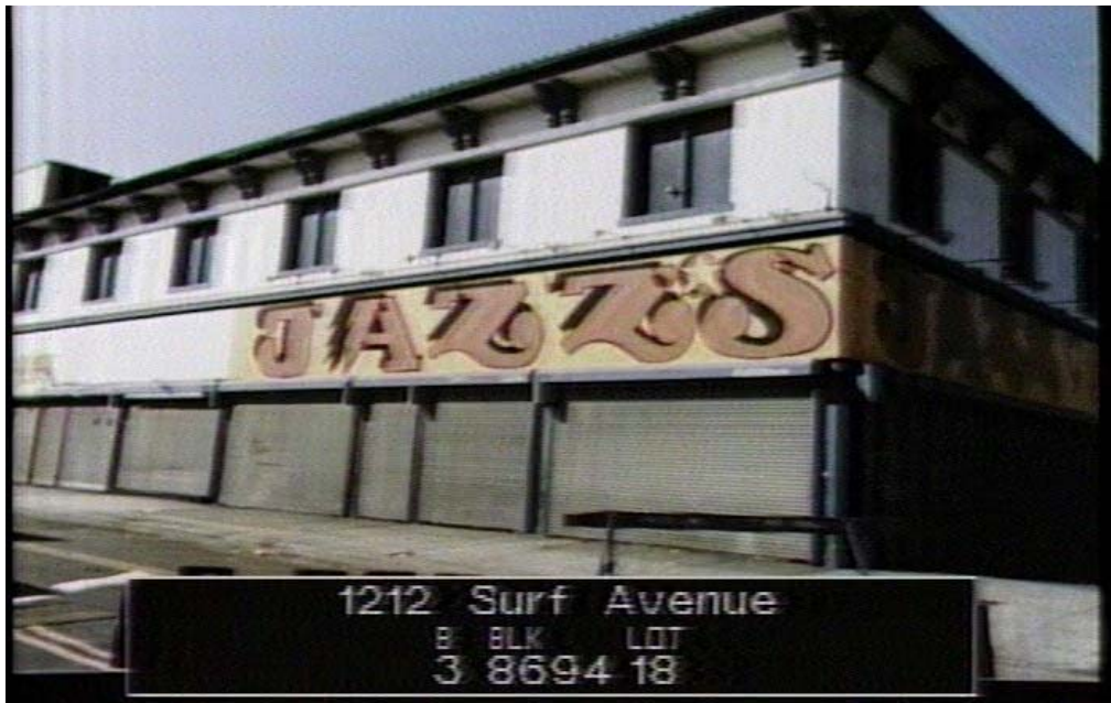
Child's Restaurant Building