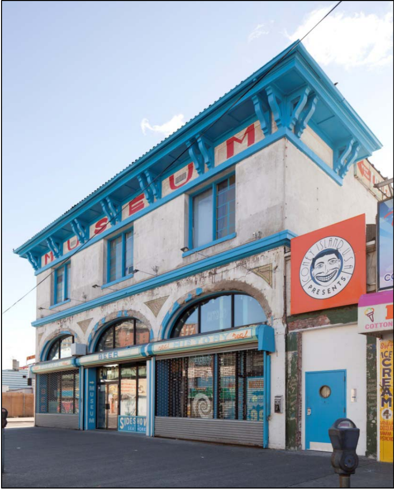
Child's Restaurant Building Facade details