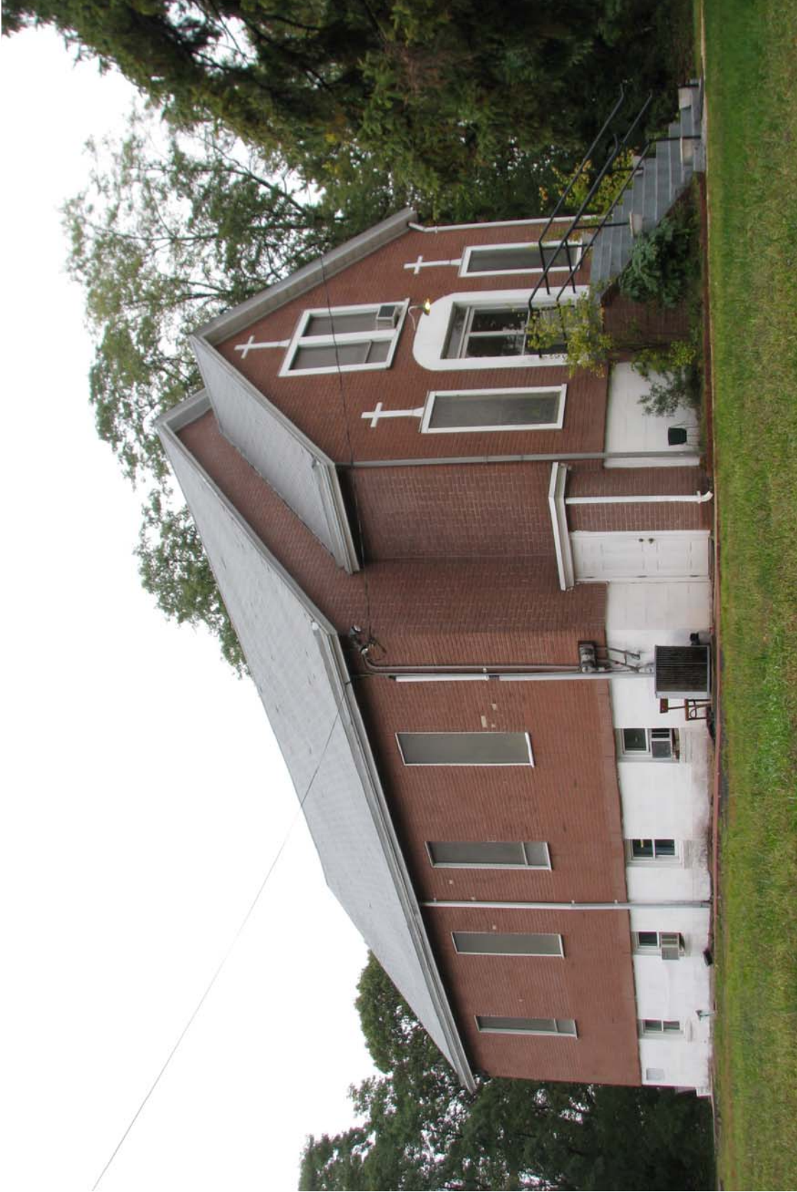
Rossville AME Zion Church View from the southeast