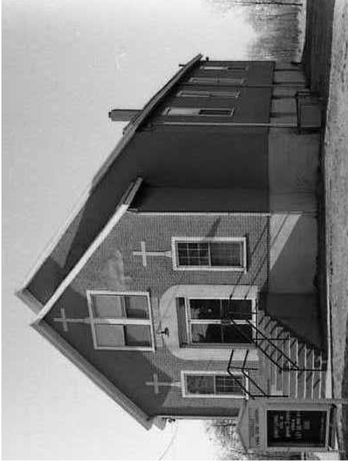
Rossville AME Zion Church