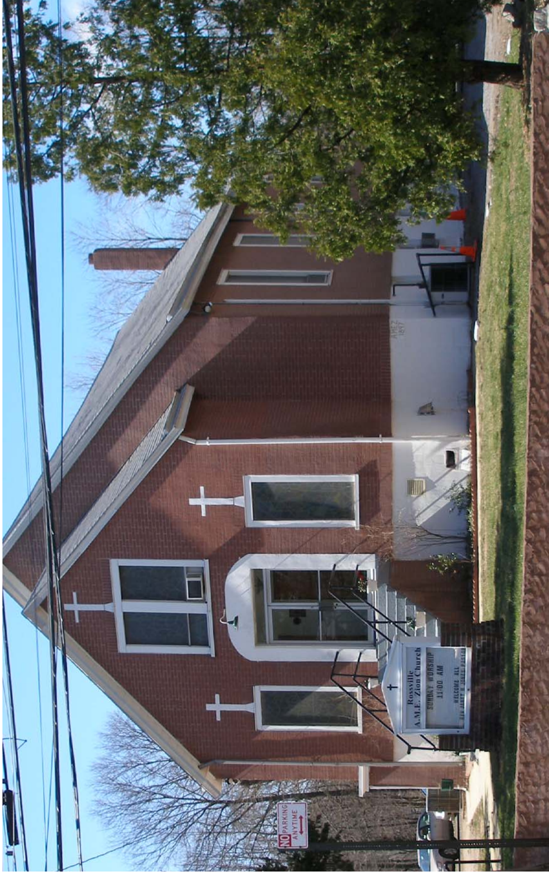
Rossville AME Zion Church 584 Bloomingdale Road, Staten Island Landmark Site: Staten Island Tax Map 7267, Lot 101 Photo: Marianne Percival, March 2010