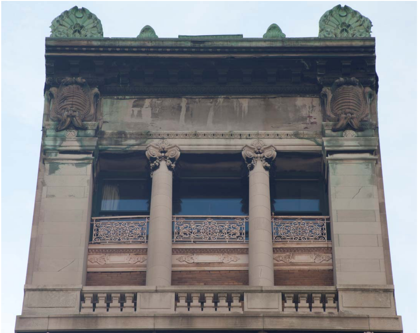
R.H. Macy & Co. Store, 14th Street Annex, upper section