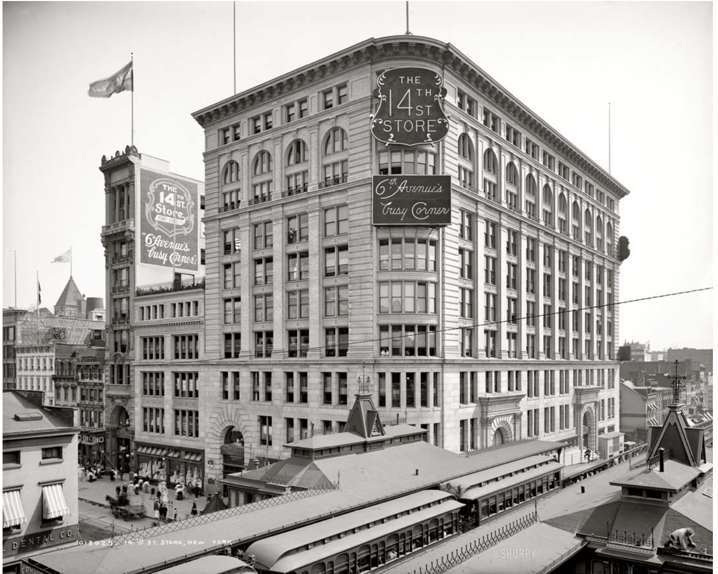
Former R.H. Macy & Co. Store, 14th Street Annex (left), as part of the 14th Street Store