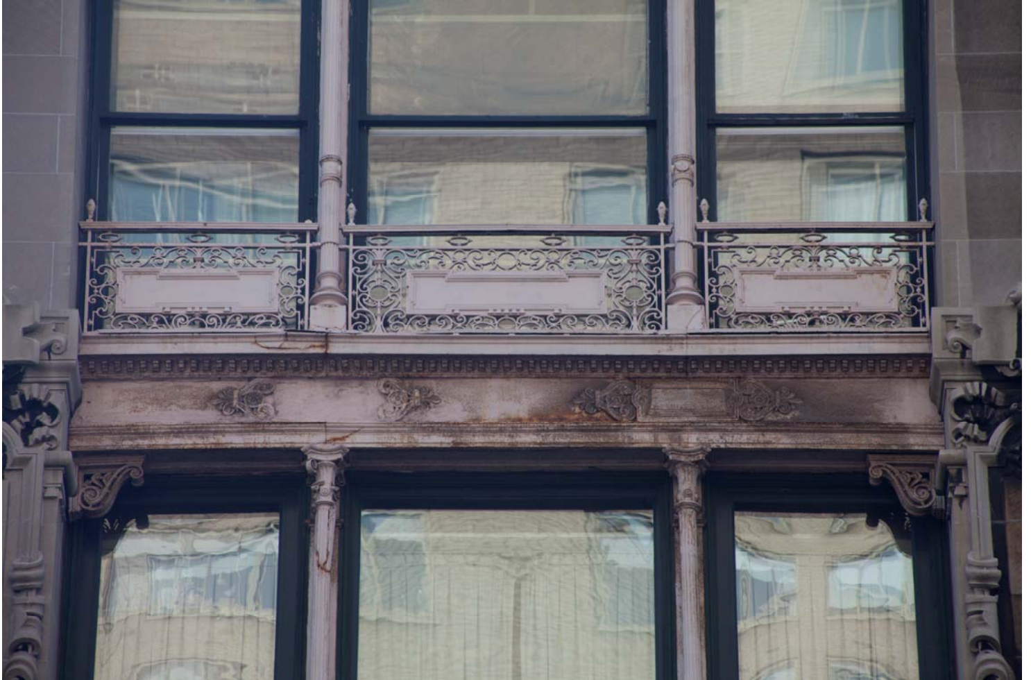
R.H. Macy & Co. Store, 14th Street Annex, fourth-fifth stories