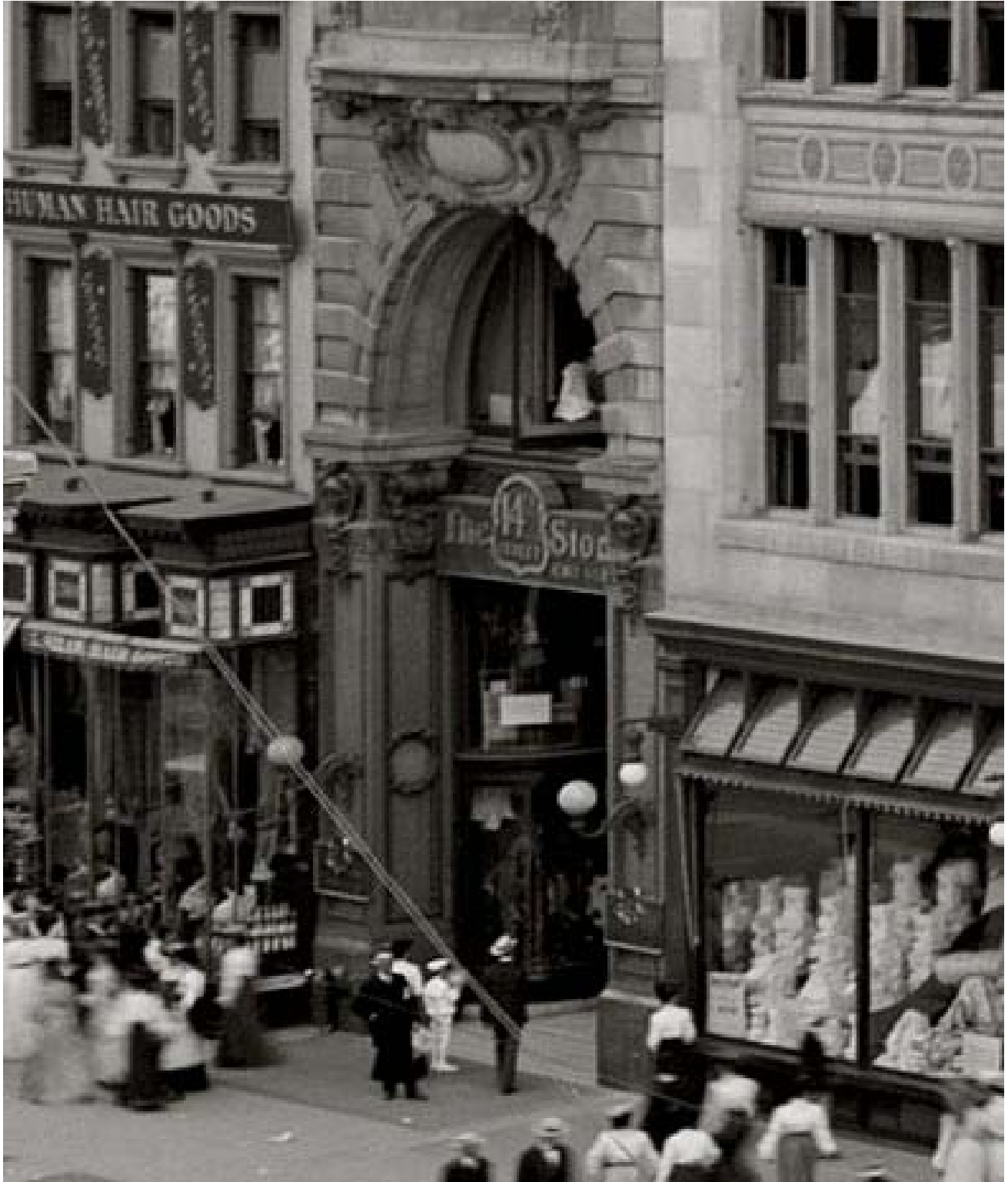
R.H. Macy & Co. Store, 14th Street Annex, historic storefront