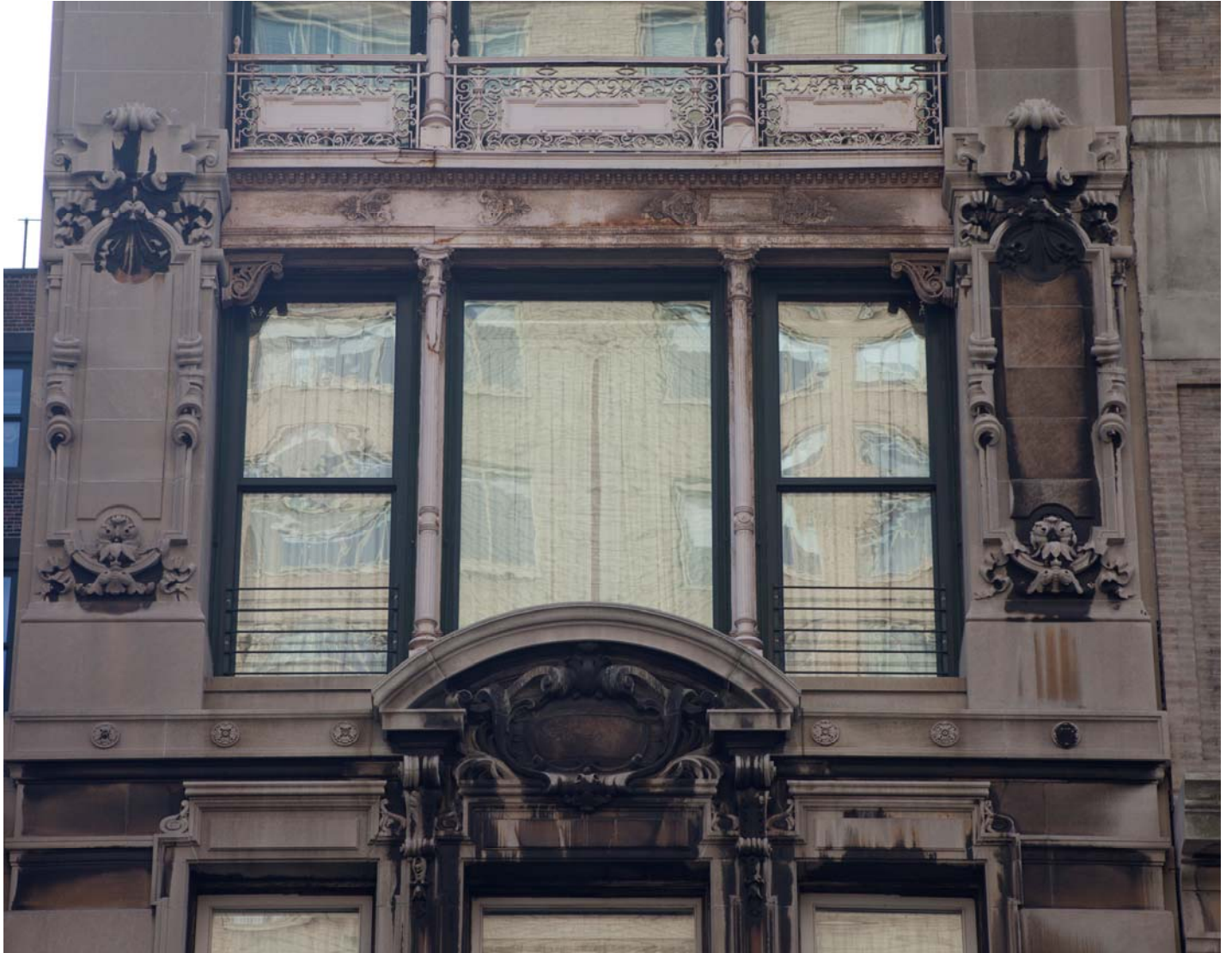
R.H. Macy & Co. Store, 14th Street Annex , fourth story