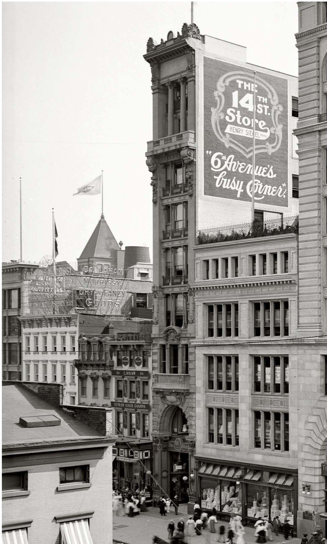
R.H. Macy & Co. Store, 14th Street Annex, 56 West 14th Street, Manhattan