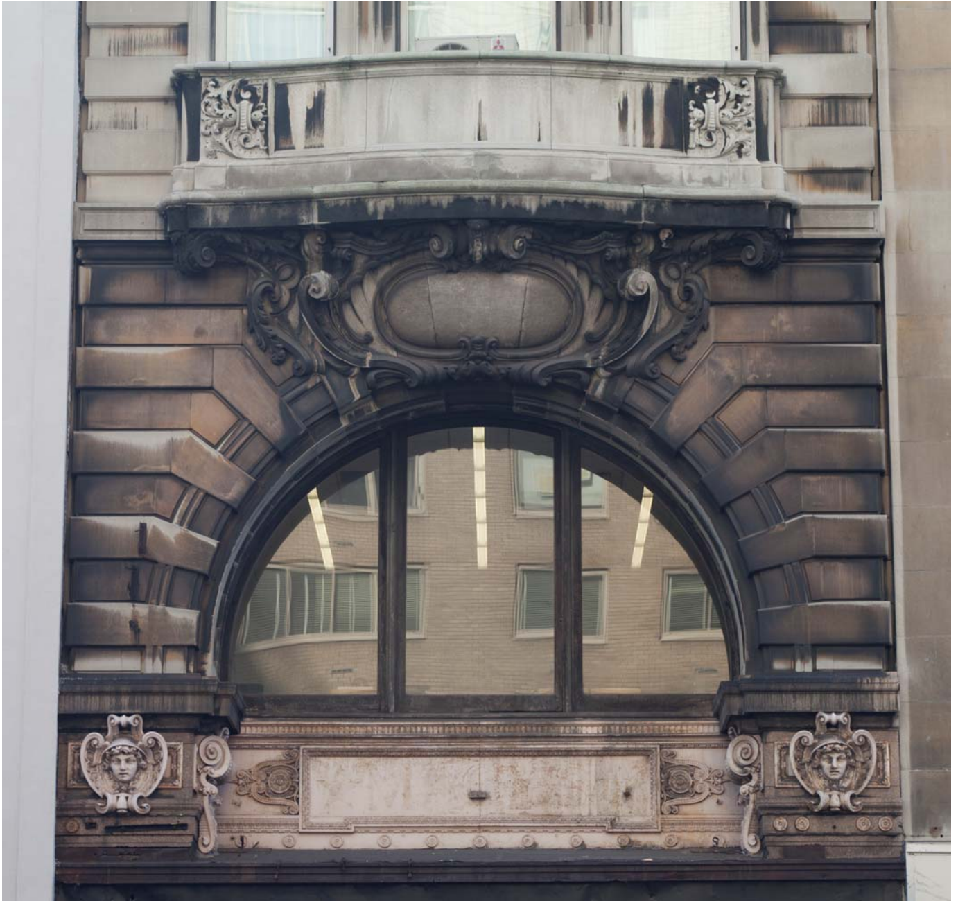
R.H. Macy & Co. Store, 14th Street Annex , second story