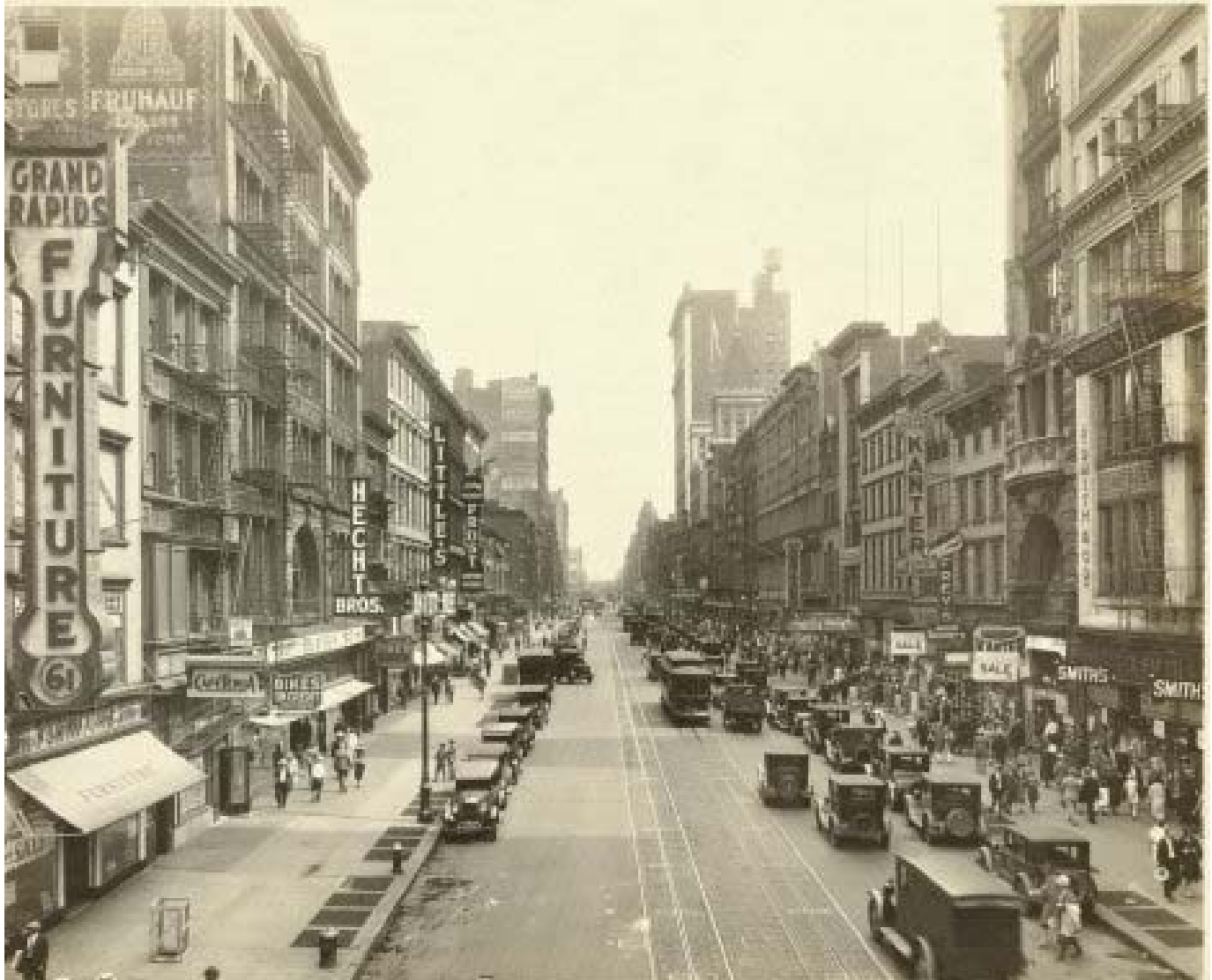
Former R.H. Macy & Co. Store, 14th Street Annex (right) in 1926