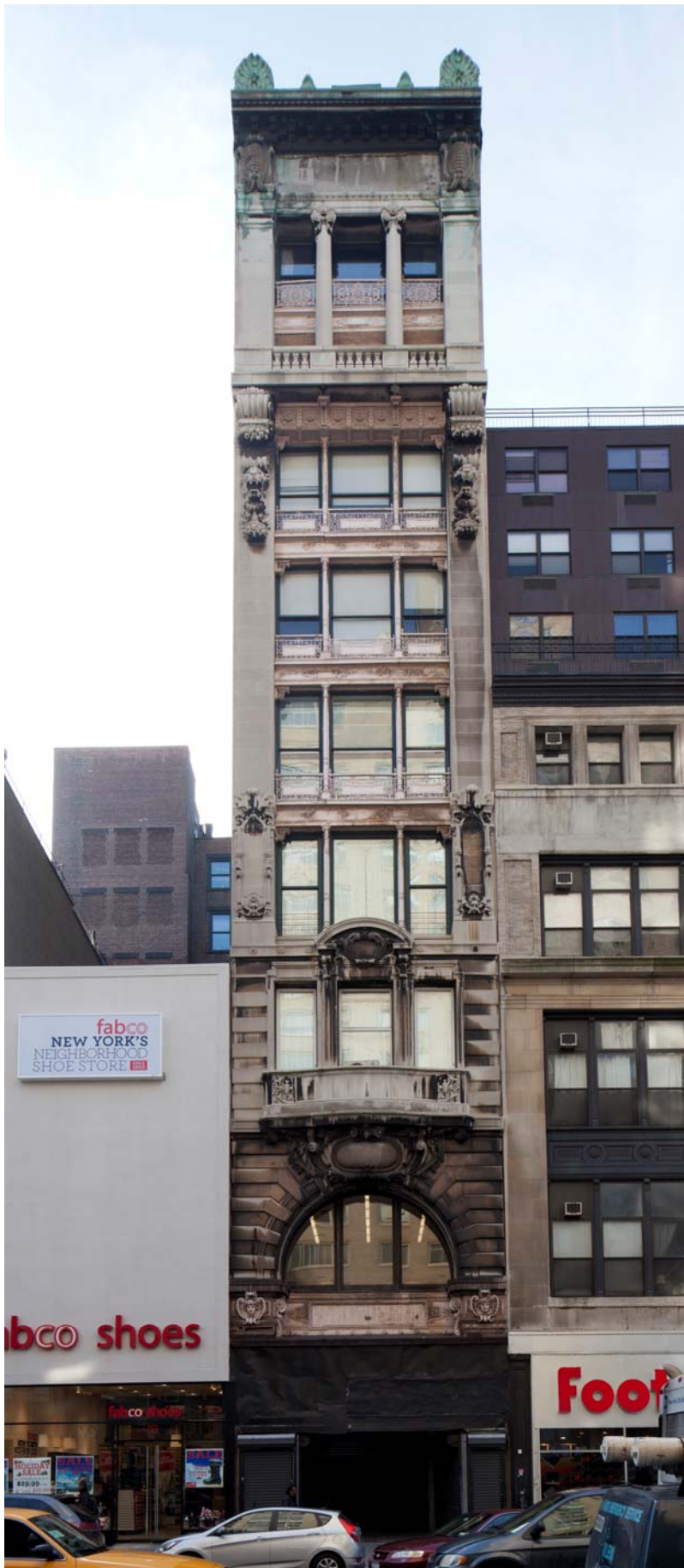
R.H. Macy & Co. Store, 14th Street Annex