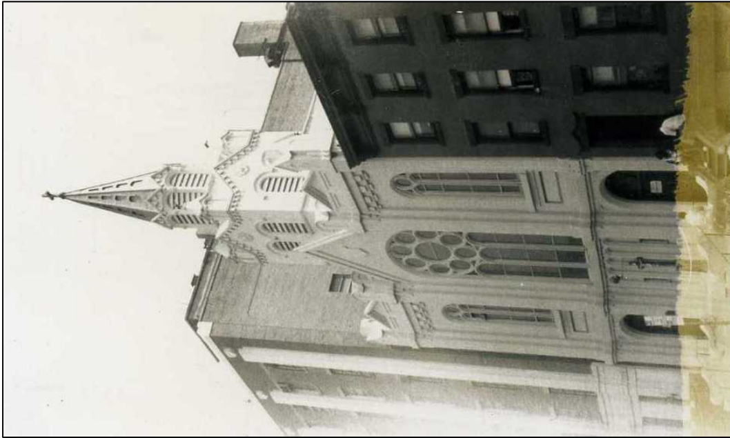
St. Casimir's Roman Catholic Church (now The Paul Robeson Theatre), c. 1940 (left) and c. 1976 (right)