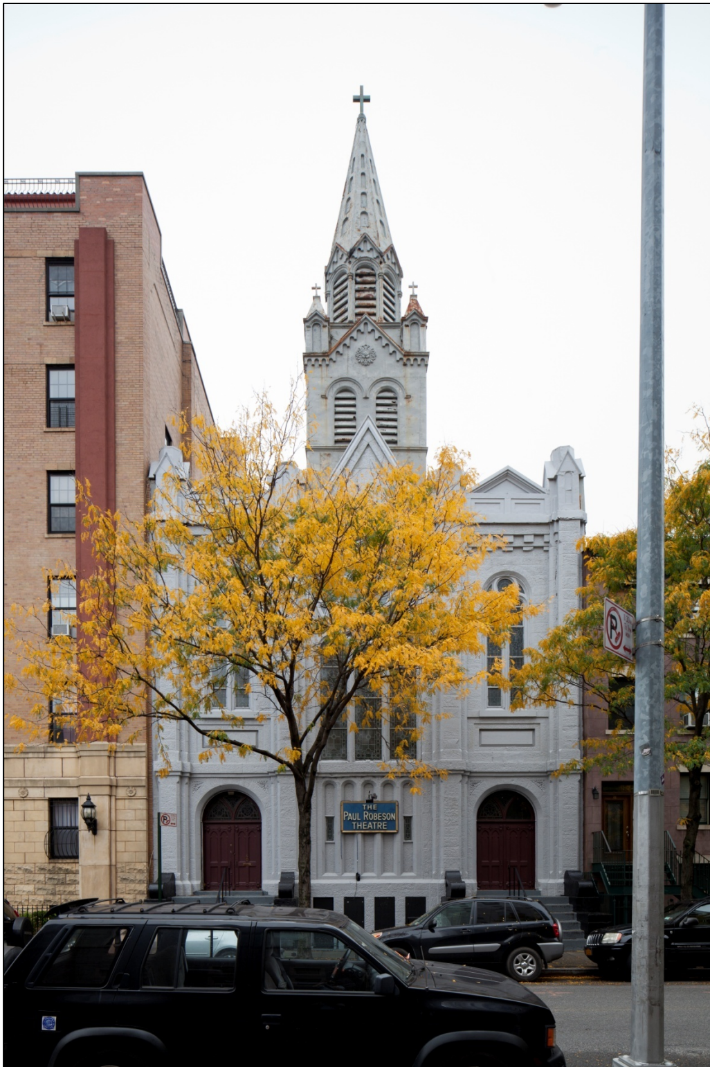
St. Casimir's Roman Catholic Church (now The Paul Robeson Theatre) 40 Greene Avenue (aka 40-44 Greene Avenue) Brooklyn, Block 1957, Lot 28