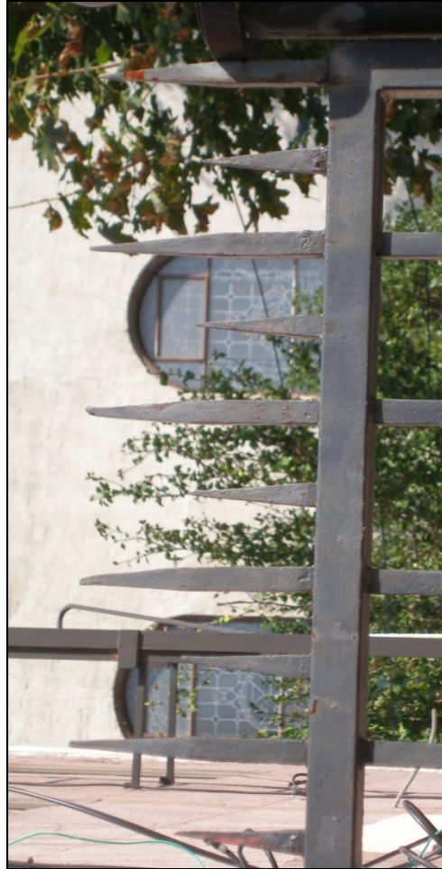
St. Casimir's Roman Catholic Church (now The Paul Robeson Theatre) Nave and sanctuary windows