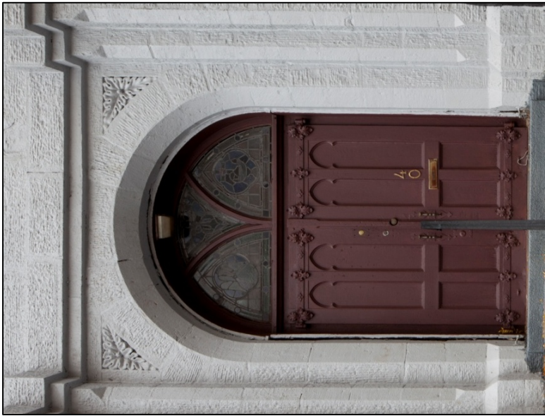
St. Casimir's Roman Catholic Church (now The Paul Robeson Theatre)