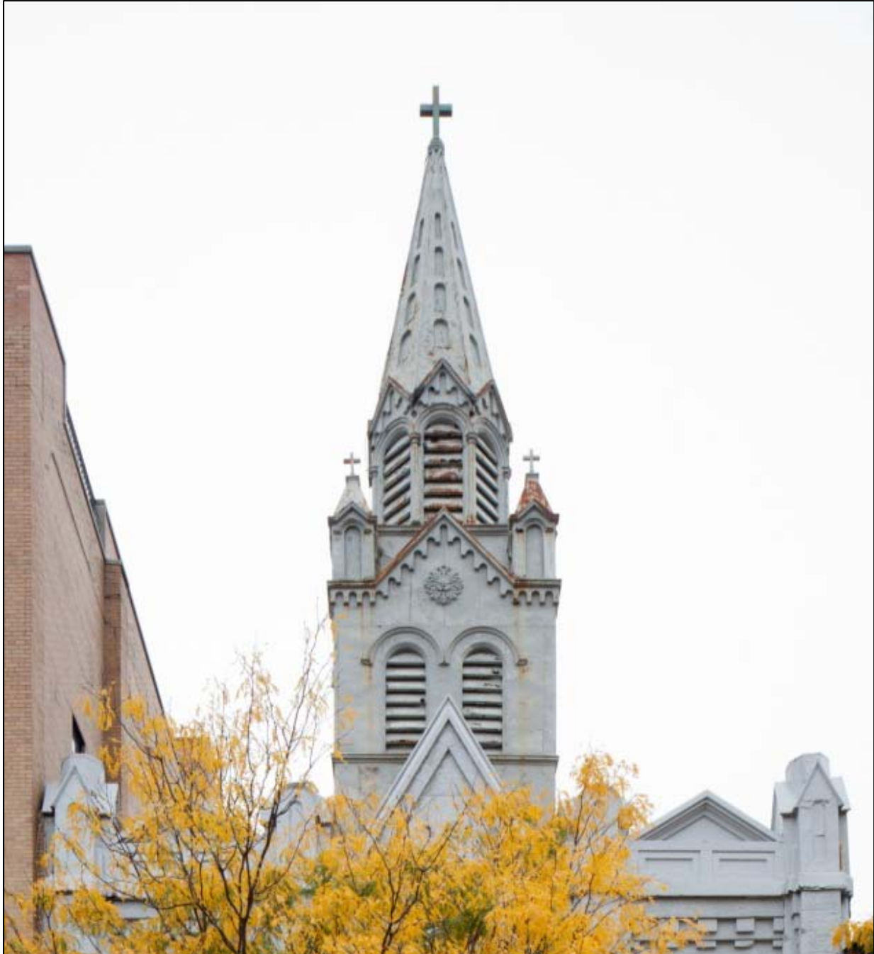
St. Casimir's Roman Catholic Church (now The Paul Robeson Theatre) Parapet and steeple