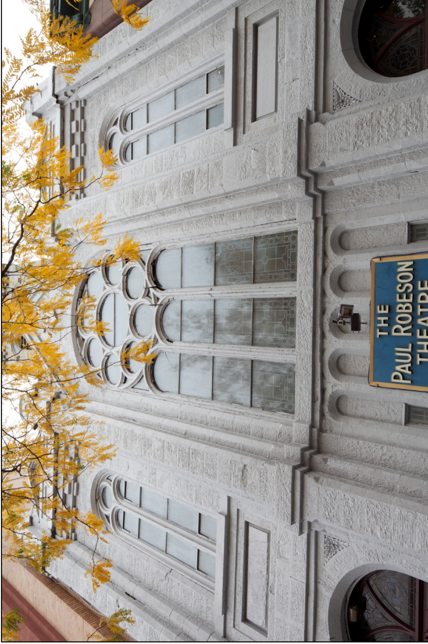
St. Casimir's Roman Catholic Church (now The Paul Robeson Theatre) Windows